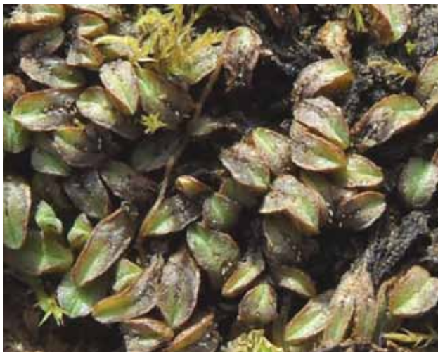
△ Riccia macrocarpa (Ribeira de Odelouca, January 2012).