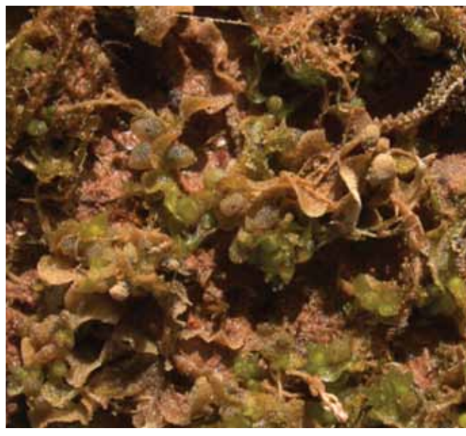
△ Top The Riella pond at Santa Catarina, photographed during the meeting.

△ Bottom Riella notarisii with sporophytes (ovoid structures, some turning black as the spores ripen) (Quinta do Freixa, March 2007).