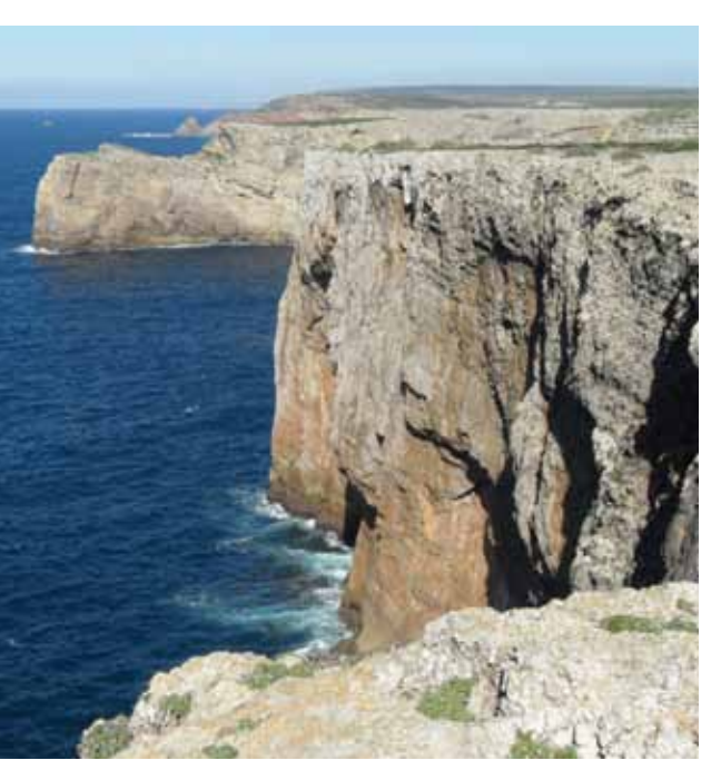
△ The cliffs at Cape St Vincent, to the north of the lighthouse, January 2012.

The final venues of the day were near Benafim to the east of Alte, first at Quinta do Freixo, where Roy had found Riella notarisii in March 1988 (it was still present at this site when visited by DGL in March 2007), then by Ribeira Algibre where it is crossed by the road running south from Benafim. The banks of the Ribeira Algibre had many of the species seen at Alte, along with Leptodon smithii , Scorpiurium sendtneri , Pterogonium gracile and some very fine Funariella curviseta .