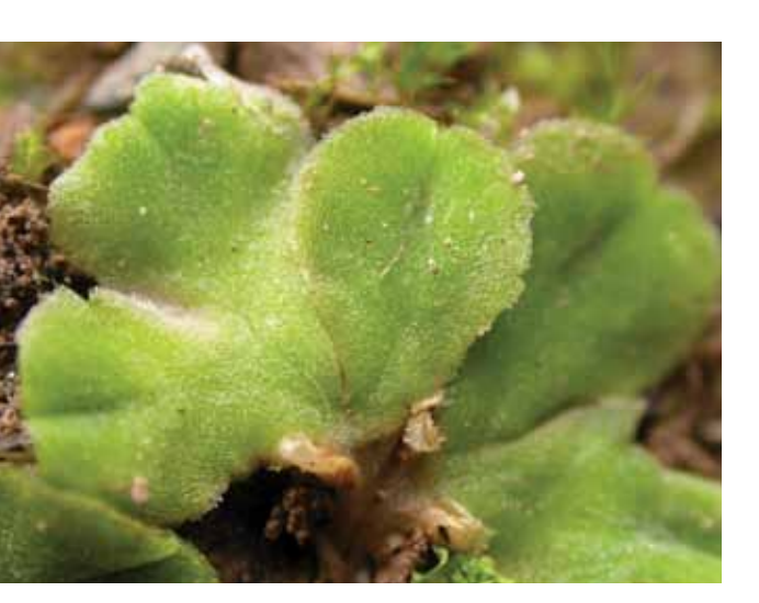
△ Riccia gougetiana (Cerca dos Pomares, January 2008).