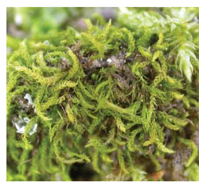
△ Cladopodium whippleanum (Foz do Sopro, March 2012).