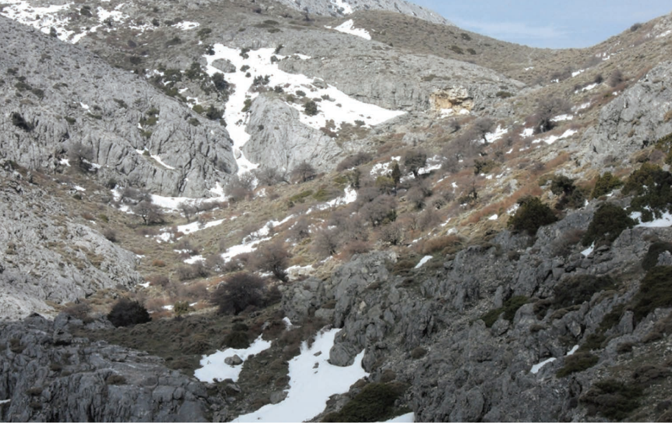
△ Fig. 5: Mt Kerkis on the island of Samos, habitat of Syntrichia papillosissima and S. handelii . T. Blockeel