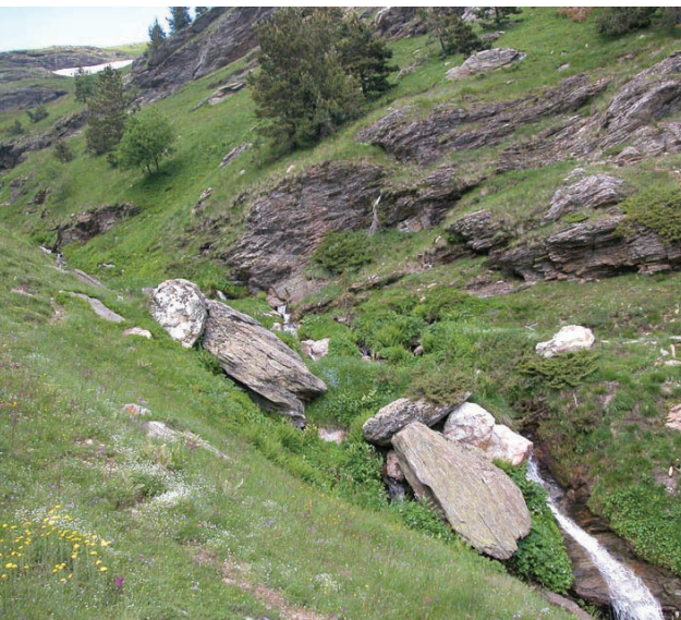
▽Fig. 11: Mica-schist on Mt Voras. T. Blockeel

Since 2003 I have made short visits to many of these mountains, as well as the northern Pindus and Mt Olympus. There is no space here to describe the bryophytes of these mountains in detail, but I have selected some highlights.