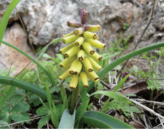
◁Fig.16: Muscari macrocarpum on Samos. T. Blockeel