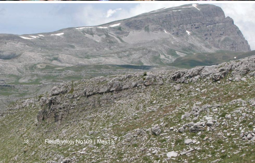
▽ Fig. 7: Limestone in the upper zone of Mt Timfi. T. Blockeel