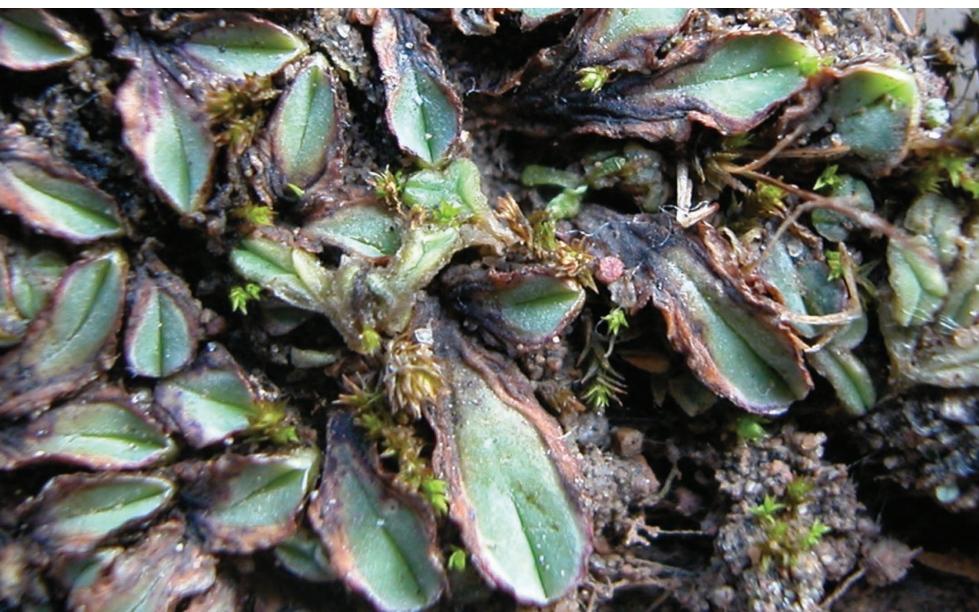
◁ Fig. 6: Riccia sommierii from Lesvos. T. Blockeel