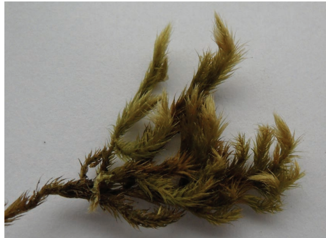
△Fig. 10: Herbarium specimen of Palamocladium euchloron from the Enipeas Valley, Mt Olympus. T. Blockeel