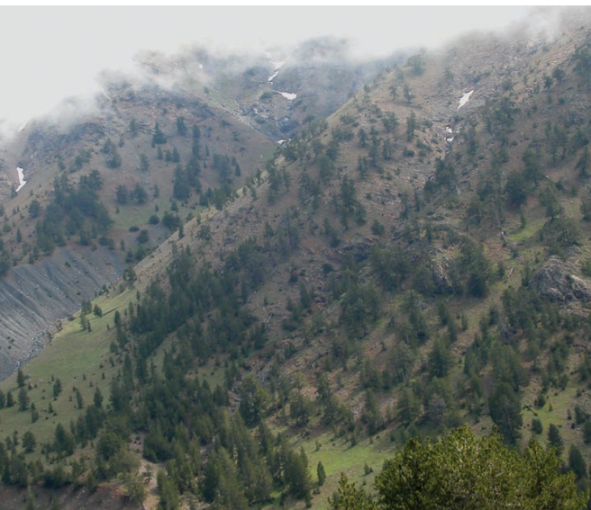
▽Fig. 8: Mt Smolikas. T. Blockeel