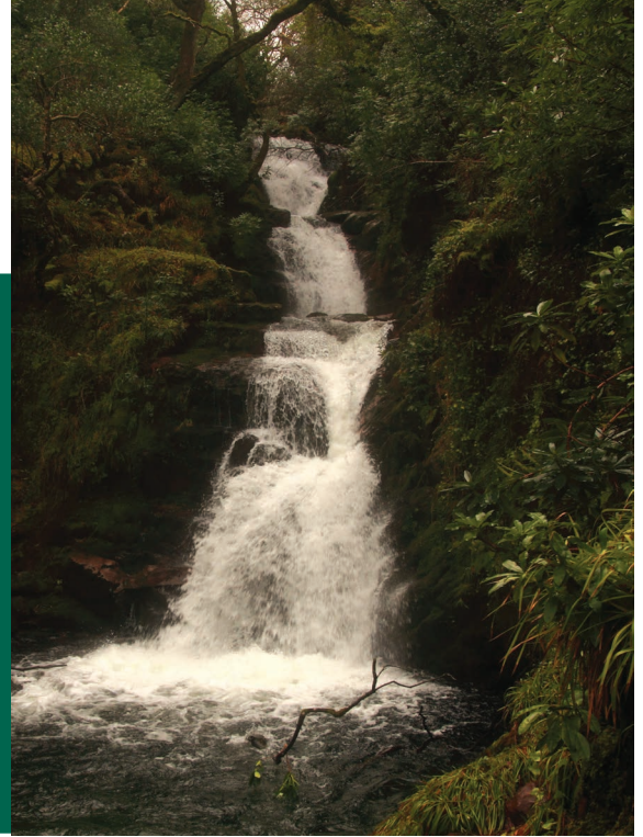
△Fig. 1: O'Sullivan's Cascade in Killarney National Park - a site for Calypogeia suecica.