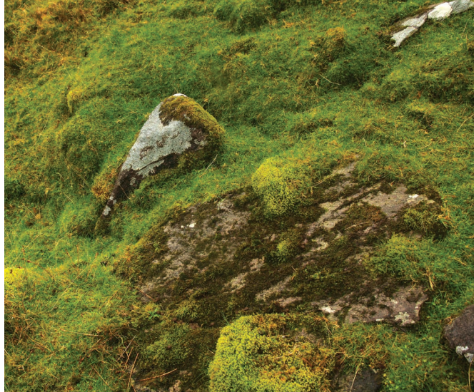
△Fig. 5: Daltonia splachnoides ; a new altitude record at 620 m a.s.l. R Hodd

Lejeunea patens . 46: On tarmac at edge of minor