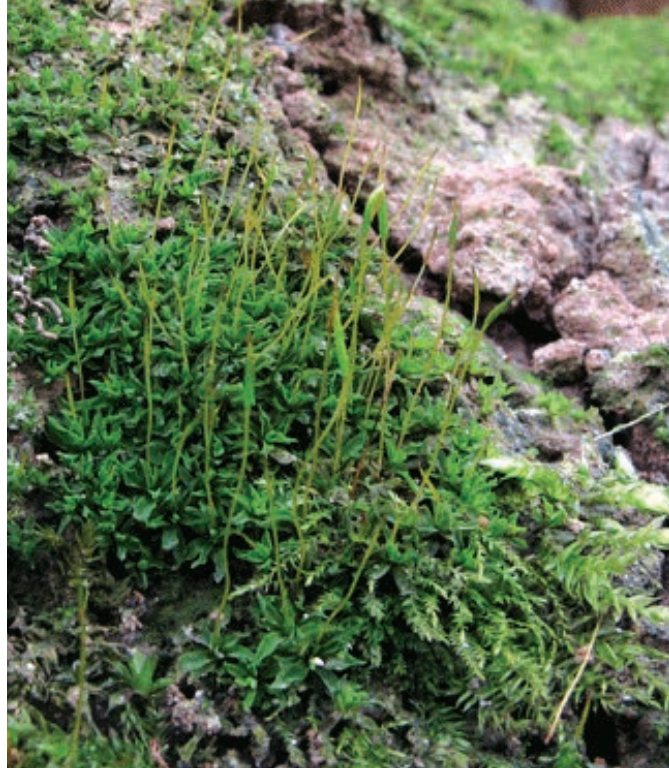
△Fig. 2: Tortula vahliana . R Fisk

Douinia ovata . H20: Crevice in north-facing granite boulder, 480 m alt., Turlough Hill,