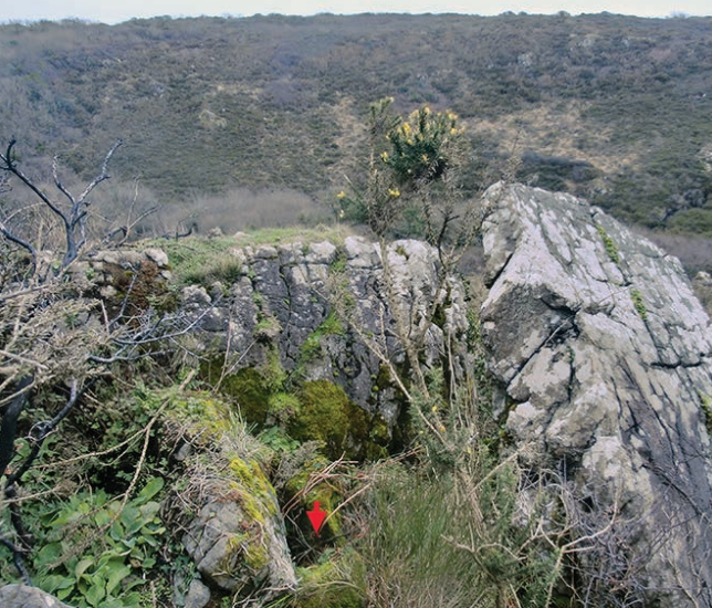
△Fig. 4: Lejeunea mandonii growing within the recesses of serpentine outcrops on heathland. D Callaghan

km west of this site; the first for v.c. 24 was 3 km north of that.