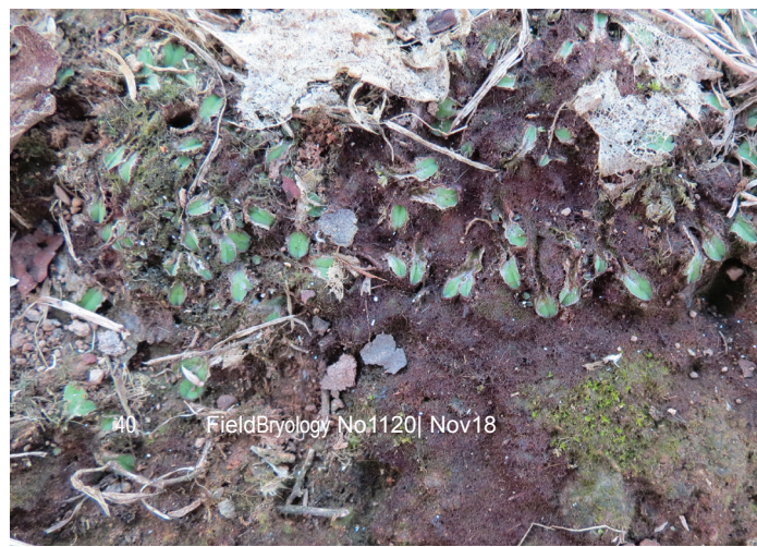
◁Fig. 9. The critically endangered liverwort Riccia ridleyi growing on a shaded bank near the Baía dos Golfinhos trail.

The island’s vegetation is characterised by Dry