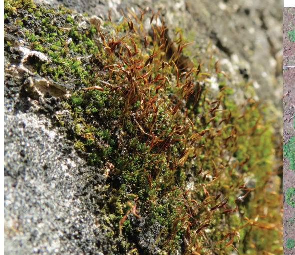
△Figs. 19, 20. The abundantly fertile Hyophiladelphus agrarius on a brick wall.

taxa, e.g. Notothyladaceae, Ricciaceae, Bryaceae, Fissidentaceae, Pottiaceae, Splachnobryaceae, is in sharp contrast to the very low numbers of corticolous ones ( Calymperes palisotii , Frullania ericoides and L. laetevirens ).