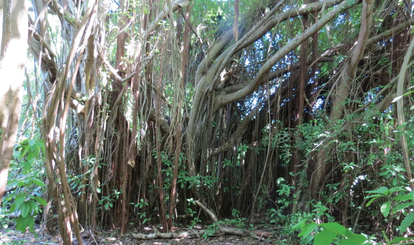
△Fig. 8. The endemic Ficus noronhae is an important substrate for corticolous bryophyte species and also provides shade for terricolous ones.

and this is so thickly intertwined that it requires great exertion to crawl along. — The scenery was very beautiful, and large magnolias and laurels and trees covered with delicate flowers.....”. H.R. Ridley visited the archipelago some 55 years after Darwin, on board of the steamship Nasmyth from Pernambuco, and spent a month there, gathering several important natural history collections including botanical collections with six bryophytes later identified by A. Gepp (Ridley, 1890), which are now housed in the Natural History Museum herbarium.