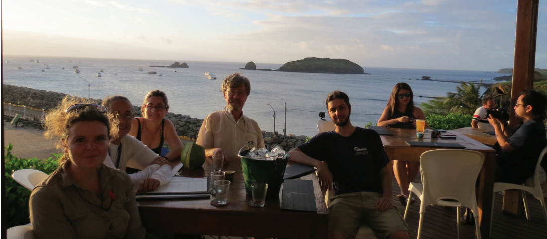
△Fig. 25. The team relaxing after a hard day's work by one of Fernando de Noronha's beautiful beaches.