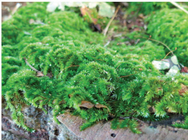
▽Figs. 17, 18. Some of the fertile species found on the island during our survey: Entodontopsis leucostega (left), Calymperes palisotii (right).