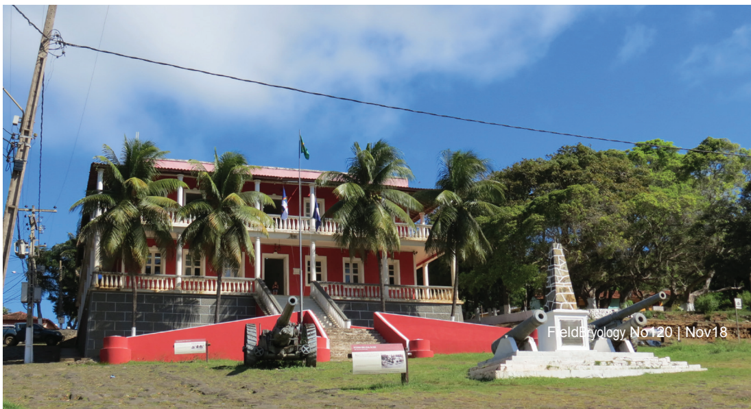
▽Fig 7. The City Hall of Fernando de Noronha in Vila dos Remédios.

1770 (Figs. 5–6). Human occupation, as it is most often the case especially on small islands, led to the wholesale clearing of trees (Pressel et al. , 2017), to make space for grazing animals and, allegedly, to prevent prisoners from building rafts and escaping their captivity, resulting eventually in the near obliteration of the original vegetation (Teixeira et al. , 2003). Nevertheless, at the time Charles Darwin briefly visited Fernando de Noronha in 1832, during the voyage of the Beagle , there were still enough trees and vegetation to impress him, by contrast to the ‘cinder’ of Ascension Island which he visited in 1836 (Darwin, 1839; Pressel et al. , 2014). Indeed, in his account of his visit to Fernando de Noronha Darwin wrote: “The whole island is one forest,