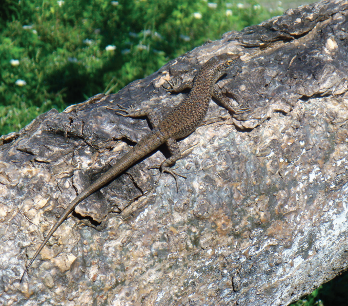
△Fig 3. The endemic lizard Mabuya atlantica .