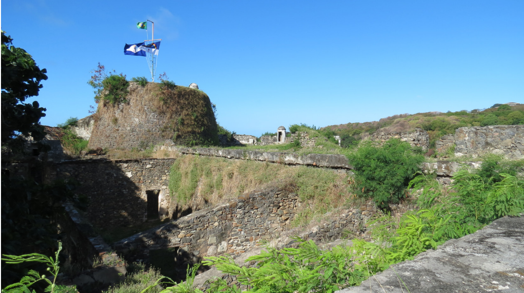
△Fig. 6. Forte dos Remédios.

archipelago was eventually named after Loronha. The expedition was accompanied by the Italian explorer and cartographer Amerigo Vespucci, who provided the first description of Fernando de Noronha, or St Lawrence as he named it: “We found this isle to be uninhabited, with many living springs of fresh water, innumerable trees, full of so many birds of the sea and land that they were without number...” (Vespucci, 1504).