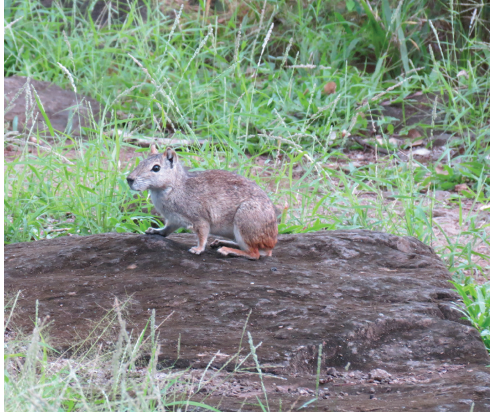
△Fig. 10. The introduced Kerodon rupestris near the trail of Baía dos Golfinhos.

The introduction of numerous species during the last 400 years has led to a dramatic change in the island's terrestrial ecosystem (Pessenda et al. , 2005). A few localities still hold their original