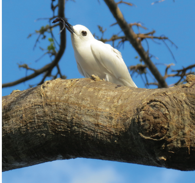
△Fig 4. The white (or fairy) tern Gygis alba .

°C and an average annual rainfall of 1,350 mm. The rainy season is from February to July, with the most rainfall in March and May and a dry season stretching from August to January (Almeida et al. , 2002; Montenegro et al. , 2009). The archipelago consists of 21 oceanic volcanic islands, with a total area of 26 square kilometres and a sea depth of 4000 m. The highest point is Morro do Pico on the main island, at 400 m a.s.l. The archipelago is biologically rich and diverse, with a considerable number of endemic vertebrates. It is also a very important breeding and feeding ground for many marine bird species in the Atlantic Ocean (ICMBio, 2013) as well as for dolphins such as the spinner dolphin ( Stenella longirostris Gray) and other marine species