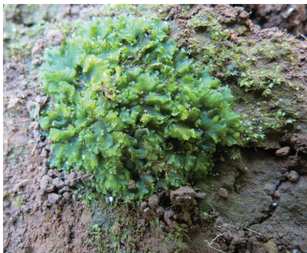
△Figs. 22, 23. Extensive patches of Notothylas spp. covering the soil by the suspended trail. Detail of Notothylas spp.

compared to their mainland counterparts. We have seen sporophytes only in one hornwort ( Notothylas orbicularis ) and three mosses ( Calymperes palisotii , Entodontopsis leucostega and Hyophiladelphus agrarius ) in our survey. Except for N. orbicularis , which is restricted to the state of Pernambuco, all other species are widespread in Brazil and are often found bearing sporophytes (Figs. 17–20).