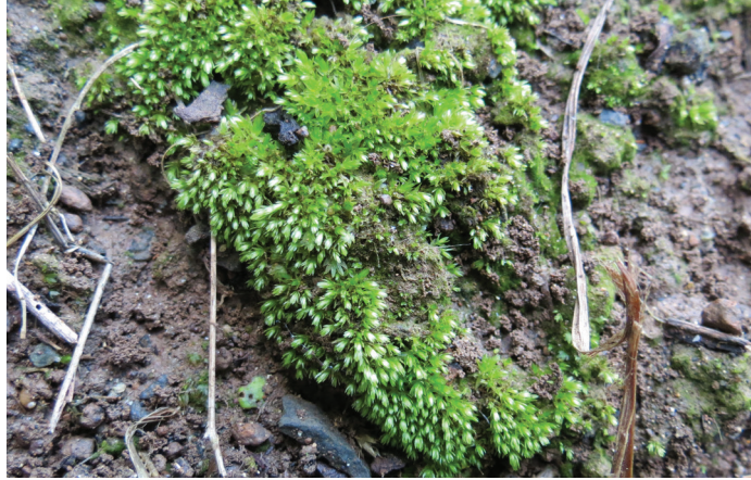
▷Figs. 14–16. Common rupicolous species found on the island: Bryum sp. (top) Plaubelia sprengelii (middle) and Splachmobryum obtusum (bottom).