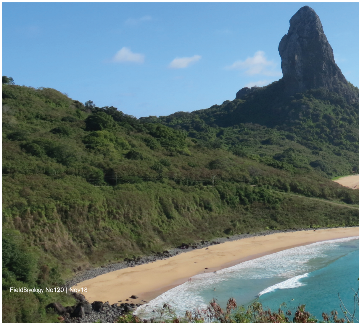
▽Fig. 26. Morro do Pico, the highest point of Fernando de Noronha.

Abdala, G. (2008). Estudo de Determinação da Capacidade de Suporte de Fernando de Noronha – Produtos 3 e 4.