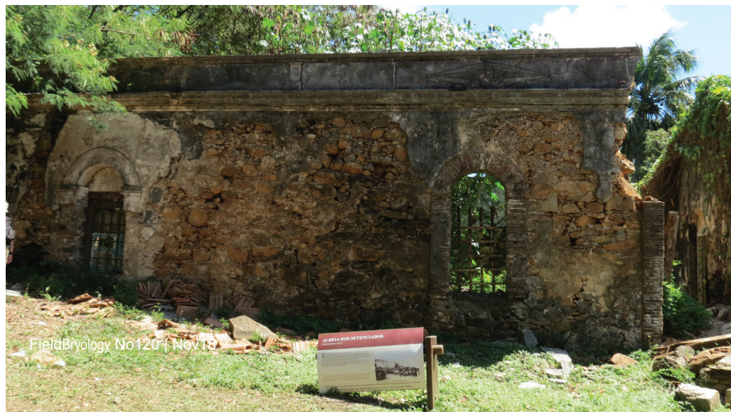
▽Fig 5. Some of the ruins of the prison in Aldeia dos Sentenciados.

While controversies still abound on the exact timing of its discovery and those responsible for this, it is generally accepted that the archipelago was officially discovered in 1503 by an expedition led by Captain Gonçalo Coelho and financed by the rich Lisbon merchant Fernão de Loronha. The