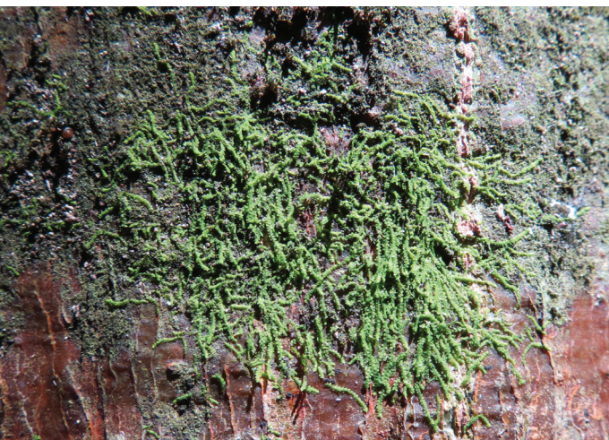
<Fig. 11 (top). A typical Fissidens bank. Figs. 12, 13 (middle and bottom). The only two corticolous liverwort species, Frullania ericoides (middle) and Lejeunea laetevirens (bottom).

were made by Ridley (1890), who collected six species, five mosses and one liverwort, the latter named by Gepp (1890) in his honour Riccia ridleyi Gepp, with the original material housed at Geneva (Fig. 9). One hundred and one years later, the first bryological survey was published by Vital et al. (1991), citing 22 species of bryophytes (3 liverworts, 17 mosses and 2 hornworts).