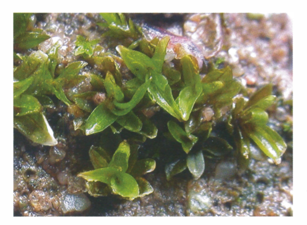
Figure 4. Close-up of Tortula amplexa at Eardington.

a very restricted global range, currently thought to comprise western Canada (British Colombia & Manitoba), the western USA (Arizona, California & Washington) and the UK (Zander & Eckel, 2005) {incidentally, Zander & Eckel return it to T. amplexa, following Cano & Gallego (2003), rather than Syntrichia amplexa where Zander referred it in 1993}. When its only known European colonies were in day pits in one tiny area in central England, owned at one time by firms with links to north America, it seemed almost inevitable that T. amplexa was an introduction to Britain, possibly arriving on imported quarrying machinery (English Nature introduced species audit, from www.brc.ac.uk). The Shropshire colony could easily have originated from Leicestershire, as the French-owned company that owns the Eardington pit operates numerous sand and clay pits throughout Britain, including Leicestershire; indeed it may have come in directly with clay and gravel for readymix production. Alternatively, though, T. amplexa could be a rare native plant of bare, clayey ground that has been overlooked as an odd, non-fertile Pottia or a large Barbula. The disjunct distribution of T. amplexa, comprising Western Europe and Western North America, is shared by several species, albeit mostly with southerly distributions, including Tortula bolan-