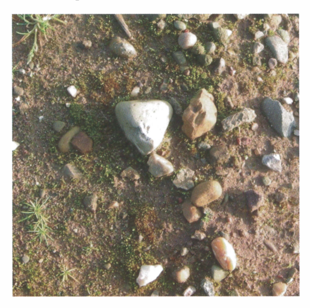
Figure 3. Tortula amplexa at Eardington.

The discovery of Tortula amplexa in Shropshire raises the question of its status in Britain. It has