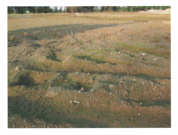
Figure 2. Habitat of Tortula amplexa at Eardington.

ed given the habitat favoured by Tortula amplexa at its Leicestershire sites. The search was widened to take in other parts of the pit, including one very clayey hollow, criss-crossed by vehicle ruts, at SO72418995 (Figure 2). Almost immediately, patches of female T. amplexa were found among the sparse bryophytes on the sides of these ruts. Most of these stood out from the associated bryophytes because of their red-brown colour (Figure 3) and blunt-tipped, lingulate leaves, although a few were pale green (Figure 4). Outside the clayey hollow, the ground became sandy again and T. amplexa disappeared, although two patches were noted a little way to the north (on the edge of the sand pit at SO72469003).