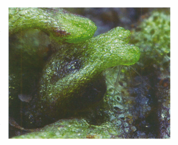
Figure 1. Riccia huebeneriana showing development of sporophyte on underside of thallus.

The habitat of R. huebeneriana is very characteristic, the plants being confined to exposed, non-calcareous soil at the edge of freshwater bodies, especially reservoirs (Paton, 1999). Other bryophytes that have been noted as growing within close proximity of this liverwort include Aphanorhegma patens , Dicranella staphylina , Fossombronia won draczekii , Leptobryum pyriforme , Pseudephemerum