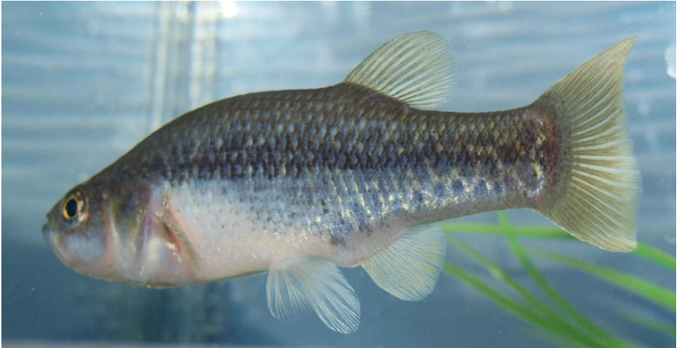
robustus