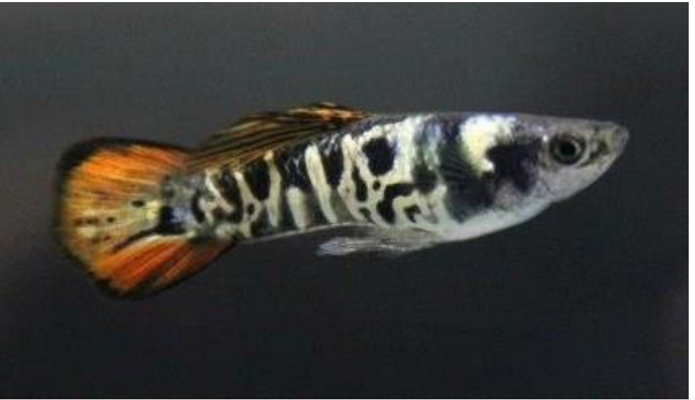
Guppy Copyright Alan Dunne Convention 2012