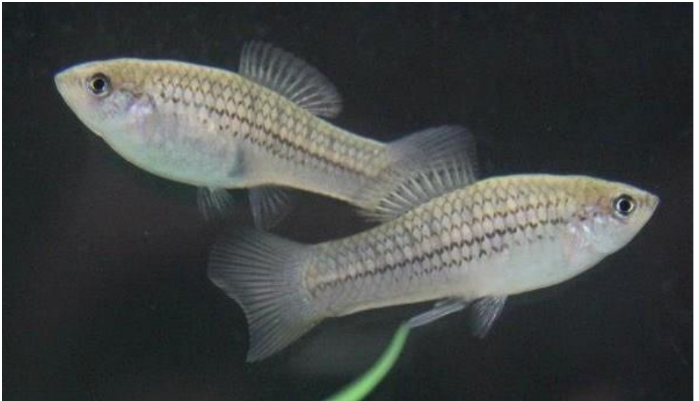
Xiphophorus nexycoytl