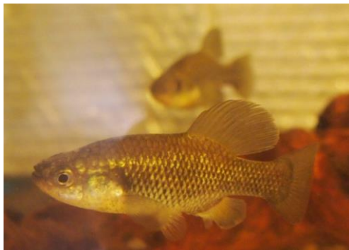
Characodon audax 'el toboso' Homemade filter