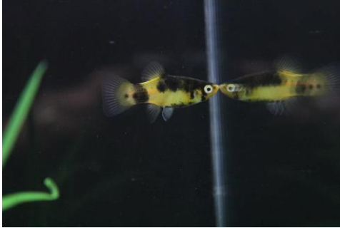
Bumble bee platy