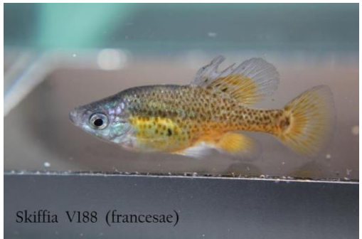
Skiffia V188 (francesae)