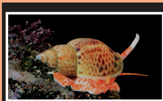
Live Babylonica papillaris .