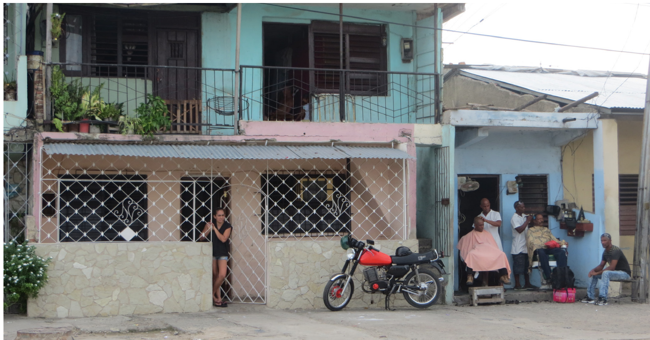
Photo: Open air barber salon, Santiago de Cuba.

Nominal wages in the state sector in Oriente are significantly lower than those available in Havana (Table 4), especially in Guantánamo. True, the cost of living in Havana is higher and migrating Orientales encounter various prejudices (ethnic because of their Afro-Cuban appearances, locational snobbism because of their provincial upbringings and accents). But Havana also offers opportunities in tourism, the emerging private sector, gray-area hustling, and even in illegal activities.