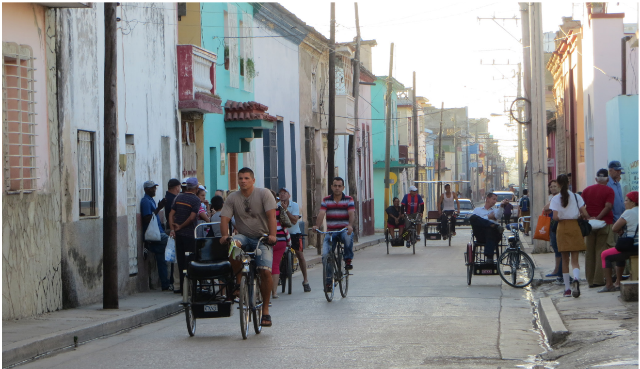
Photo: Holguin, Cuba.

Cuban authorities are aware of these development opportunities and challenges. They also recognize that Cuba cannot succeed alone, that the island will have to import capital, technology, management, and marketing skills to realize its national objectives. In the latest edition of its biennial publication, “Portfolio of Opportunities for Foreign Investment 2018-2019,” the Ministry of Foreign Trade and Investment lists 525 projects of interest, as identified by the Havana-based ministries. 33 For the first time, this edition includes a section cataloging the projects not only by economic sector, but now also by province. Although only 15% of the 525 projects are allocated to the five eastern provinces, the proposed projects do recognize the region’s potential strengths. 34 For example, Santiago is considered apt for gourmet coffee processing, sugar-infused candies, soybean processing, and pasta noodle production. Holguin would profit from further investments in mining, bioelectrical (sugarcane biomass) generation plants, additional wind farms, fresh vegetables for export, and most prominently, various major seaside hotel installations. Bays in both provinces would benefit from expansion of recreational shipyards and solid waste management.