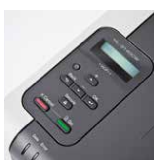
Easy-to-use navigation pad