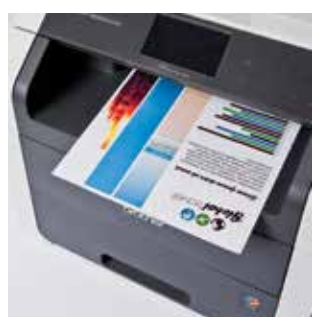
High quality prints every time

Operating: 365W Sleep Mode: 7W Ready: 70W Off: 0.05W