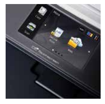
Easy-to-navigate touchscreen display