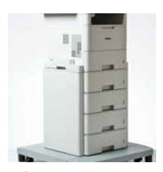
Cutomisable tray options