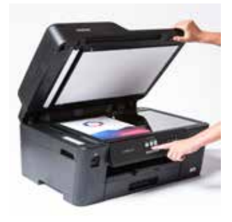
A3 scan and copy