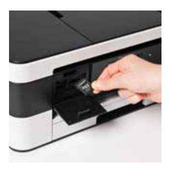
Print from USB flash drive or SD card