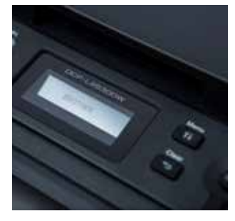
Easy-to-use operation and LCD display