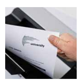
High quality mono print