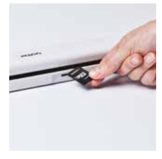
Scan direct to SD card*