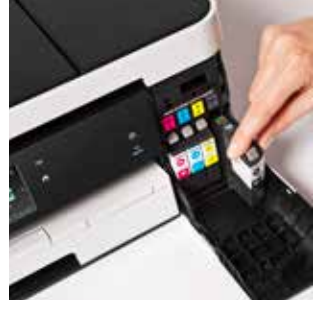
Convenient front loading supplies