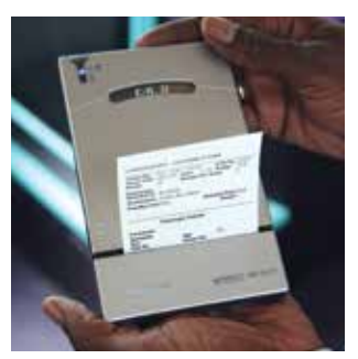
Lightweight, durable and compact