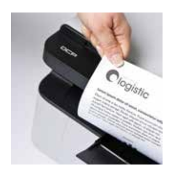
High quality mono prints