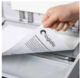
Built-in scan function helps digitise important documents