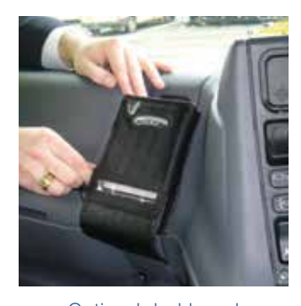
Optional dashboard mounted case