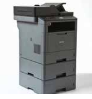
Customisable tray options