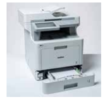
Advanced paper handling options expandable up to 2,380 sheets