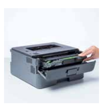
Easy to replace standard and high-yield toner cartridges