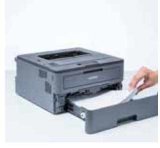
Longer lasting 250 sheet paper tray