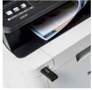
Print from/scan to USB