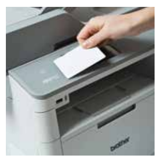
NFC enabled for mobile print and card authentication