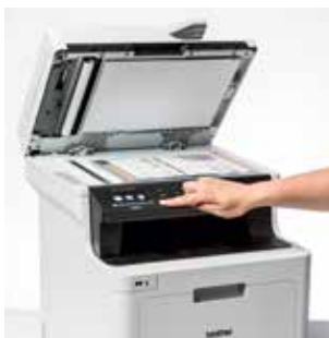
Convenient duplex copying and scanning**

**Duplex scan not available on the DCP-L8410CDW