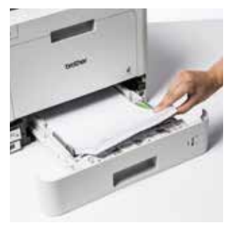
Optional accessories including additional paper trays to cater for your needs.

PCL6, BR-Script3 (Postscript®3TM Language Emulation)