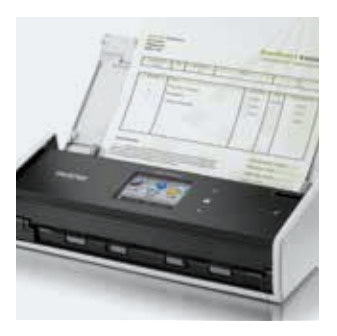
6.8cm touchscreen for easy access*