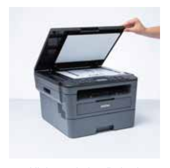
High resolution flatbed scanner