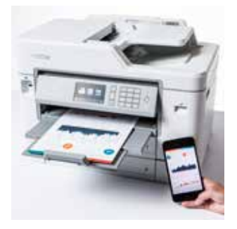
Print from/scan to mobile devices