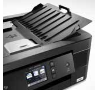
ADF (Automatic document feeder)