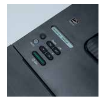
Easy-to-use operation and LCD display