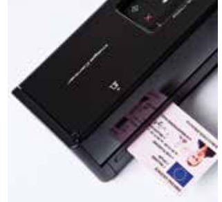
Ability to scan business/plastic cards