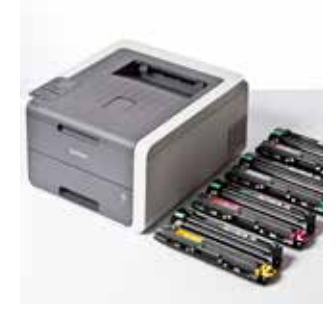
Individual toner cartridges means you only replace the empty one