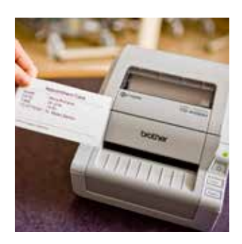
Clear address labelling