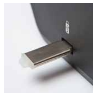
Scan direct to USB