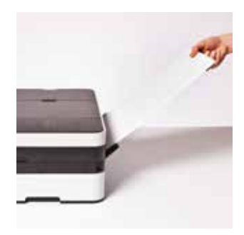
A3 manual feed slot for occasional A3 printing