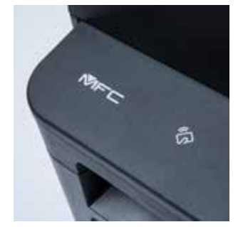
NFC Connectivity for secure print (MFC-L2750DW)