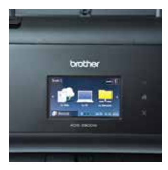
Intuitive 9.3cm LCD touchscreen*