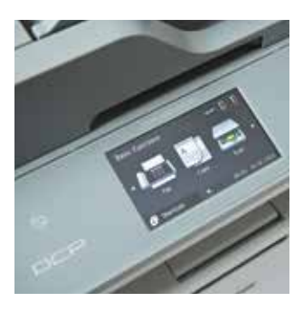
Large 12.3cm colour touchscreen