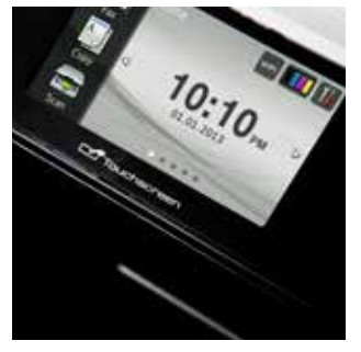
Easy-to-use navigation screen