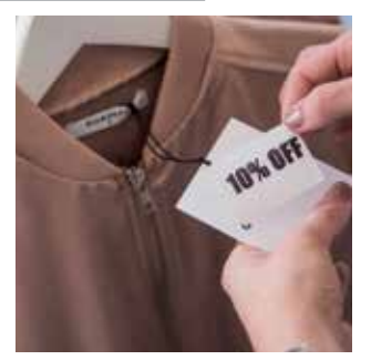
Compatible with many wireless devices