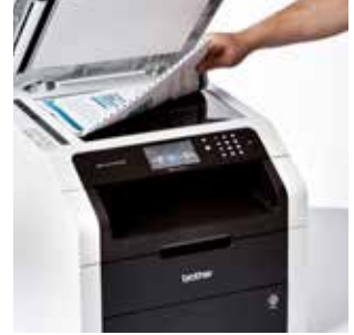
Automatic 2-sided print and copy as a standard