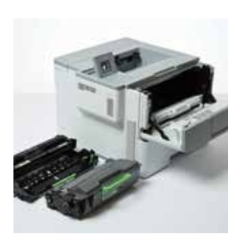
12,000 page super high-yield in-box toner