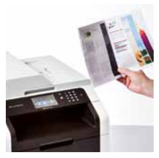
Ideal for high quality booklet printing