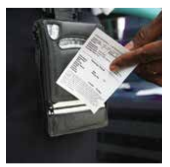
Ideal for printing tickets on the move