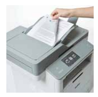
Automatic document feeder