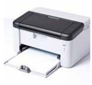
150 sheet paper capacity