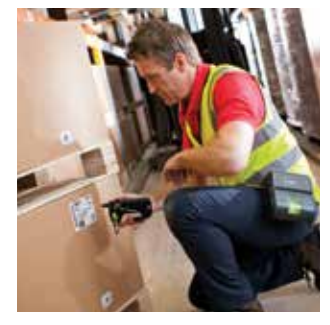
Produces clear, concise labels for easy reading using barcode scanners