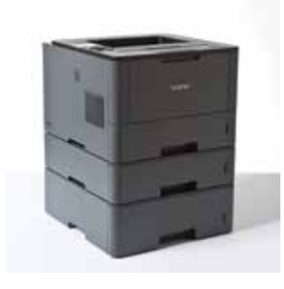
Customisable tray options