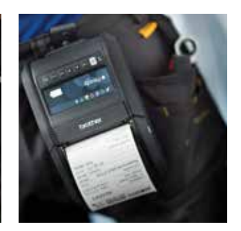
Ideal for printing receipts on the go