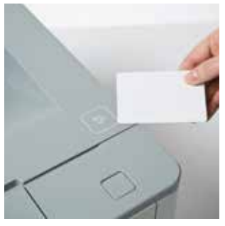
NFC enabled for mobile print and card authentication