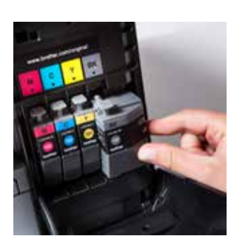
Convenient front loading supplies