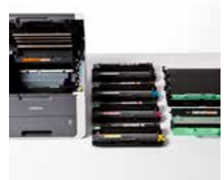
Separate toner and drum units are ideal for cutting costs