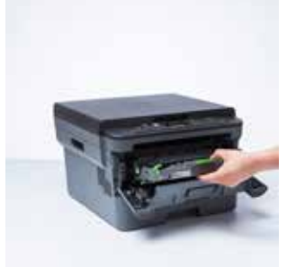
Easy to replace standard and high-yield toner cartridges