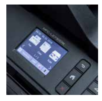
Colour touchscreen (MFC-L2730DW/ MFC-L2750DW)