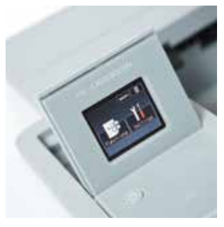
Easy to use 4.5cm colour touchscreen