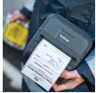
Ideal for printing on the move in harsh conditions