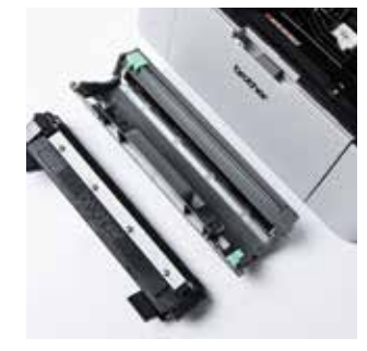
Separate toner and drum unit reduces running costs