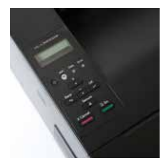
User-friendly buttons and display