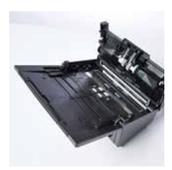
Advanced roller system reduces any paper flow issues