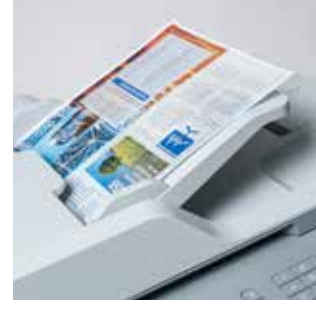
Fast, high quality colour prints every time