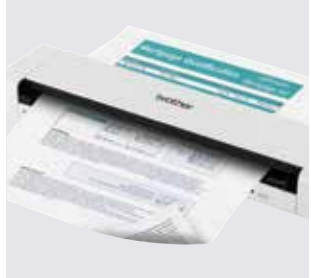
Portable scanning without PC connection*