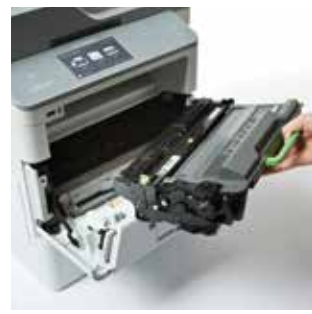
8,000 page high-yield in-box toner