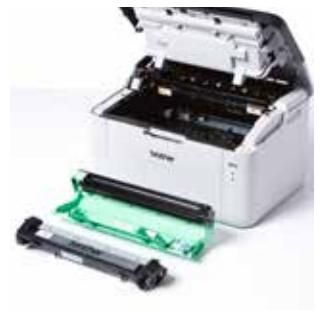
Separate toner and drum unit to reduce running costs