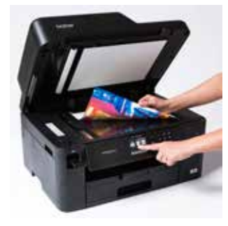
A4 scan and copy