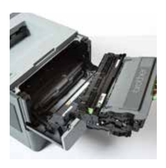
8,000 page high-yield in-box toner