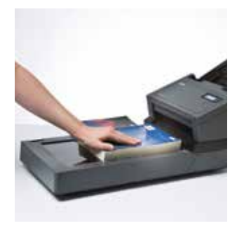
Perfect for occasionally scanning books*