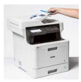
Ideal for producing high quality colour booklet prints