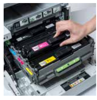
Separate toner cartridges, drum unit and belt unit reduces costs