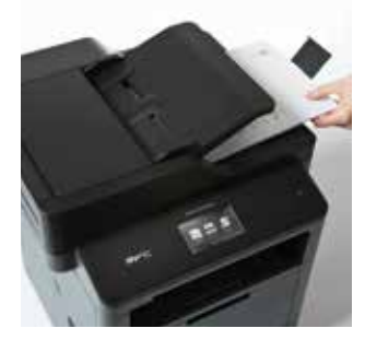
Print and scan direct from/ to USB