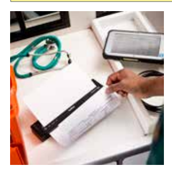
Compact design for any location