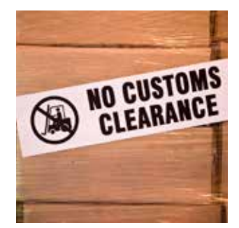
Ideal for labelling around the warehouse