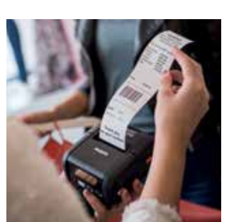
Ideal for printing receipts on the go