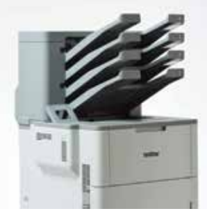
Customisable tray and mailbox options