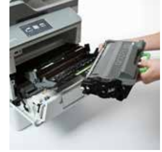
12,000 page super high-yield in-box toner