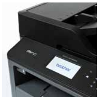
Large colour touchscreen display, up to 12.3cm