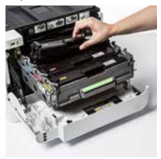
Separate toner cartridges, drum unit and belt unit reduces costs