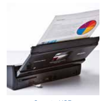
Scan to USB