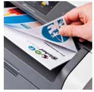
Automatic 2-sided print reduces paper consumption