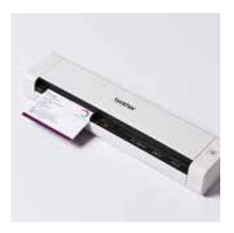
Perfect for scanning business cards straight to contact lists