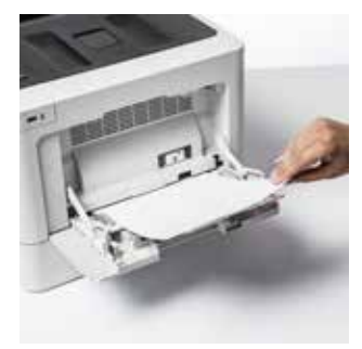
Front and rear bypass trays for various media sizes