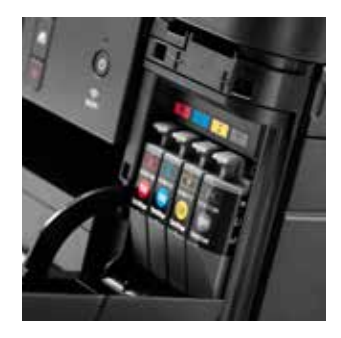
Convenient front-loading supplies