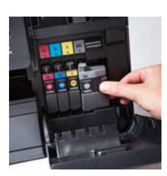
Convenient front loading supplies