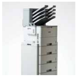
Customisable tray and mailbox options