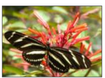
Ruby-throated Hummingbird and Zebra Longwing