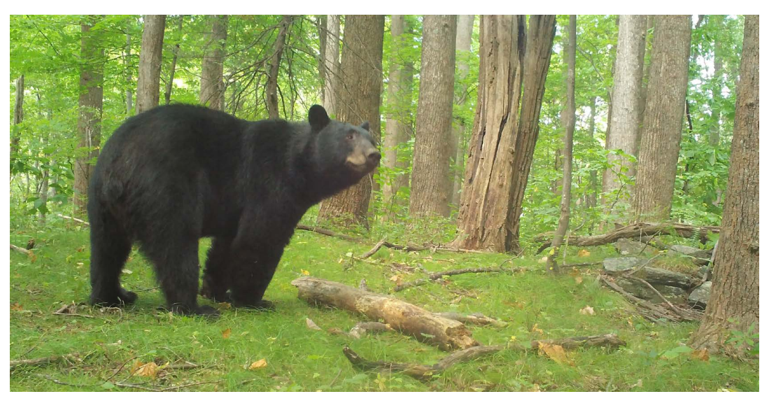
Black bear photographed by a Foundation-funded wildlife camera.