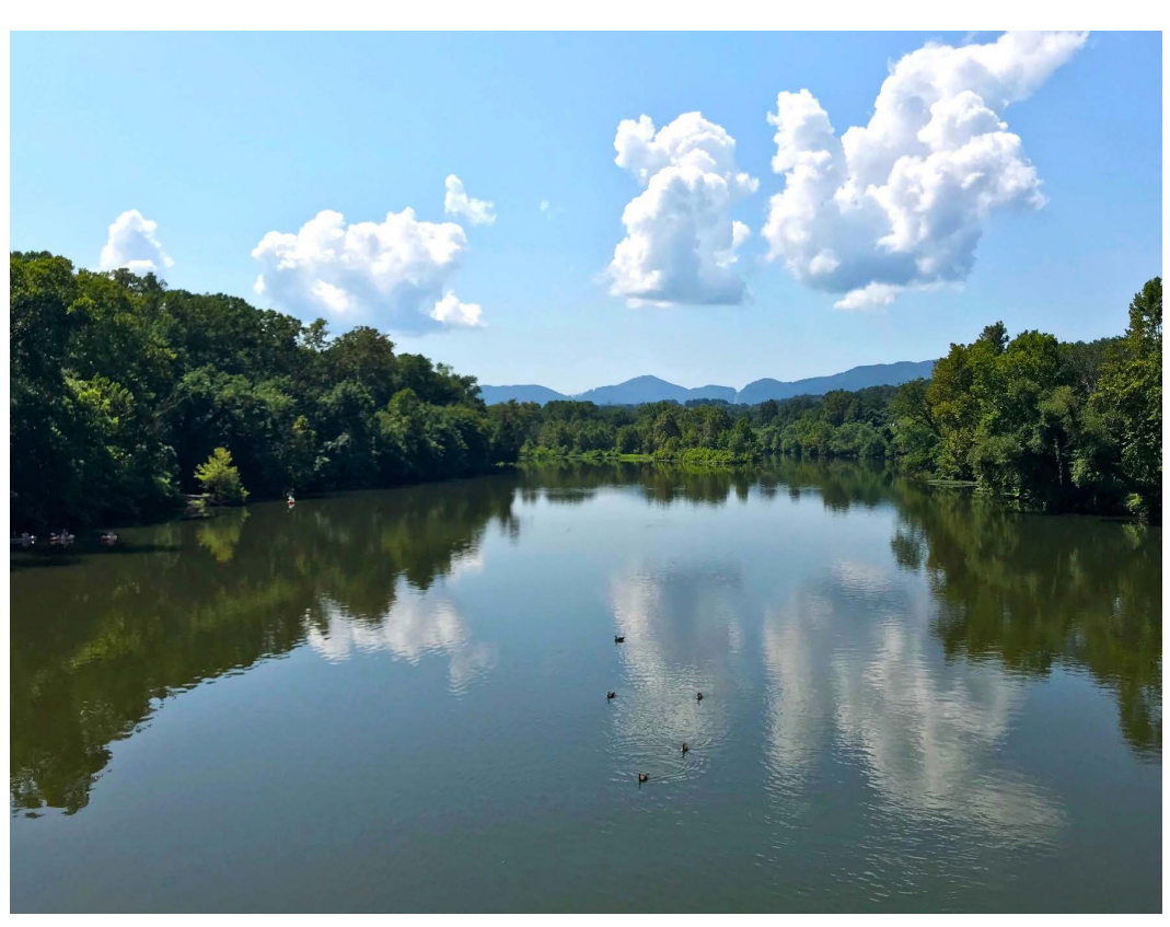
View of James River at milepost 64, the lowest elevation on the Parkway.