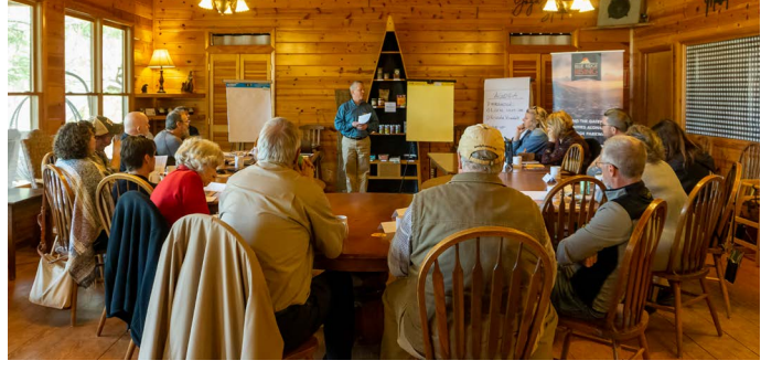
Meetings in Bedford County, Va., and Yancey County, N.C.