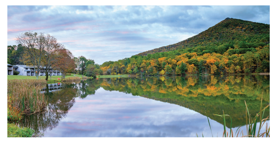
Sharp Top Mountain's changing leaves reflected in Abbott Lake at milepost 85.