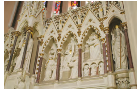
(fig. 165) ST MICHAEL'S CHURCH