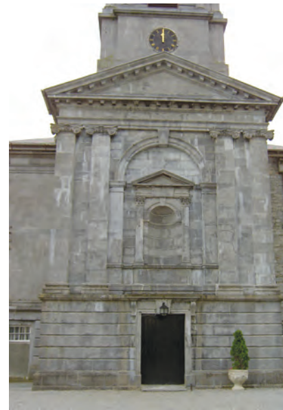
(fig. 47) CATHEDRAL OF SAINT JOHN THE BAPTIST AND ST PATRICK'S ROCK