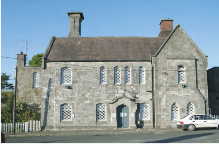
(fig. 70) CAHIR RAILWAY STATION Church Street, Cahir (1852)

W.G. Murray chose the Tudor Revival style for the station at Cahir, on the Waterford to Limerick line. The building has well-crafted limestone walls and details.