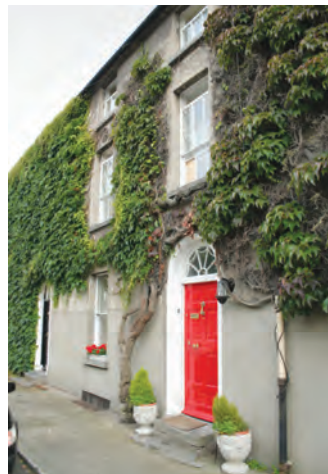
(fig. 117) 9 ANNE STREET