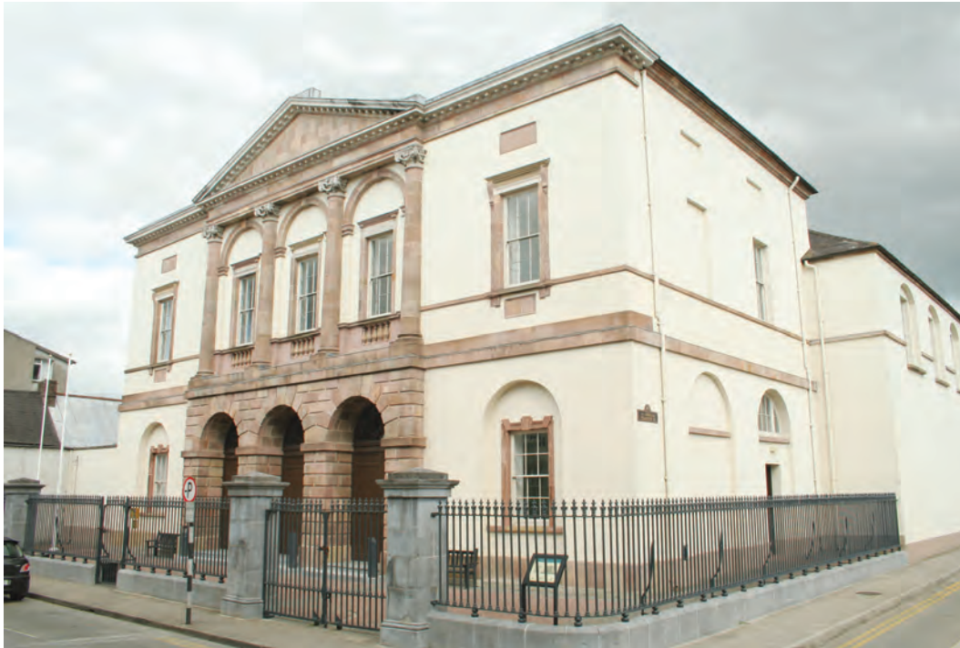
(fig. 134) CLONMEL COURTHOUSE Nelson Street, Clonmel (c. 1800)

Richard Morrison is credited with the courthouse in Clonmel, which has fine sandstone detailing to its principal elevation. The pedimented entrance arcade is a suitably monumental introduction to this judicial building. The six-bay rear elevation has a low-pitch pediment to the middle four bays, with wings at right angles to each side, and typically, round-headed windows to the first floor. The courthouse was the scene of the trial of William Smith O'Brien and his co-conspirators in the abortive rebellion of 1848.