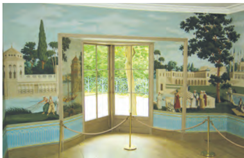
(fig. 78) THE SWISS COTTAGE

John Nash was the architect of the best surviving cottage orné in Ireland or Britain, built for the tenth Baron Caher (later the first Earl of Glengall) and his wife. It stands on a bluff overlooking the River Suir at the south end of the parkland behind their main dwelling, Cahir House. This view, from the south-west, highlights the use of tree trunks and vegetation to create the sense of the house growing out of nature. The deliberate irregularity of detailing, especially in the treatment of window heads, is a feature of the house.