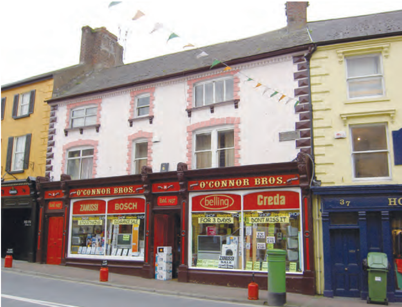
(fig. 102) O'CONNOR BROS 35-36 Main Street, Tipperary (c. 1800)

This street, leading up to the Church of Ireland cathedral, is lined with fine two and three-storey town houses, some incorporating carriage entrances. A large petal fanlight dominates the wide entrance doorway of this example. The fenestration pattern is carried through to the neighbouring house and the steps, protruding into the footpath, help to emphasise the position of the entrance at the centre of the façade.