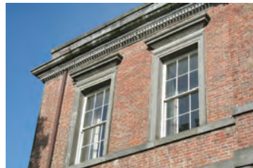
CASHEL PALACE HOTEL

The staircase newels are fluted Corinthian columns.