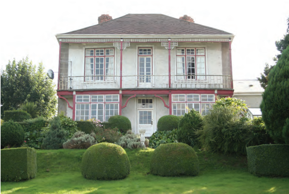
(fig. 175) WATERFORD ROAD Carrick-on-Suir (c. 1890)

This unusual colonial-style house is highly visible at the south end of Dillon Bridge. Its veranda, small-paned timber casement windows and the delicate valences to its eaves also give the building something of an Arts and Crafts appearance. The builder was reputedly a former sea captain on the China routes.