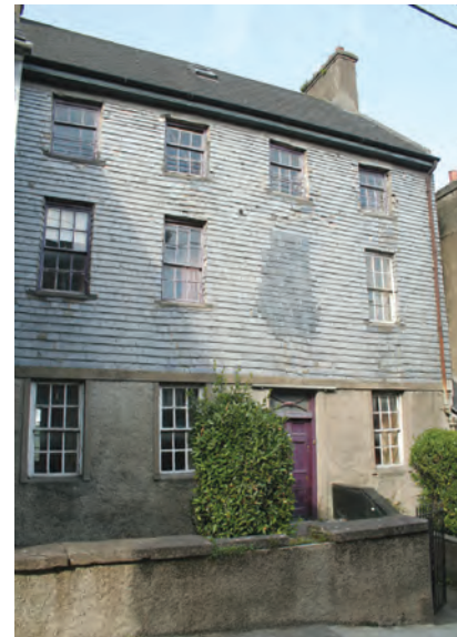
(fig. 32) FRIAR STREET Carrick-on-Suir (c. 1760)