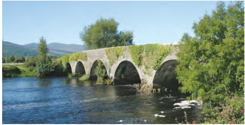
( fig. 41 ) NEWCASTLE BRIDGE Moloughnewtown/ Clashganny West (c. 1770)

The impetus for improvement also had a profound influence on urban life. The network of roads, the construction of bridges and the improvement of waterways meant that the produce of the rich farmlands could be freely traded ( fig. 41 ). These benefits fell unevenly on the towns of South Tipperary. Fethard, an important walled settlement in medieval times, accommodated Cromwell in his campaigns in the county, and later quartered Williamite troops, but by the eighteenth century had become a relative backwater, probably due to the growing prominence of Clonmel. Nonetheless, it retains interesting buildings of the period, such as Fethard Rectory, just north