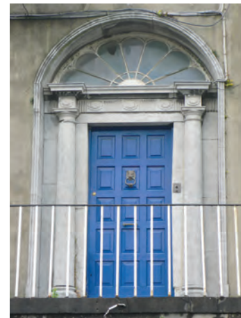
4 NEW QUAY Clonmel (c. 1805)

The quayside at Clonmel is notable for its merchants' houses whose main floors are raised above understoreys to protect against flooding and are similar to houses on South Mall, Cork. This house is one of a mirror-image pair, with elegant Doric doorcases.