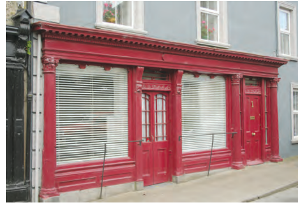
(fig. 44) BURKE STREET Fethard (c. 1790)

Superb engaged Corinthian columns are the main glory of this shopfront, which has been described as one of the best classical shopfronts in Ireland.