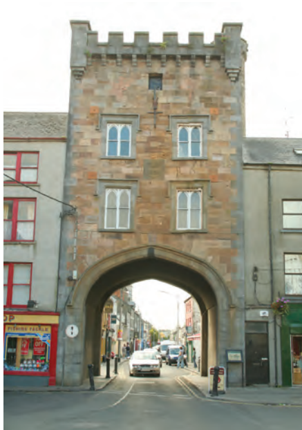
(fig. 99) WEST GATE O'Connell Street/ Irishtown, Clonmel (1831)

A cast-iron plaque marking the boundary of the borough of Clonmel.