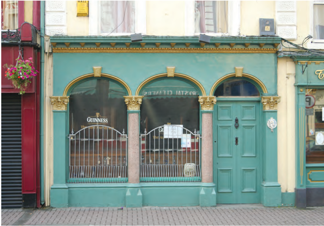
(fig. 109) THE AULD MURRAY Main Street, Tipperary Town (c. 1870)

One of the most characteristic features of the remarkably unified street architecture of Tipperary Town is the use of arcaded ground floors. In this instance, Corinthian polished granite colonettes separate the windows and the cornice has courses of modillions, and egg-and-dart and leaf motifs.