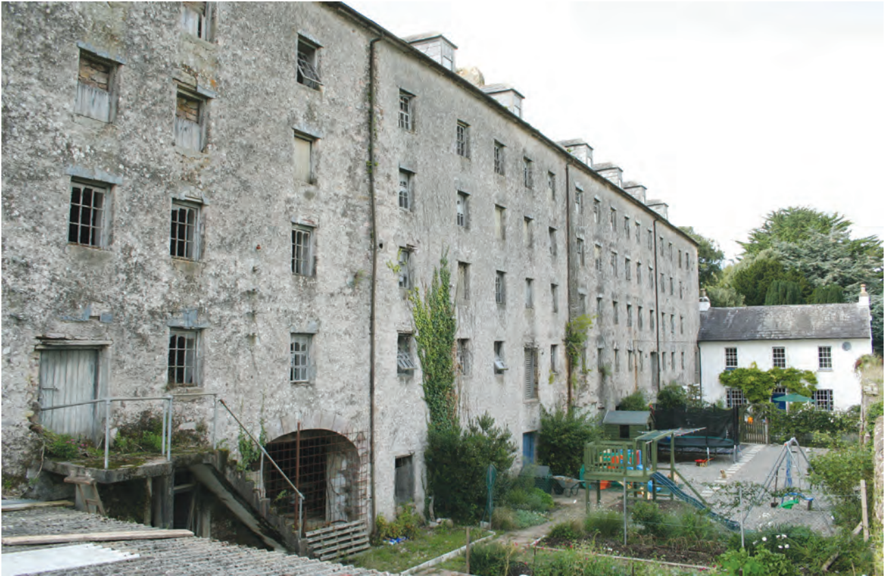
(fig. 48) CASTLEGRACE MILL Castlegrace (c. 1790)

The enormous mill building at Castlegrace has five storeys and twenty-five bays. It is part of a complex that includes a nineteenth-century country house and smaller millers' houses.