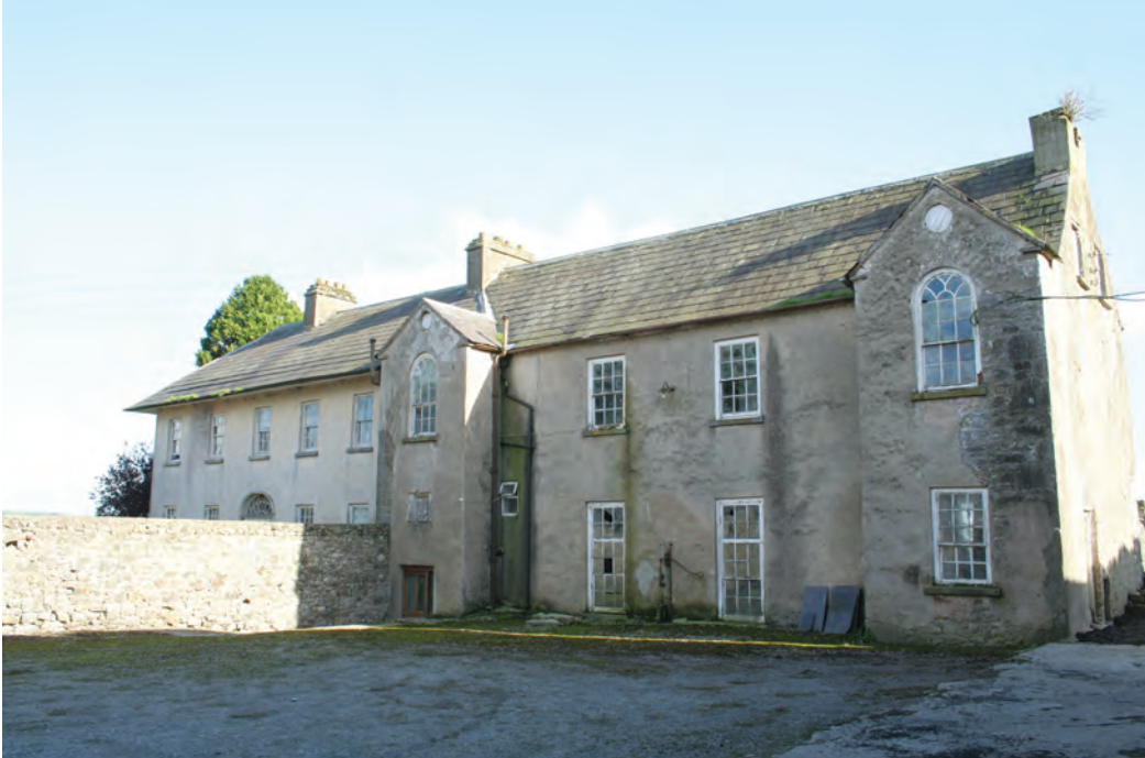
(fig. 11) MELDRUM HOUSE Meldrum (1622, extended c. 1730)

Meldrum House is a good example of a multi-period country house. The early seventeenth-century right-hand block has a dated coat of arms over its doorway, while the later block has the typical features of an eighteenth-century house.