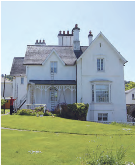
ASHBOURNE Coleville Road, Clonmel (c. 1840)