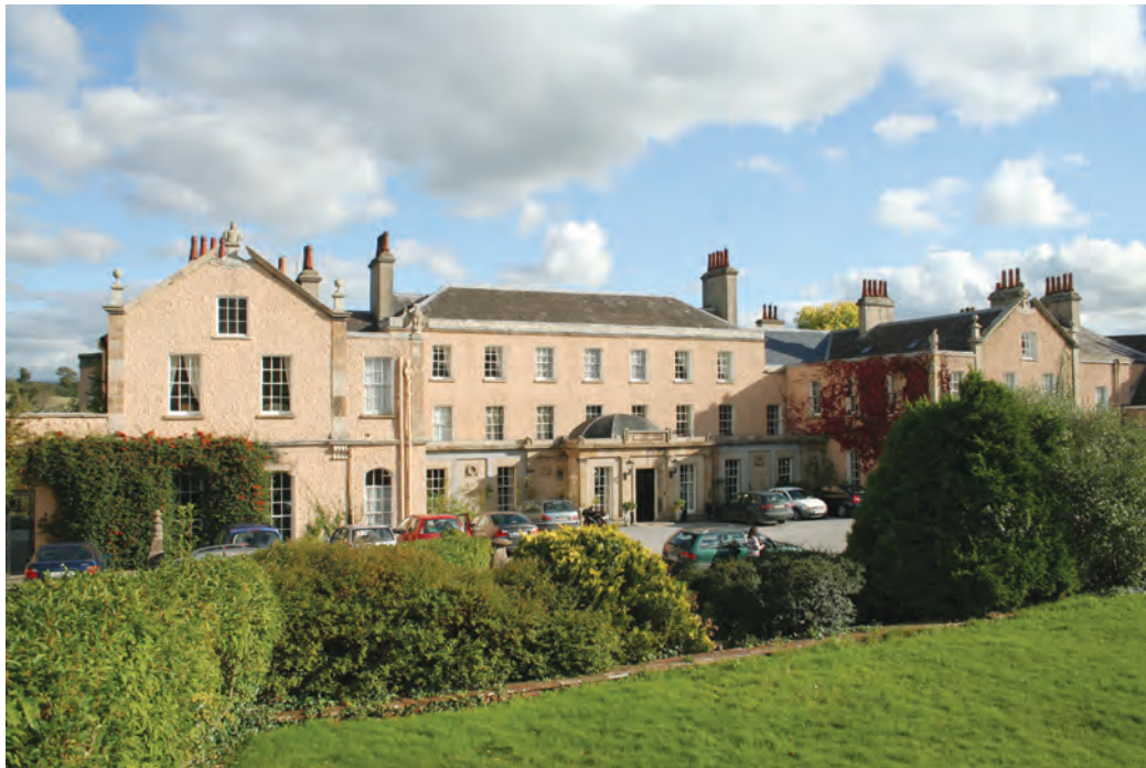
(fig. 17) KNOCKLOFTY HOUSE Knocklofty Demesne (c. 1790, with mainly 19th century additions)

This rambling U-plan country house appears to have a seventeenth-century core, although the main block has features of c. 1790, the wings being slightly later and the single-storey gallery added to the inner side of the forecourt early in the nineteenth century. Curving bays were added to the garden elevation c. 1910. The main entrance is set within an elaborate porch. It was the home of the Hely-Hutchinsons, Earls of Donoughmore, one of whom ran for Parliament in the nineteenth century on a Catholic Emancipation ticket.