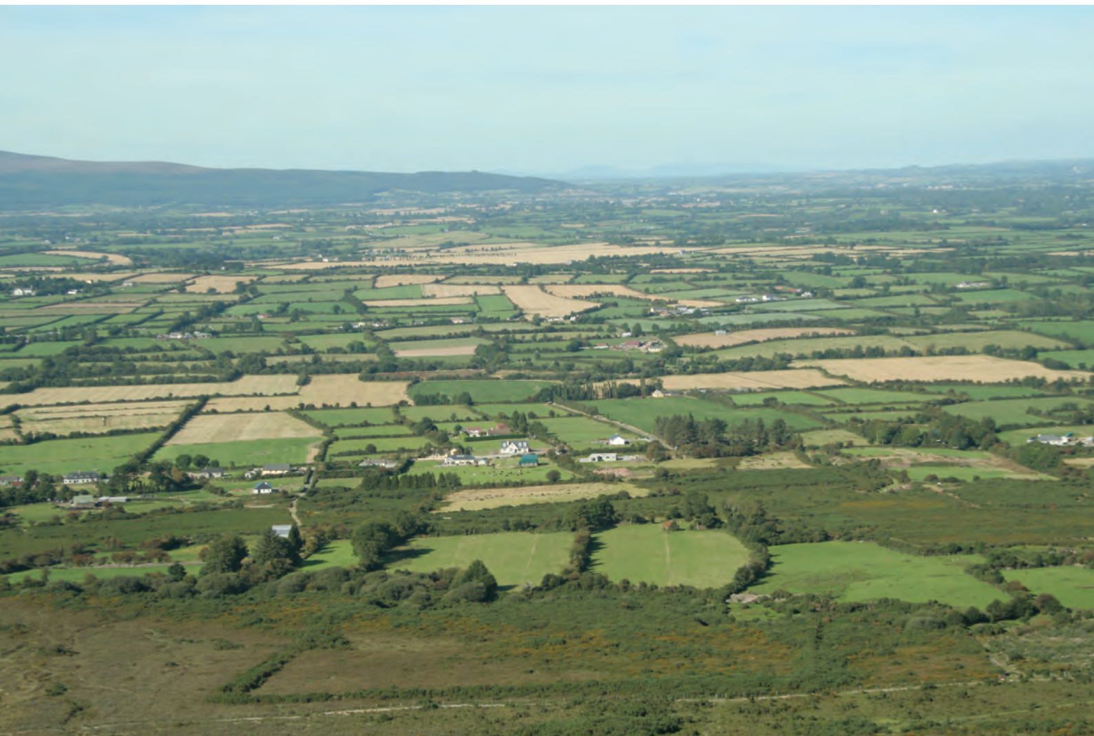
PLAIN OF CASHEL Looking from The Vee. The Galtee Mountains are on the left.