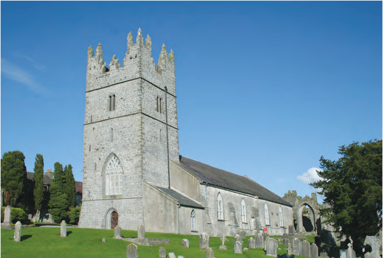
(fig. 55) HOLY TRINITY CHURCH OF IRELAND Main Street, Fethard (13th century, altered 1785 and 1815)

The immense tower of the medieval parish church of Fethard is the town's dominant landmark. The present church occupies the nave of the original, the chancel and Lady Chapel being ruined and roofless.