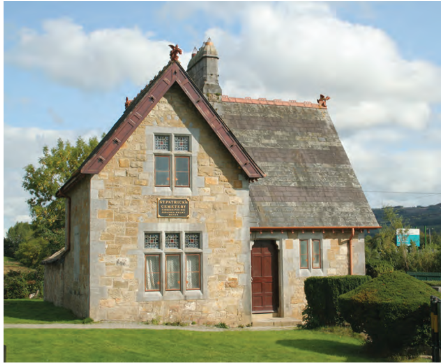
(fig. 170) ST PATRICK'S CEMETERY