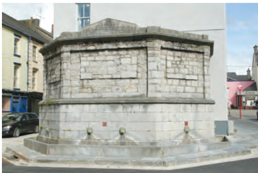
(fig. 127) BUTLER CHARTERIS FOUNTAIN The Square, Cahir (1876)

The Town Commissioners erected this limestone reservoir in 1842 to provide a water supply for the townspeople. The spouts have decorative lions' heads.