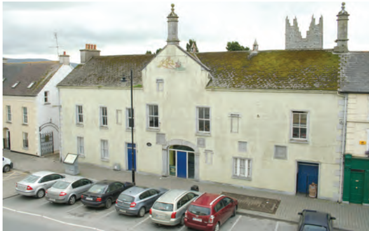
(fig. 9) FETHARD TOWN HALL Main Street, Fethard (c. 1600)