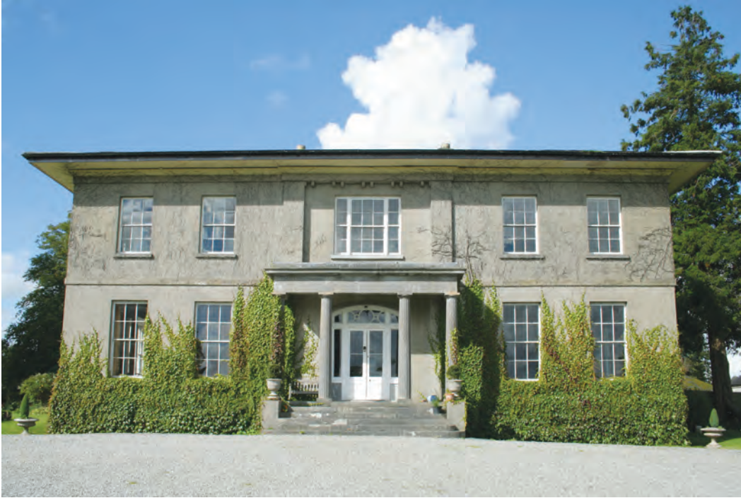
(fig. 88) LAKEFIELD Ballygambon (1831)