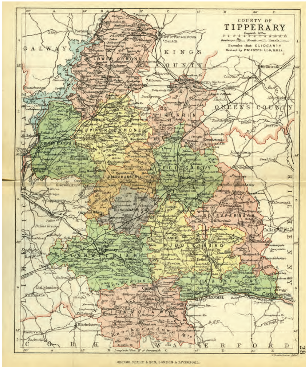
COUNTY OF TIPPERARY George Philip and Son, London and Liverpool (c. 1885)

This map highlights the various baronies in the historic county of Tipperary. Slieveardagh, Middlethrid, Clanwilliam, Iffa and Offa East, Iffa and Offa West, and the parishes of Doon and Toem in Kilmanagh Upper, all comprise the administrative county of South Tipperary.