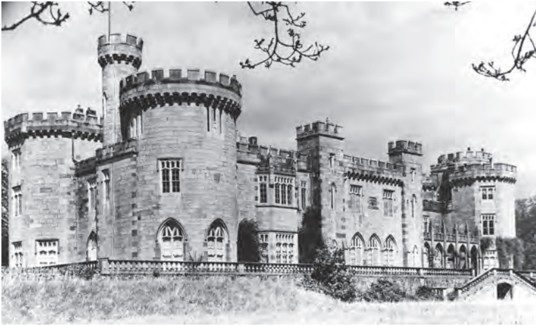
(fig. 79) SHANBALLY CASTLE Shanbally Demesne (c. 1812)

This, the largest of John Nash's castellated houses, was built for Cornelius O'Callaghan, first Viscount Lismore. It was demolished in 1957 and the ruin dynamited. A gate lodge of 1914 and some outbuildings are all that remain.