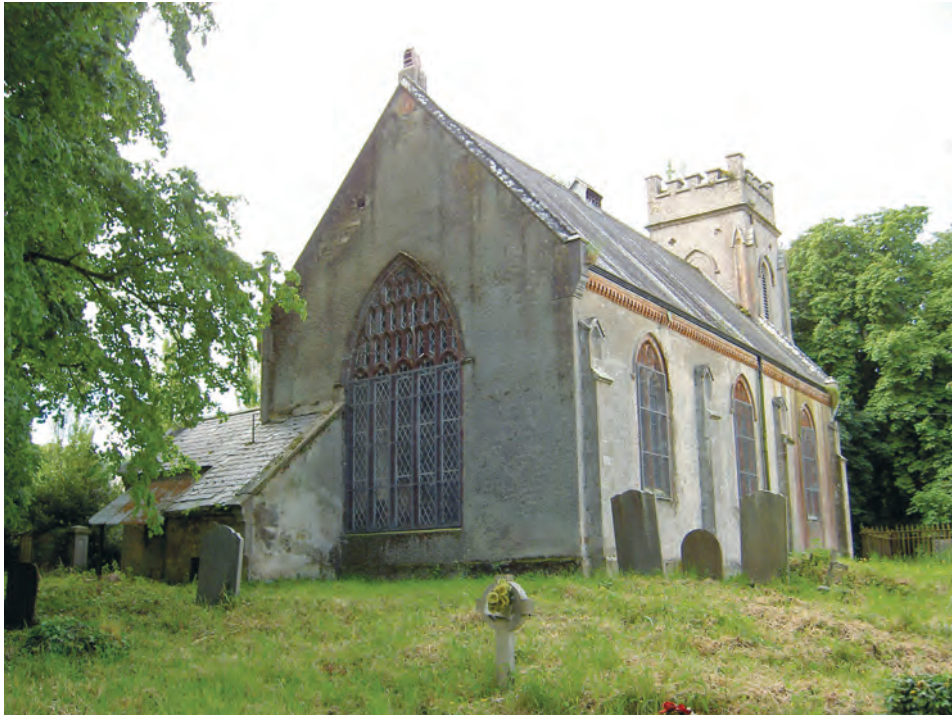
( fig. 149 ) ST PATRICK'S CHURCH OF IRELAND CHURCH Marfield (1818)

porates the tower of a medieval church ( fig. 150 ). Kilcooly has a large First Fruits church built of limestone, with a large west tower ( fig. 151 ). The churches at Killaloe, near Clonmel, and Magorban, near Cashel are examples of smaller undertakings ( fig. 152 ). Several fine Protestant churches of this period were built, the most notable being St Paul's, Cahir (1816-18), the only Irish church designed by