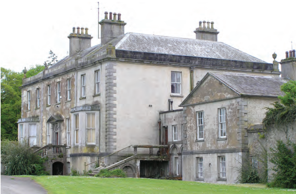
(fig. 87) KILCOOLY ABBEY Kilcoolyabbey (1764, rebuilt 1842)

The south block of Lismacue, at Bansha, dates to c. 1760, the building being extended in 1816 and the ornate Gothic façades applied. The entrance bay is framed in cut limestone and sandstone with decorative shield devices to the parapet. The use of blind window openings is curious and the stonework of the lower service block to the north, although sharing many of the details of the main house, is left unrendered.