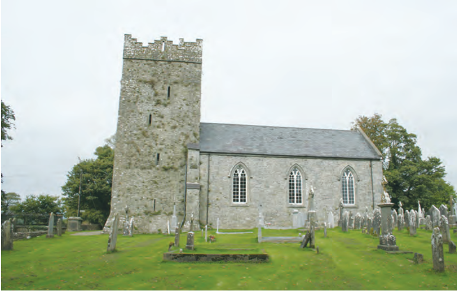
(fig. 150) ST JOHN'S CHURCH OF IRELAND CHURCH Ardmayle (1814-15)

Ardmayle Church of Ireland is a classic example of a nineteenth-century edifice utilising a pre-existing religious site. The fifteenth-century tower of the medieval church has been incorporated into the later building, whose delicately carved timber windows have trefoil-headed lights.