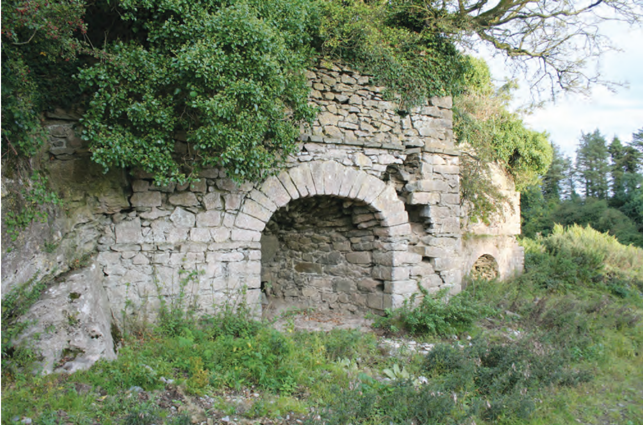
(fig. 76) BALLYLUSKY (Magowry par.) (c. 1820)

This is a rare example of a double limekiln, standing near Drangan. Crushed lime was burned into powder in these structures and used as fertiliser for the land or as mortar for building work.