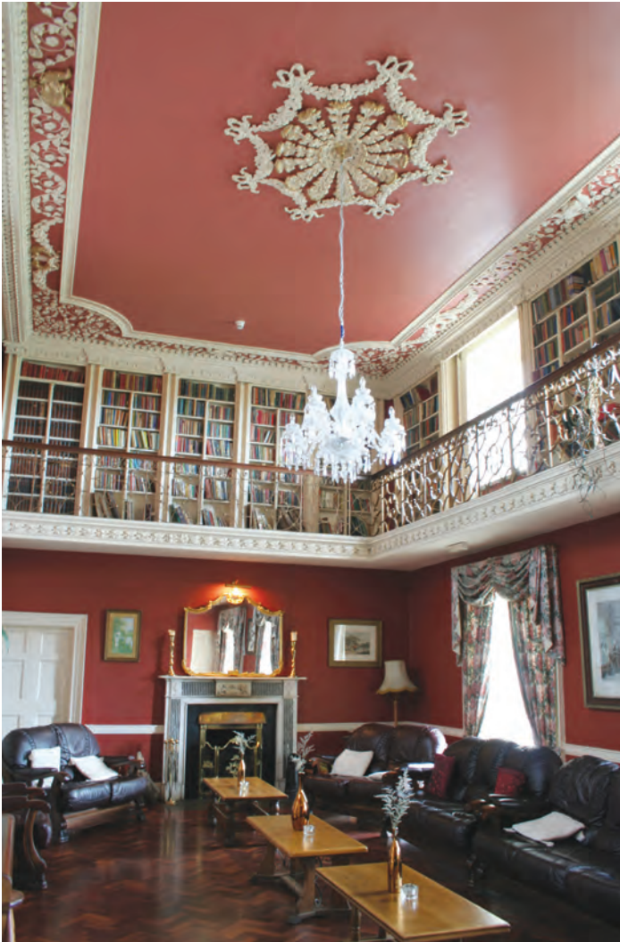
(fig. 18) KNOCKLOFTY HOUSE

The library displays some fine plasterwork detailing. The gallery is similar to that in Kilcooly Abbey.