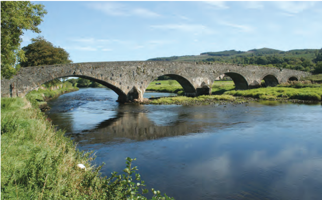
(fig. 13) SIR THOMAS'S BRIDGE Ferryhouse/ Twomilebridge (1690)

One of Ireland's most intact medieval structures, Old Bridge was built in the mid-fifteenth century, connecting the medieval walled town with its suburb, Carrickbeg, across the River Suir. The piers have pedestrian refuges.