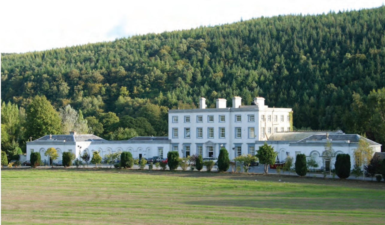
(fig. 14) MARLFIELD HOUSE Marlfield (c.1790)