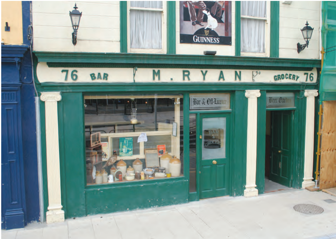
(fig. 104) M. RYAN 76 Main Street, Cashel (c. 1870)

Shallow Ionic-style pilasters adorn the rendered frontage of this public house.