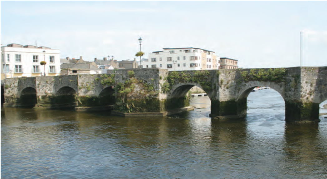
(fig. 12) OLD BRIDGE Carrick-on-Suir (c. 1450)

One of Ireland's most intact medieval structures, Old Bridge was built in the mid-fifteenth century, connecting the medieval walled town with its suburb, Carrickbeg, across the River Suir. The piers have pedestrian refuges.