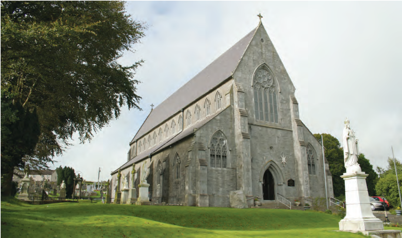
(fig. 166) ST MARY'S CHURCH Bailey Street, Killenaule (1859-65)

St Mary's was designed by the great church architect, J.J. McCarthy. It is sited in a commanding position in the town of Killenaule.