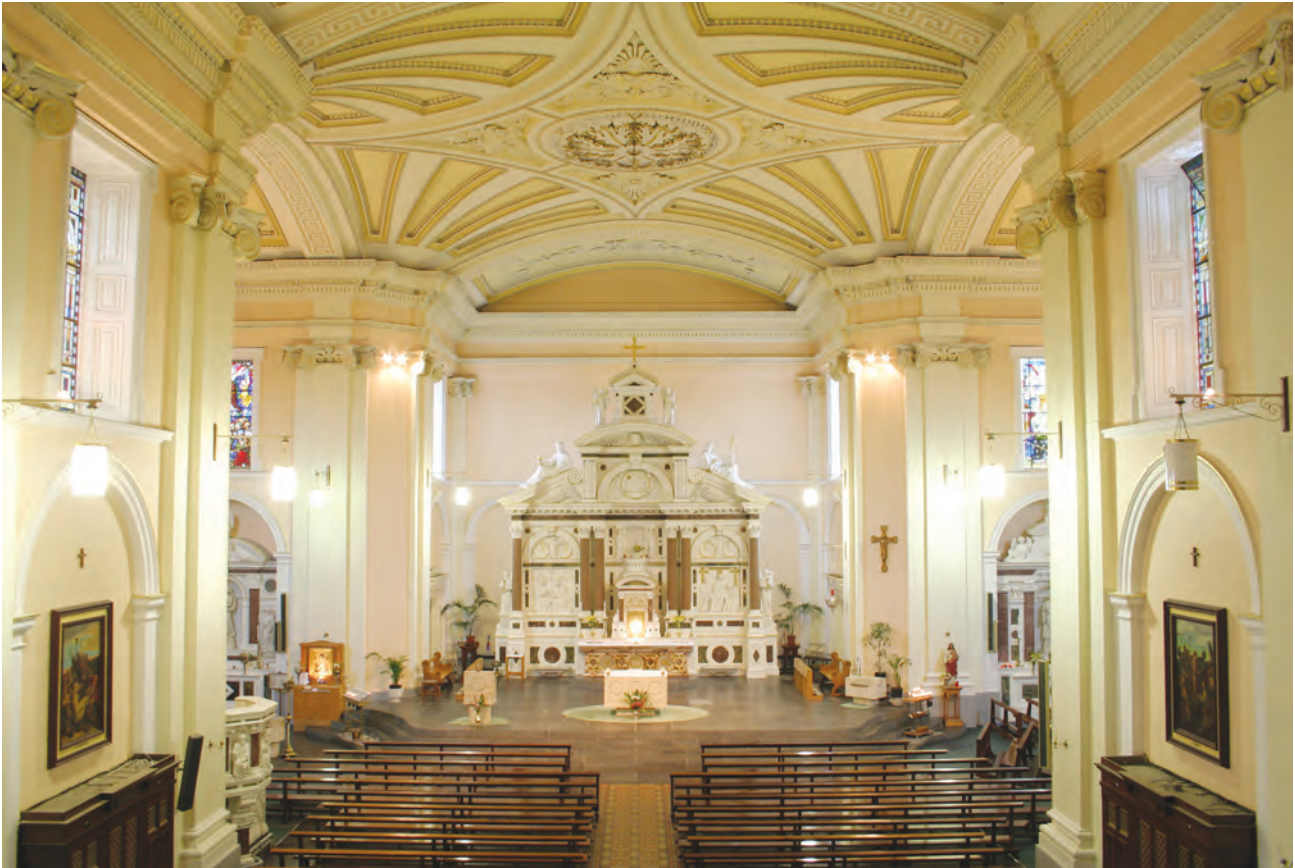
(fig. 159) ST MARY'S CHURCH