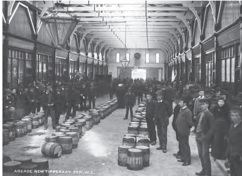
( fig. 90 ) O'BRIEN ARCADE Tipperary (1890)

It has been noted that the design of estate landscapes in the nineteenth century owed much to the idealisation of rustic life, in which the realities of living on the land and of agricultural production were concealed from polite view. In the context of South Tipperary, the disparity between the conditions affecting the small landowner and tenant farmer and those of the landowners, some of who commissioned these expensive demesne landscapes, provided the driving force behind the continuing unrest in South Tipperary throughout the century. The struggle for land reform had ethnic and religious underpinnings, despite the prominence of Protestant leaders, such as Isaac Butt and Charles Stewart Parnell in the Home Rule party and in the Land League. The Land Act of 1881, which provided fixity of tenure, fair rent and free sale of land, central issues in the land agitation, proved to be just a staging-post. In the Plan of Campaign, begun in 1886 to agitate for the lowering of rents, one of the principal targets was the Smith-Barry estate at Tipperary. The scale of resistance associated with the Plan of Campaign is visible in the construction of the suburb of New Tipperary in 1890, sponsored by the Tenants Defence Association ( fig. 90 ). The houses were occupied by tenants who had been evicted as a result of the agitation, or who