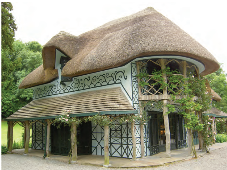
(fig. 77) THE SWISS COTTAGE Kilcommon More (North) (1810-14)

Towards the end of the eighteenth century, William Barker of Kilcooly created a new lake, excavating several acres of good agricultural land adjacent to his Palladian house. Perhaps the most ambitious example of estate development is that of the Glengall Butlers at Cahir. The second Earl landscaped and planted a two-mile stretch on both banks of the Suir, to create a romantic 'natural' landscape in accordance with the approach of Humphrey Repton, then in vogue. The effect was enhanced by the addition in 1820 of a particularly notable thatched cottage orné, designed by John Nash and called the Swiss Cottage ( figs. 77-8 ). Nash was also engaged in the design of Shanbally Castle, near Ballyporeen, for Cornelius O'Callaghan, M.P. The largest of Nash's country houses in Ireland, it sat in a landscaped demesne with views of the Galtee and Knockmealdown mountains to the north and south. The house had an unusual design, with a linear sequence of spaces