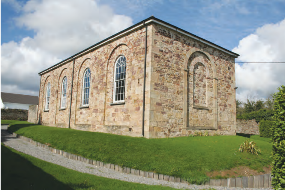
(fig. 156) CAHIR PRESBYTERIAN CHURCH Abbey Street, Cahir (1833)

Built in 1833 and used until 1881 as a Quaker meeting house, the simplicity of this neo-Classical building is elevated by the arched recesses with their fine small-pane timber sliding sash windows. The blind window to the gable is the first view of the building from the street, emphasising the relative modesty of Quaker religious buildings.