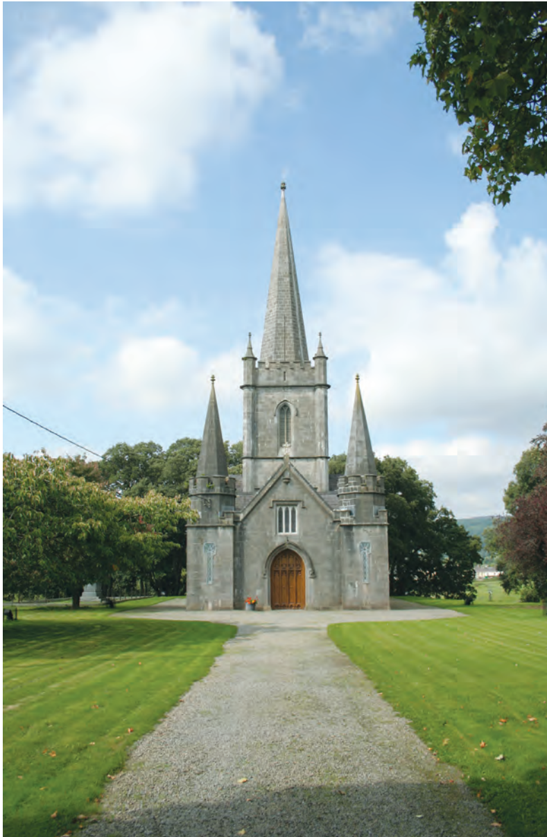
(fig. 153) ST PAUL'S CHURCH Church Street, Cahir (1816-18)

Nash's church at Cahir is one of only two designed by him, the other being All Souls' at Langham Place, London. The front of the Cahir church is unusual, with its entrances flanked by thin spirelets. Gothic detailing is everywhere evident in the building, in the form of turrets, pinnacles, hood-mouldings and tracery windows.