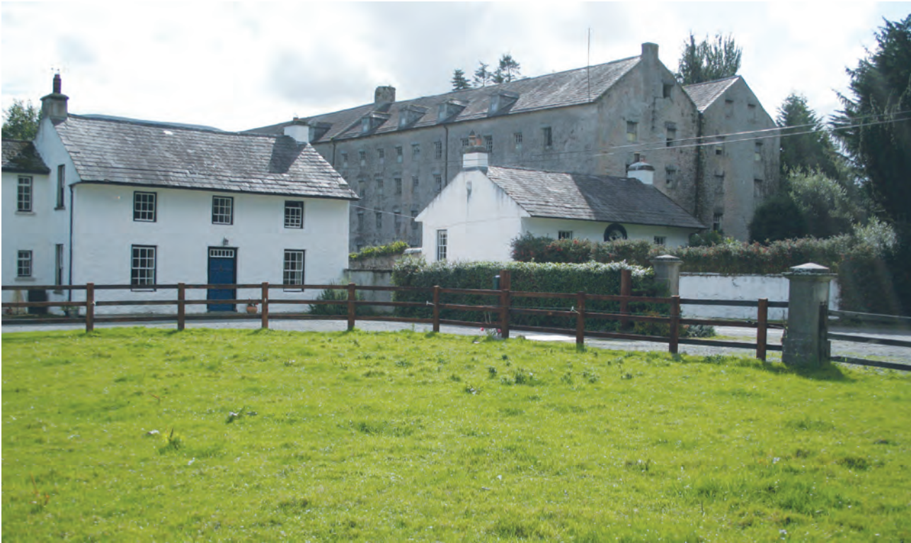
(fig. 112) CASTLEGRACE (c. 1800)

Symmetrically placed millers' houses flank the approach to the mills at Castlegrace. The house to the right has a single-storey front and a two-storey rear elevation and was the bank for the enterprise.