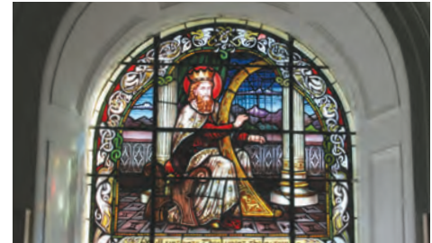
(fig. 161) HOLY TRINITY CHURCH

Described as a 'full-blooded classical barn-church', the Catholic parish church at Fethard has an unusual, fanciful top to its pedimented gable-front.