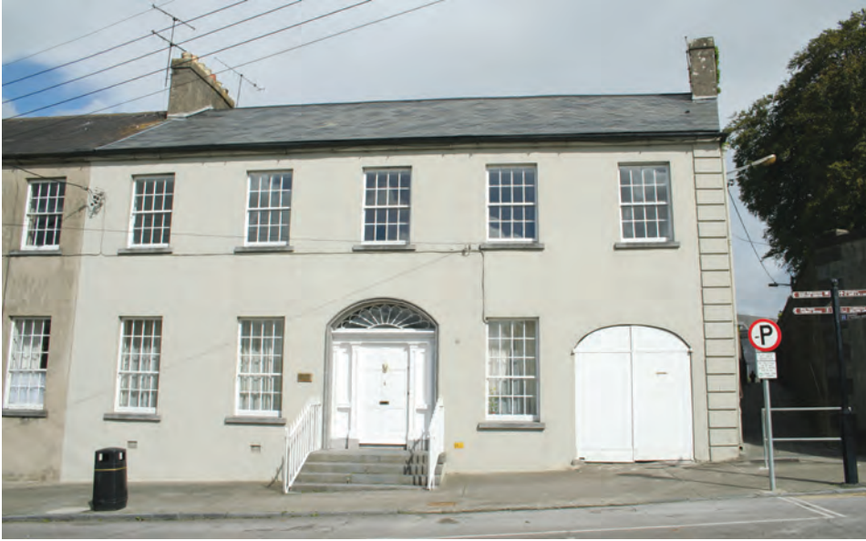
(fig. 101) JOHN STREET Cashel (c. 1830)

This street, leading up to the Church of Ireland cathedral, is lined with fine two and three-storey town houses, some incorporating carriage entrances. A large petal fanlight dominates the wide entrance doorway of this example. The fenestration pattern is carried through to the neighbouring house and the steps, protruding into the footpath, help to emphasise the position of the entrance at the centre of the façade.