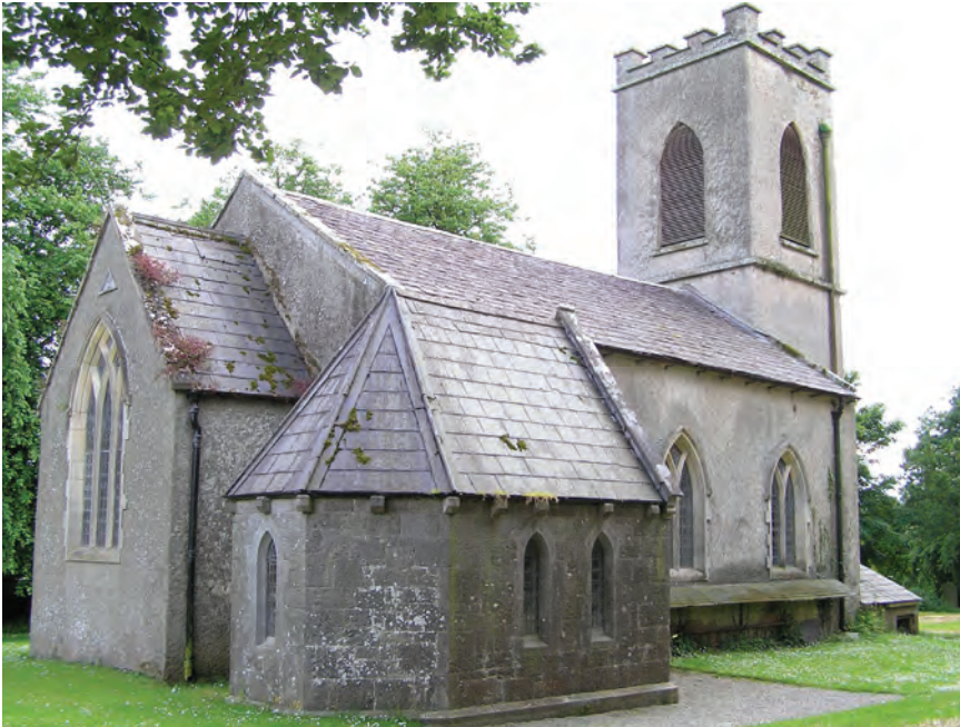
(fig. 58) TULLAGHMELAN CHURCH OF IRELAND Ballybeg (Tullaghmelan) (c. 1780)

This average-size rural church, near Ardfinnan, has features typical of such Board of First Fruits churches. The simple rectangular nave, small chancel and west tower were supplemented in the 1860s by the addition of the dressed limestone vestry. The Massey family paid for the interior, executed c. 1870, which is based on Salisbury Cathedral.