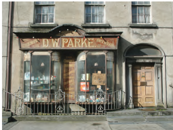
(fig. 190) D.W. PARKE 23 Gladstone Street, Clonmel (c. 1910)

Originally a plain building, this public house in the village of Cullen has been rendered with a host of ornate details and fine raised lettering.