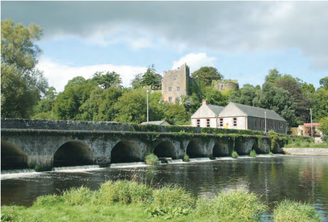
(fig. 63) ARDFINNAN BRIDGE Ardfinnan (c. 1800)

The river scene at Ardfinnan is dominated by the multi-period castle begun in the reign of King John and guarding the crossing of the Suir, a place which has had a bridge since before 1311. The long thirteen-arch bridge shows evidence of widening to its east side and may incorporate medieval and/or seveneenth-century fabric. The double-pile building at the end of the bridge was formerly part of a large wool factory established in 1869 and operated by Mulcahy, Redmond and Co.