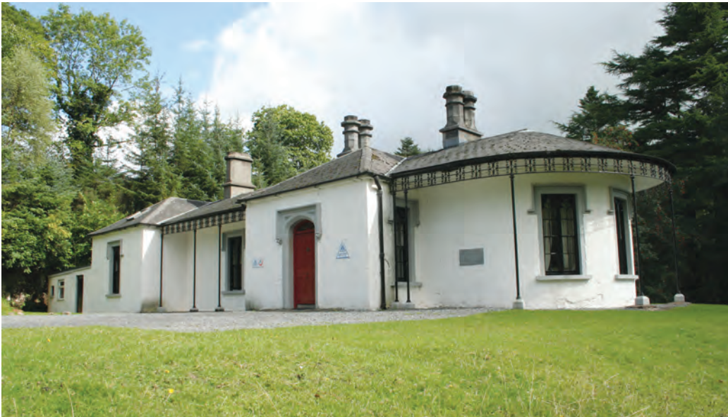
(fig. 92) MOUNTAIN LODGE Cullenagh (Shanrahan par.) (c. 1830)

This is a rare example in South Tipperary of a villa-type house. It is enhanced by the elegant steps to the projecting entrance bay and the string course between the piano nobile and the basement. It is located near Ballyneill.