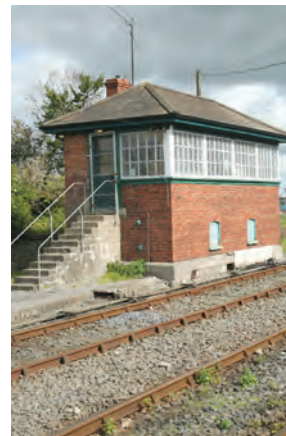
CLONMEL RAILWAY STATION