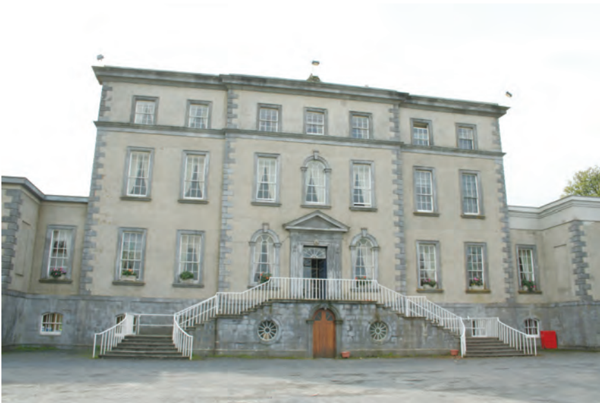
(fig. 28) DUNDRUM HOUSE Dundrum (c. 1730, altered c. 1890)

An elegant perron staircase gives access to the piano nobile of this Palladian house, perhaps designed by Sir Edward Lovett Pearce for the Maude family. The top floor was added c. 1890, changing its proportions, particularly in relation to the wings. The building was built in red brick and rendered in the early twentieth century.