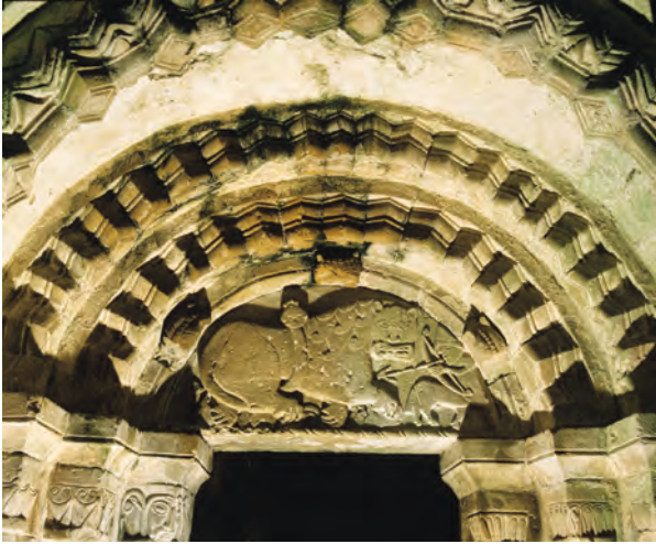
(fig. 2) CORMAC'S CHAPEL St Patrick's Rock, Cashel (1127-34)

Cormac's Chapel, on the world-famous Rock of Cashel, is undoubtedly Ireland's finest Romanesque building. The north doorway of the chapel displays classic Romanesque lozenge and chevron details. The capitals are, characteristically, all carved differently. The tympanum depicts a scene with a large lion being hunted by a centaur (half-man, half-horse).