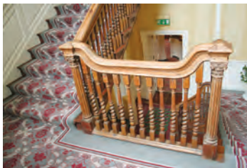
CASHEL PALACE HOTEL

The former palace of the Church of Ireland archbishops of Cashel is one of the key works of Sir Edward Lovett Pearce. It has two elegant façades with high quality details, brick to the street and limestone to the garden. The interior has an elegant carved timber staircase. Shouldered door surrounds and panelled wainscoting are also a feature in this house.