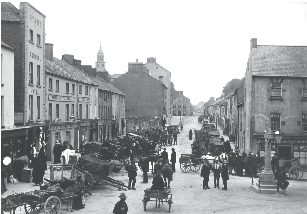
FRIAR STREET, Cashel c. 1880