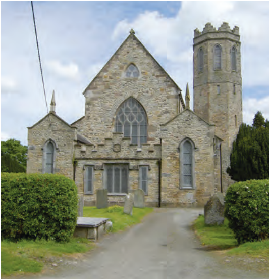
(fig. 53) ST MARY'S CHURCH OF IRELAND

It is an early thirteenth-century foundation. The upper part of the tower dates to c. 1805 and other works include Joseph Welland's rebuilding of the nave in 1857 and his son's addition of a transept in 1864. Clonmel's medieval town wall forms the north and west boundaries of the surrounding graveyard.