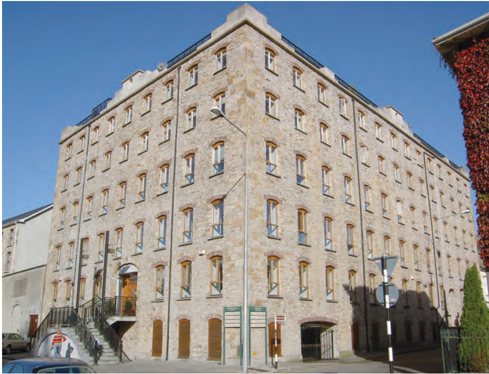
(fig. 111) GOVERNMENT OFFICES New Quay/ Nelson Street, Clonmel (c. 1830)

Castellated parapets adorn the roofline of this large former brewery building on the quayside in Clonmel. It was the premises of Thomas Murphy & Co. and the complex covered an area of about two acres. Its original main building was constructed in 1798, but was rebuilt after a fire in 1829. It later served as a shoe and boot factory.