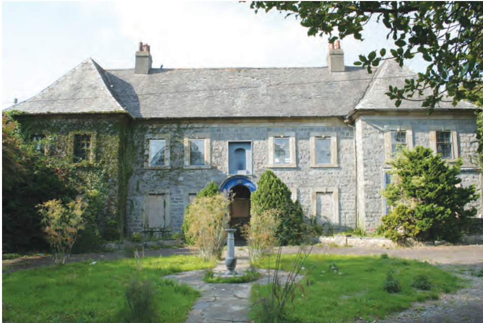
( fig. 49 ) SILVERSPRING HOUSE St Patrick's Road, Clonmel (1747-8)

church tithes had been assigned to laymen), purchase glebes (land set aside for the maintenance of the clergy) and glebe houses, and to build and repair parish churches. During the 1777-8 session of the Irish parliament, a system of annual grants to the Board of First Fruits was instigated to encourage the construction of churches and glebe-houses. By 1780, the Board had purchased glebes for sixteen benefices, assisted the building of forty-five glebe-houses, and bought inappropriate tithes for fourteen incumbents ( fig. 51 ). Nationally, by 1829, almost 700 churches were built, rebuilt or enlarged by the Board. South Tipperary featured in these developments. The large churches at Clonmel and Fethard are medieval buildings of