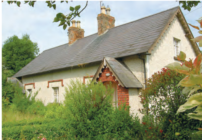
(fig. 124) MONKSLAND (c. 1880)

These small semi-detached houses have all the decorative details associated with estate workers' houses. They were built on the estate of the nearby Knocklofty House.