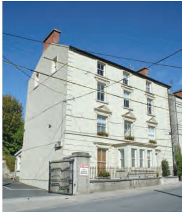
(fig. 45) ABYMILL THEATRE Abbeyville, Fethard (1791)

One of the finest town-houses in South Tipperary, this former presbytery displays fine render detailing, especially in the pediments and cornices to its windows and porch.