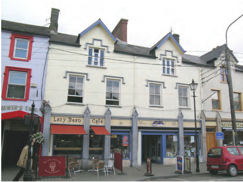
(fig. 106) THE SQUARE Cahir (c. 1840)

William Tinsley was engaged by the Earl of Glengall to remodel much of the town of Cahir. This resulted in the consistent treatment of façades, especially on the north side of Castle Street and the west side of The Square. His hallmark is the distinctive use of gabled, panelled pilasters in ashlar sandstone. The leftmost pilasters are replacements for three lost by the late nineteenth century.