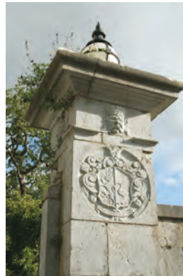
(fig. 19) KNOCKLOFTY HOUSE Knocklofty Demesne (c. 1780)

The west gate at Knocklofty has high quality stone details evident in the crowned lions' heads to the frieze of the piers.