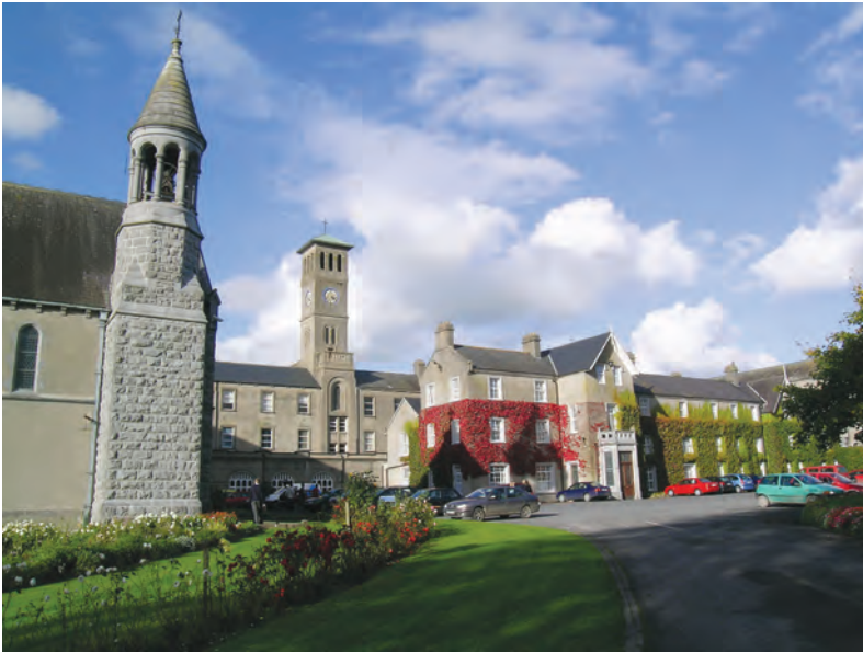
(fig. 173) ROCKWELL COLLEGE Rockwell (c. 1830-c. 1940)

Given the variations in economic circumstances, social and civic developments, the advent of improved communications and the defeat of landlordism, it is notable that the county's economy remained strongly agricultural and that, despite the impact of the Great Famine and the agrarian unrest, agricultural production increased rather than declined. The Land Acts had an impact on the size of smallholdings, but the strong farmer continued to be the backbone of the farming structure in South Tipperary. The pattern emerged of the family farm based on mixed tillage and livestock. However, the political landscape had been transformed, and the transition to the twentieth century was to see further bitter struggles before a new stability could be established (fig. 174) .