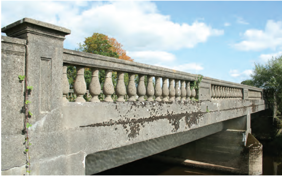
(fig. 196) CAPPA NEW BRIDGE Tankerstown/ Cappauniac (Clonbullogue par.) (1934)

Good use of concrete is evident in this bridge across the Aherlow River, near Cahir. Arched pedestrian ways at each of the four corners give access to the river bank.