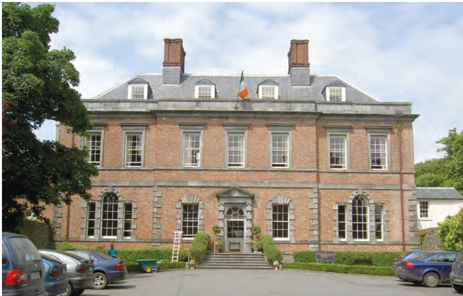
( fig. 26 ) CASHEL PALACE HOTEL Main Street, Cashel (1732)

early part of the century ( fig. 28 ). It was originally a storey lower, the top floor being a well-executed addition. The principal façade, with high quality stonework, is seven bays wide with a central breakfront and a fine door case. A two-storey stable-yard, built a century later, was constructed stylistically to harmonise with the house in a way that expresses the integration of the practical and the aesthetic, the ideal of demesne development in the eighteenth century.