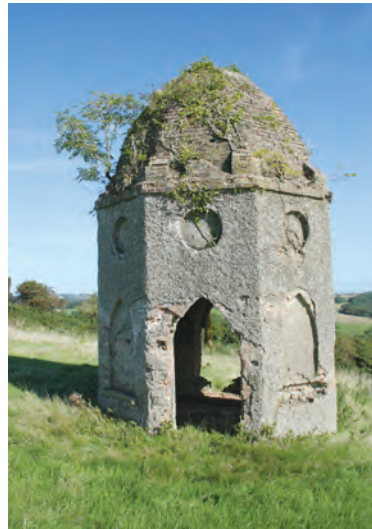
(fig. 40) THE GUGGY Knocklofty Demesne (c. 1820)

Glennconnor was erected as a dower house for Ballingarrane. The wings were added c. 1885 and the portico in 1904. It has an elaborately decorated hall.