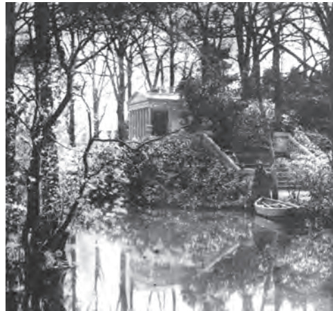
(fig. 83) THE TEMPLE WATER Newtownanner Demesne (c. 1830)