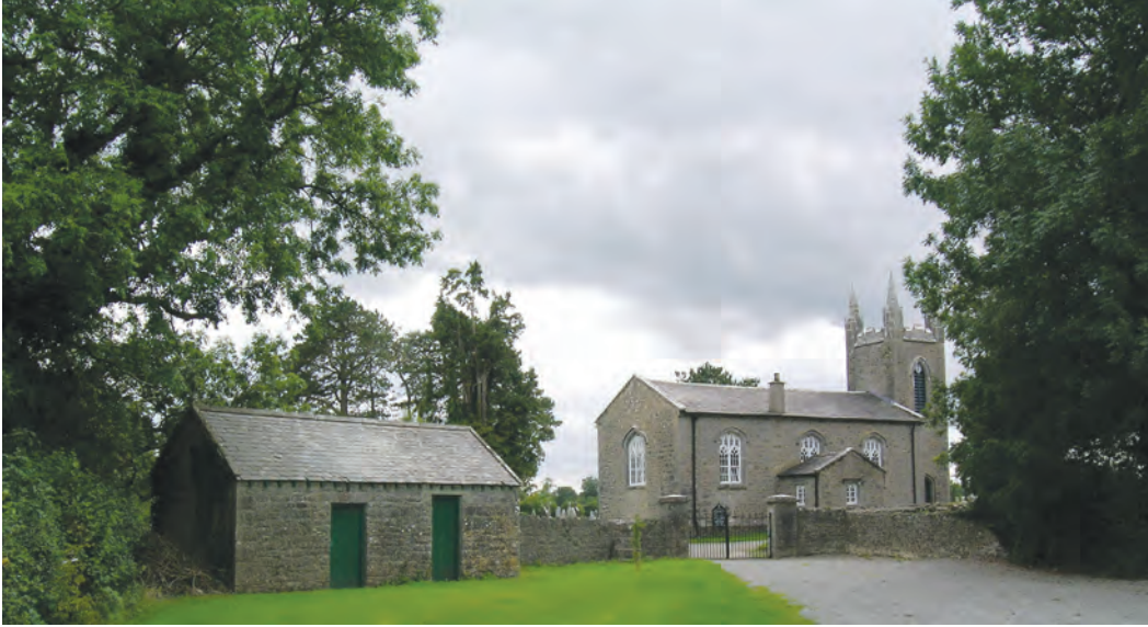
(fig. 152) CHURCH OF THE HOLY SPIRIT Magorban (1813-16)

This Church of Ireland church is the archetypal rural church and graveyard. Its interior evokes a special atmosphere, with a stove for heating, a pump organ for music and candles and oil lamps for lighting, never having been wired for electricity. The ceiling has fine plasterwork details.