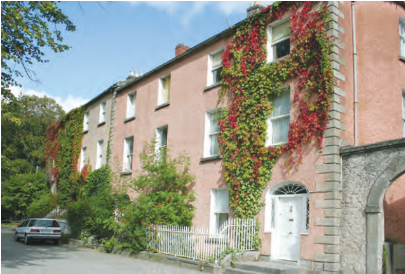
(fig. 118) THE MALL Cahir (1825-30)

This fine terrace of three-storey over basement houses stands overlooking the River Suir near Cahir Castle. Originally, the Castle Street end was closed off by a gate.