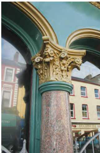
THE AULD MURRAY

One of the most characteristic features of the remarkably unified street architecture of Tipperary Town is the use of arcaded ground floors. In this instance, Corinthian polished granite colonettes separate the windows and the cornice has courses of modillions, and egg-and-dart and leaf motifs.