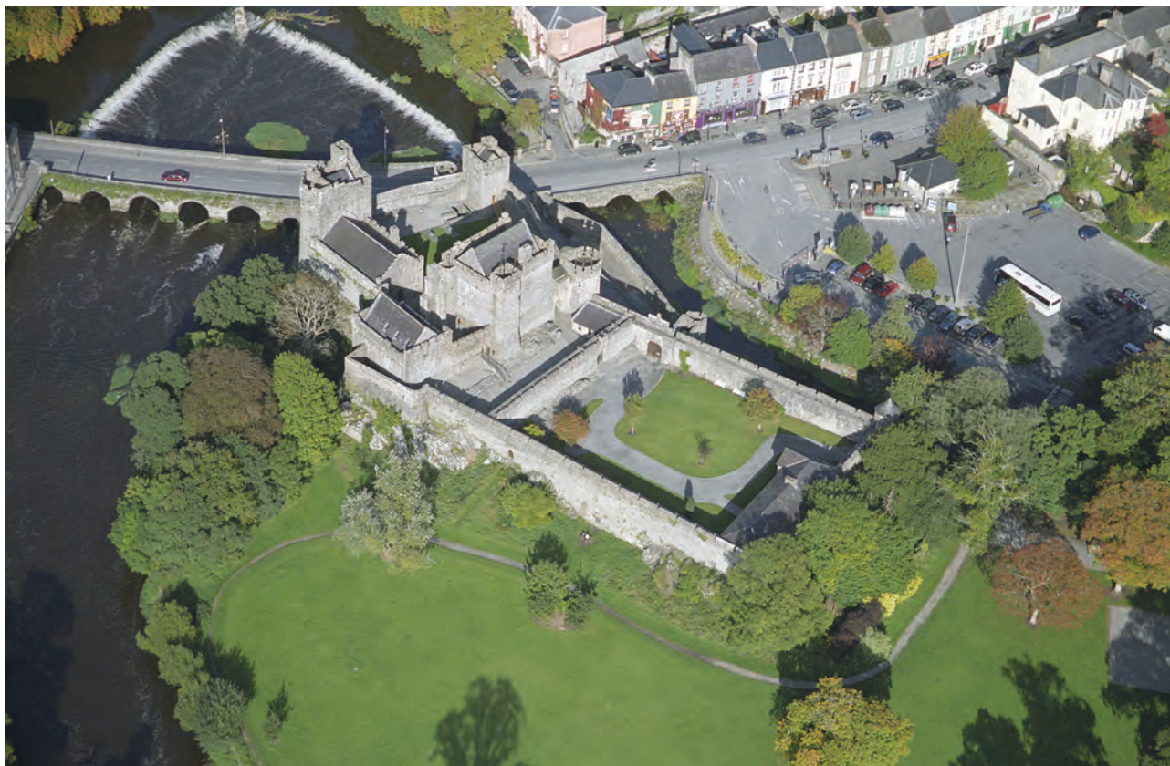
(fig. 6) CAHIR CASTLE Castle Street, Cahir (early 13th century onwards)

Cahir Castle, one of the most intact medieval fortresses in Ireland, was established in the thirteenth century on the site of an earlier stone fortress,