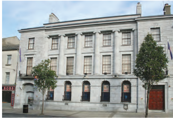
(fig. 188) AIB BANK 65-67 O'Connell Street, Clonmel (c. 1935)

More classical in style is the courthouse at Cashel and the former National Bank in Clonmel ( figs. 187-8 ). Quinlan's public house at Cullen has classical detailing, unusual for a small village ( fig. 189 ). D.W. Parke's chemist shop in Clonmel (c. 1910) has exuberant Edwardian detailing ( fig. 190 ).