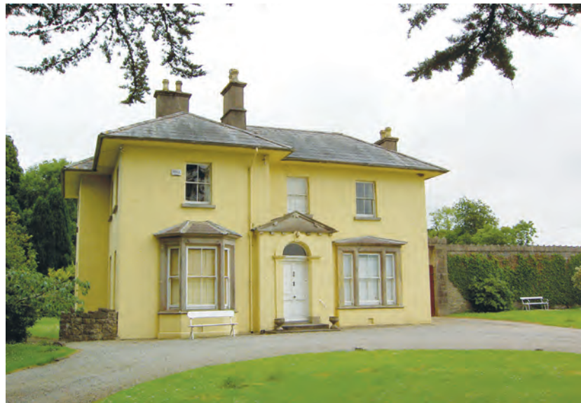
(fig. 178) FRIARSFIELD HOUSE Friarsfield (c. 1870)

The two-over-two pane sliding sash windows of this house at Lisvarrinane are typical of the second half of the nineteenth century. A high degree of symmetry is achieved by the three-bay plan and the centrally-placed chimneystacks.