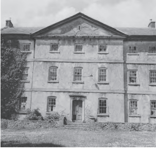
(fig. 50) CASHEL CHARTER SCHOOL Charter-school land, Cashel (1751)