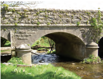
(fig. 64) WILFORD BRIDGE Shangarry (1866)

The river scene at Ardfinnan is dominated by the multi-period castle begun in the reign of King John and guarding the crossing of the Suir, a place which has had a bridge since before 1311. The long thirteen-arch bridge shows evidence of widening to its east side and may incorporate medieval and/or seveneenth-century fabric. The double-pile building at the end of the bridge was formerly part of a large wool factory established in 1869 and operated by Mulcahy, Redmond and Co.