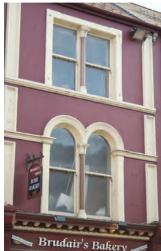
BRUDAIR'S BAKERY Main Street, Tipperary Town (c. 1880)

Marble columns divide the upper floor windows of many buildings on Tipperary's Main Street.