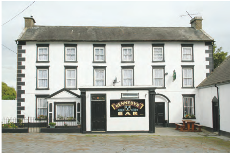
(fig. 69) KENNEDY'S BAR Clonoulty Churchquarter (c. 1860)

Goold's Cross, a rural stop on the Dublin to Cork railway line, had a hotel that would be more appropriate for a town. The retention of timber sash windows and the decorative render, particularly to the gabled projection, are attractive features.