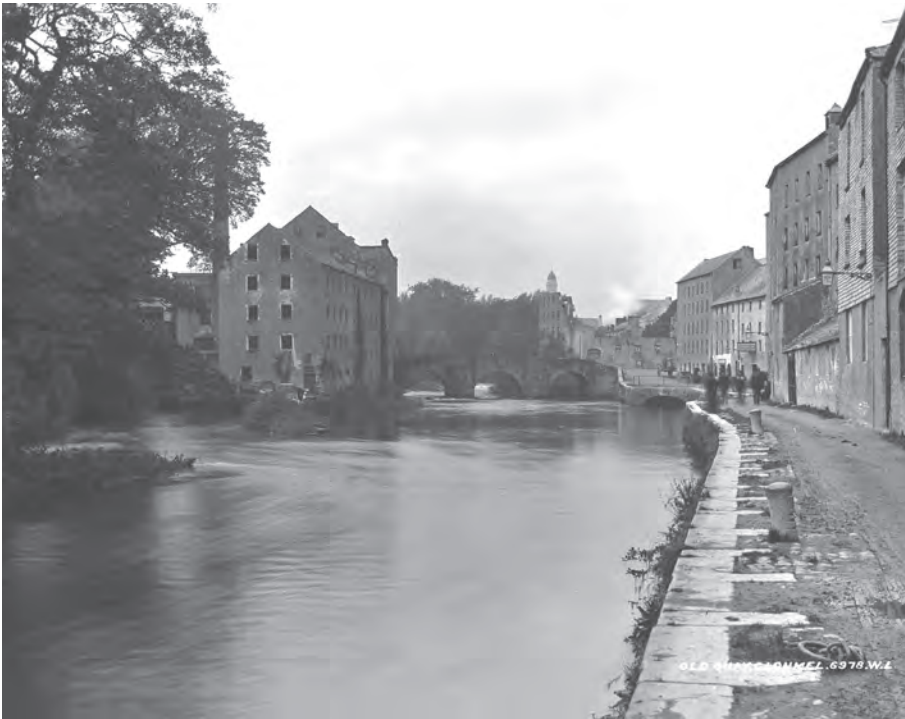
OLD QUAY Clonmel c. 1880

Fitzgibbon's public house has good render detailing in its fluted pilasters, moulded and dentillated cornice and applied lettering.