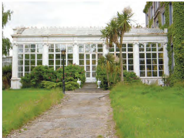
(fig. 15) MARLFIELD HOUSE