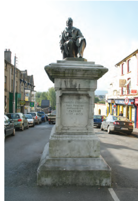
(fig. 174) KICKHAM MONUMENT Kickham Street/ Main Street, Tipperary (1898)