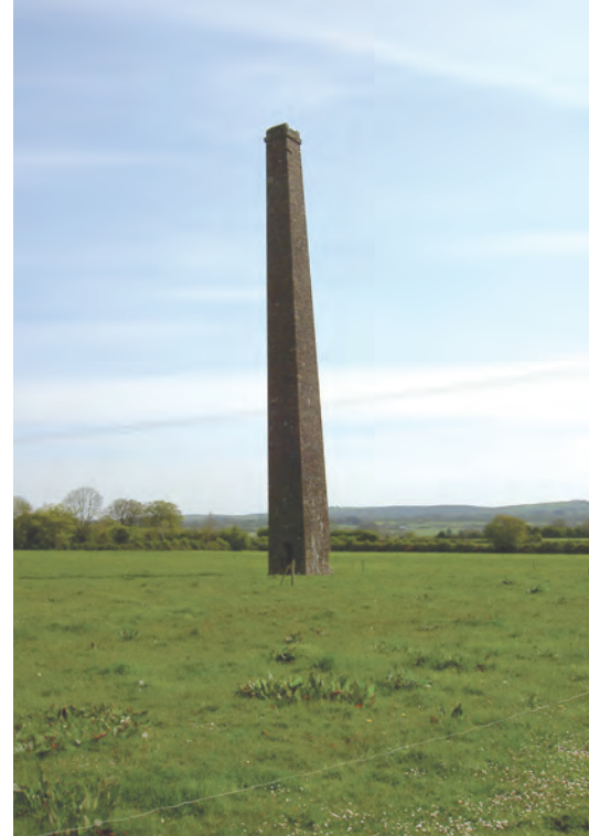
(fig. 73) THE STEEPLE OF COPPER Ballingarry Lower (c. 1830)

Engine houses and chimneys are dotted throughout the Slieveardagh Hills, where coalmining was carried out as early as the seventeenth century. A colliery and a mining village, complete with a school, were established at Mardyke, reputedly the site of the first coal-working of the modern era. The colliery closed in 1919.