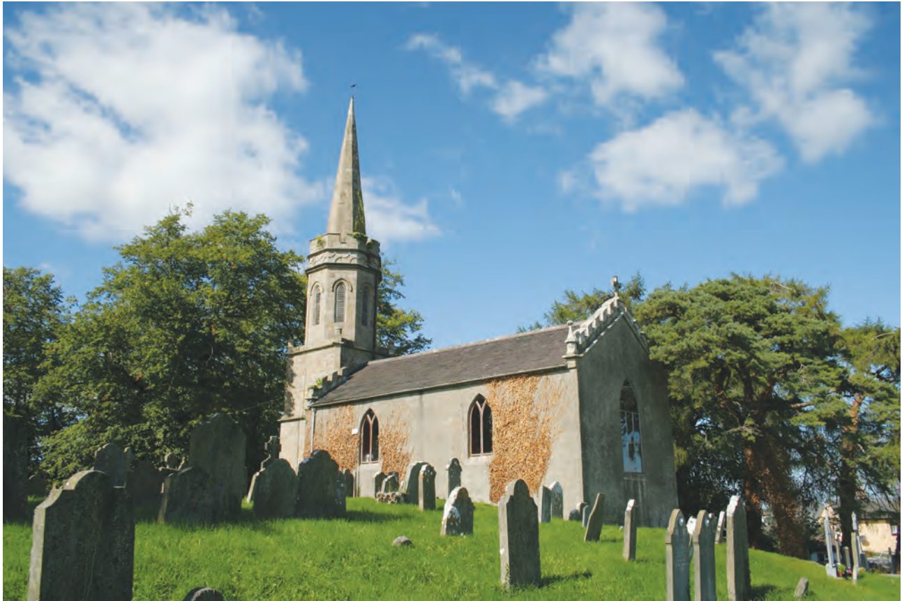
(fig. 57) ST MARY'S CHURCH OF IRELAND Bansha (1718 and 1793-4)

The fine octagonal tower and spire at Bansha were added in 1793-4 and the castellated gables are reminiscent of the later St Paul's Church in Cahir. The church stands on the site of, and may incorporate fabric from, the medieval parish church of Bansha.