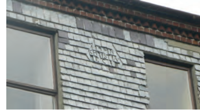
(fig. 31) 1-2 NEW QUAY Clonmel (c. 1765)