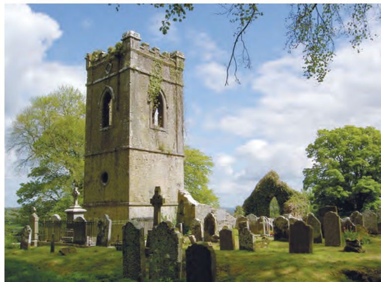
LISMALIN CHURCH OF IRELAND Lismalin (c. 1450, refurbished 1715-16 and 1796)

This average-size rural church, near Ardfinnan, has features typical of such Board of First Fruits churches. The simple rectangular nave, small chancel and west tower were supplemented in the 1860s by the addition of the dressed limestone vestry. The Massey family paid for the interior, executed c. 1870, which is based on Salisbury Cathedral.