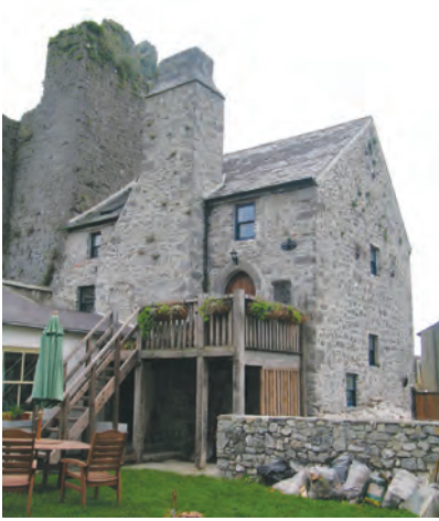
(fig. 7) WATERGATE STREET Fethard (c. 1600)

The surviving medieval town houses in Fethard are arranged around three sides of the medieval churchyard and, unusually, have their principal entrances at first floor level in their rear wall, facing the church.