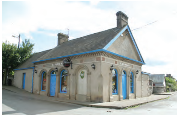
(fig. 189) QUINLAN'S BAR Clonmanagh (c. 1915)

Cashel's relatively modest courthouse was provided with classical-style detailing to its principal elevation.