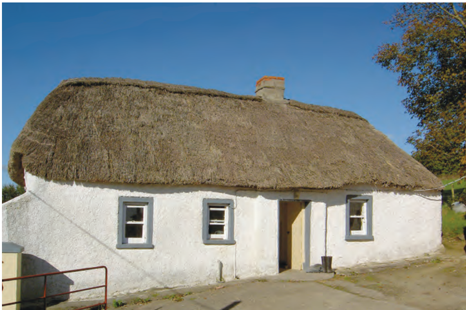
(fig. 59) MOANVURRIN (c. 1800)

Four bays and a hipped roof are typical features of most of the county's lowland vernacular houses. The alignment of chimneystack and entrance indicates a lobby-entry plan, wherein a small wall with a 'spy window' at right angles to the hearth wall forms a lobby to protect the hearth fire from draughts from outside, while allowing the door to be kept open for light and air. This house stands near Drangan.