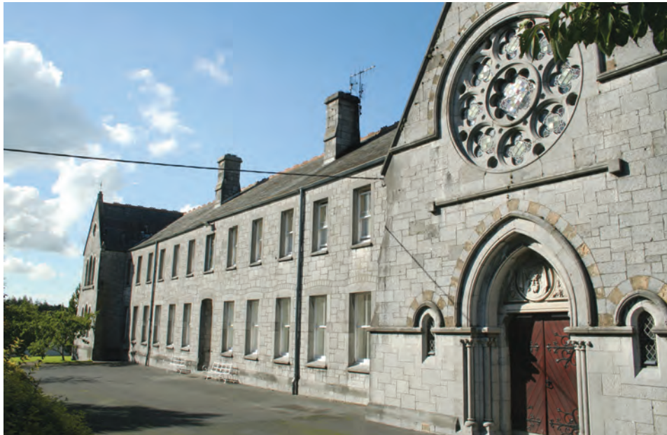
(fig. 172) PRESENTATION CONVENT Convent Lane, Fethard (1870-85)

This convent chapel has high quality limestone work to its public façade, highlighted by the intricate rose window.