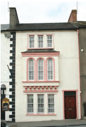
BRUDAIR'S BAKERY Main Street, Tipperary (c. 1880)

This three-light oriel window ornately punctuates the streetscape opposite the streetscape opposite Cahir Castle.