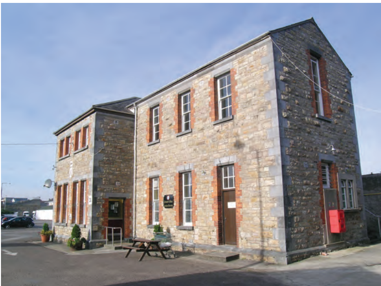
( fig. 141 ) PRIVATES' MESS Kickham Barracks, Davis Road, Clonmel (1876)

The barracks at Clonmel was begun c. 1805. The main building is the Officers' Mess of c. 1830, built in the style of a country house with a pediment and wings connected to the main block by lower arcaded links.