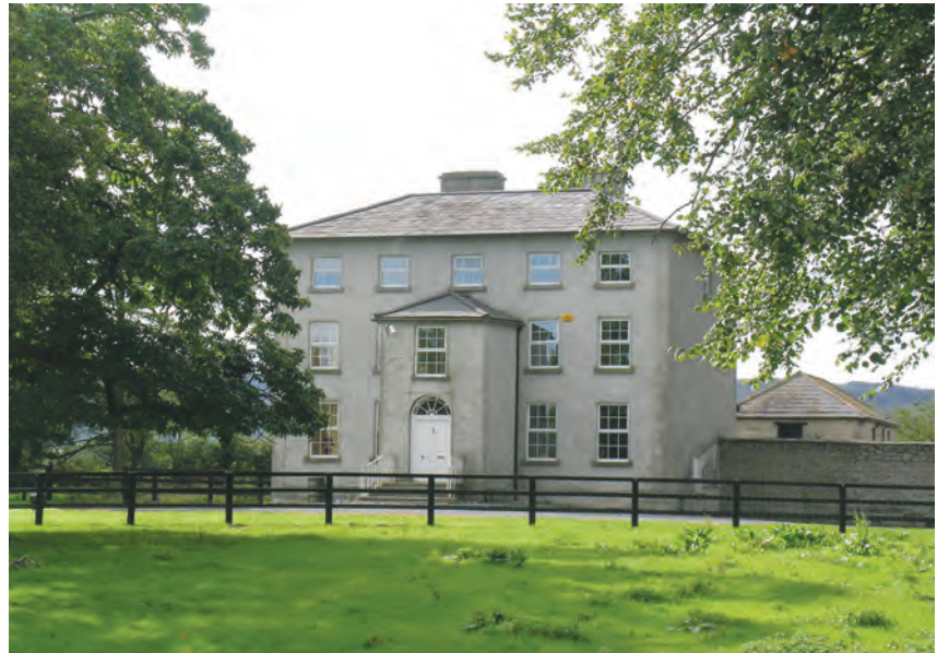
(fig. 51) GLEBE HOUSE Kilvemnon (1781-93)