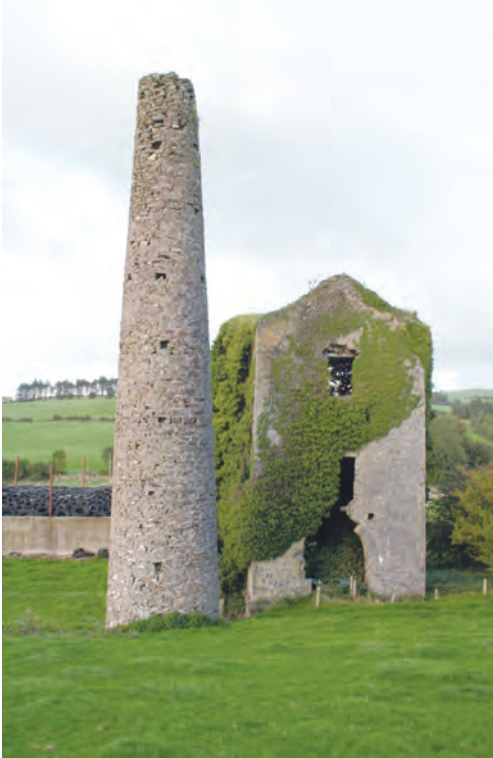
(fig. 72) MARDYKE (1824)

Engine houses and chimneys are dotted throughout the Slieveardagh Hills, where coalmining was carried out as early as the seventeenth century. A colliery and a mining village, complete with a school, were established at Mardyke, reputedly the site of the first coal-working of the modern era. The colliery closed in 1919.