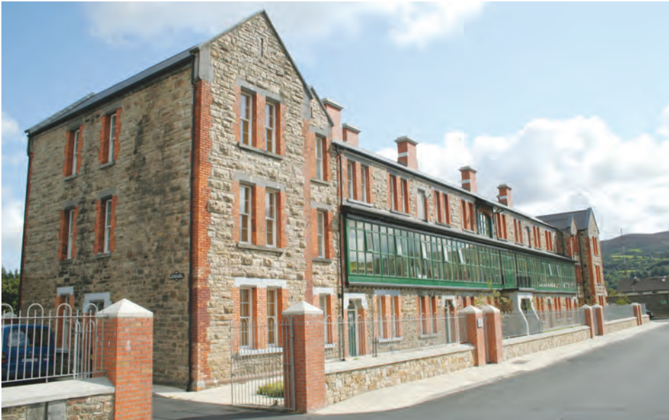
(fig. 125) ST FRANCIS' COURT King Street, Clonmel (1878)

This H-plan former barracks accommodation block was built in 1878 and recently upgraded with the addition of access galleries.