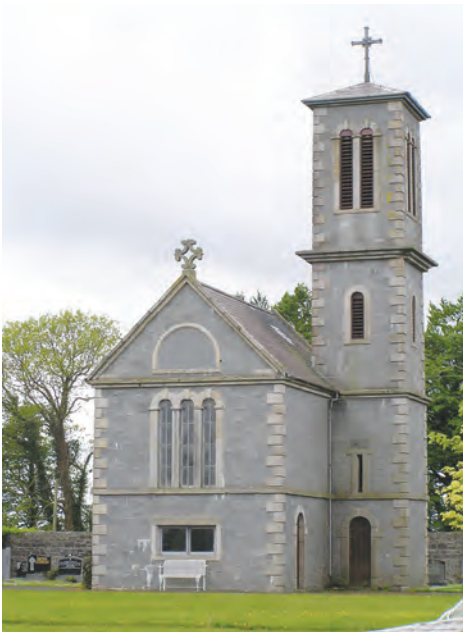
(fig. 80) BIANCONI MORTUARY CHAPEL Ardmayle East (1857)