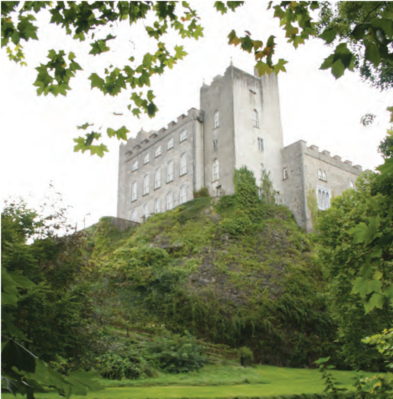
(fig. 22) KILTINAN CASTLE Kiltinan (c. 1215, with later additions)

Dramatically sited on a bluff overlooking the Clashawley River, Kiltinan Castle was probably begun by Philip of Worcester c.1215, when he was granted the lands. It has many similarities with Ardfinnan Castle, although Kiltinan has larger elevations.