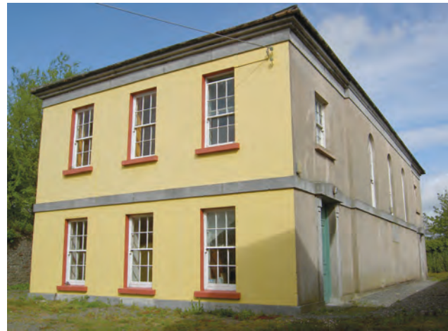
(fig. 138) CLOGHEEN COURT- HOUSE Barrack Hill, Clogheen (1841)

irregular. The ground floor arcade indicates the former function of the building as a market house. The arcade motif continues to the first floor windows of the gable. An armorial plaque of 1631, from an earlier building on the site or elsewhere in the town, is set into the doorway over the lower annex.