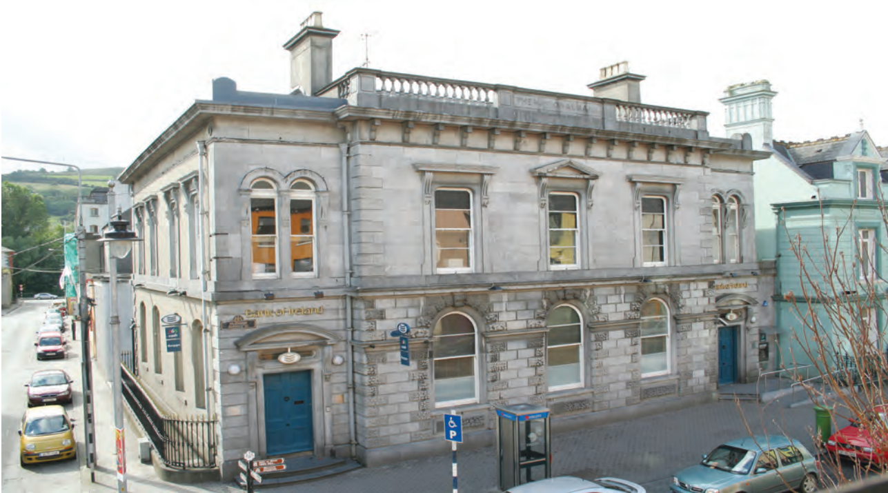
(fig. 115) BANK OF IRELAND Parnell Street/ Nelson Street, Clonmel (c. 1860)

The Italianate palazzo style was very popular in the second half of the nineteenth century for financial institutions. The county town's former National Bank has appropriately classical detailing, enhanced by its prominent corner site close to the town hall and courthouse.