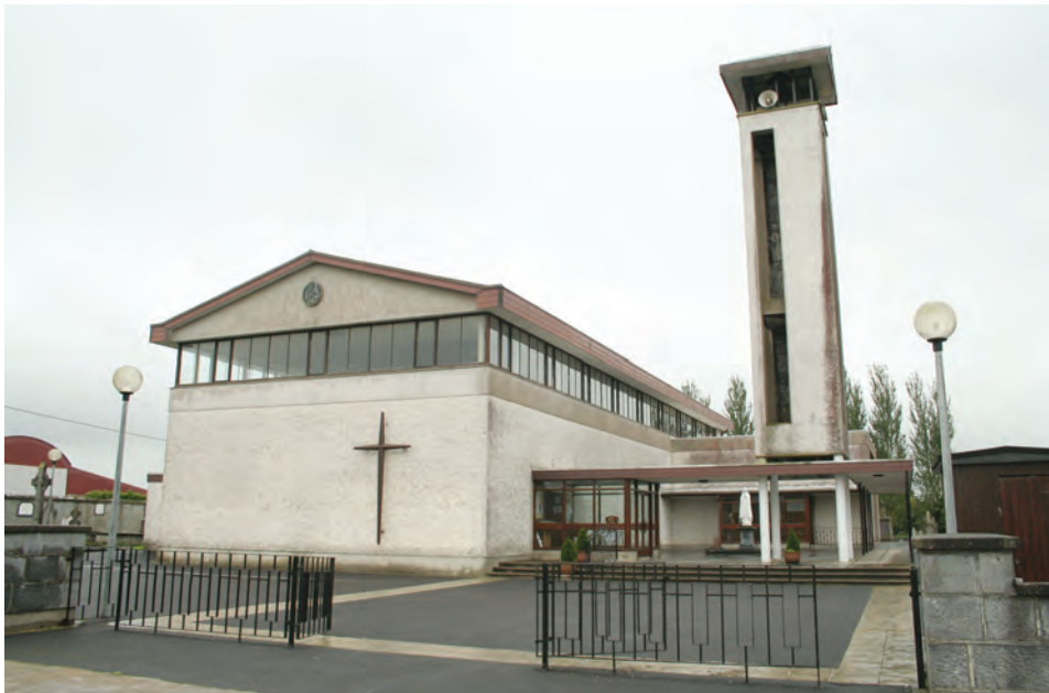
(fig. 197) ST MICHAEL'S CHURCH Callan Street, Mullinahone (1969)

Good use of concrete is evident in this bridge across the Aherlow River, near Cahir. Arched pedestrian ways at each of the four corners give access to the river bank.