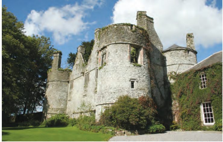
(fig. 8) KILLENURE CASTLE Killenure (Early seventeenth century)

The surviving medieval town houses in Fethard are arranged around three sides of the medieval churchyard and, unusually, have their principal entrances at first floor level in their rear wall, facing the church.