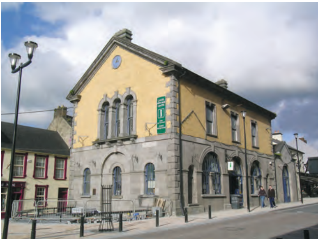
(fig. 137) CASHEL TOURIST OFFICE Main Street, Cashel (1866)

detailing and stands proudly in the centre of the medieval marketplace (fig. 137). The former town hall in Cahir had its ground floor broken out in the twentieth century. Elsewhere in the county, courthouses were built with modest architectural ambitions: those at Carrick-on-Suir, Clogheen and Tipperary Town use a standard design attributed to William Caldbek (fig. 138). All three have five-bay two-storey principal elevations and similar limestone details, such as a plat band between the floors, a moulded cornice and pediments over the paired doorways. The building in Tipperary Town (1839) was built by J.K. Fahie and has a return block to give a T-plan. Wherever courts