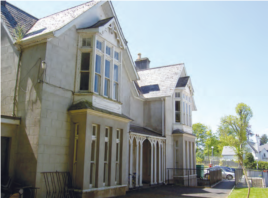
(fig. 122) LORETO CONVENT Coleville Road, Clonmel (c. 1840)