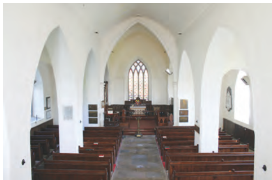
(fig. 56) HOLY TRINITY CHURCH OF IRELAND

The immense tower of the medieval parish church of Fethard is the town's dominant landmark. The present church occupies the nave of the original, the chancel and Lady Chapel being ruined and roofless.