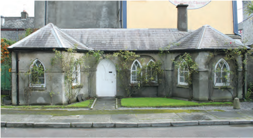
(fig. 27) CASHEL PALACE HOTEL Main Street, Cashel (c. 1750)

A pretty gate lodge adorns the approach to the Cashel Palace, its low size and Gothic door and window openings being in stark contrast to surrounding buildings.