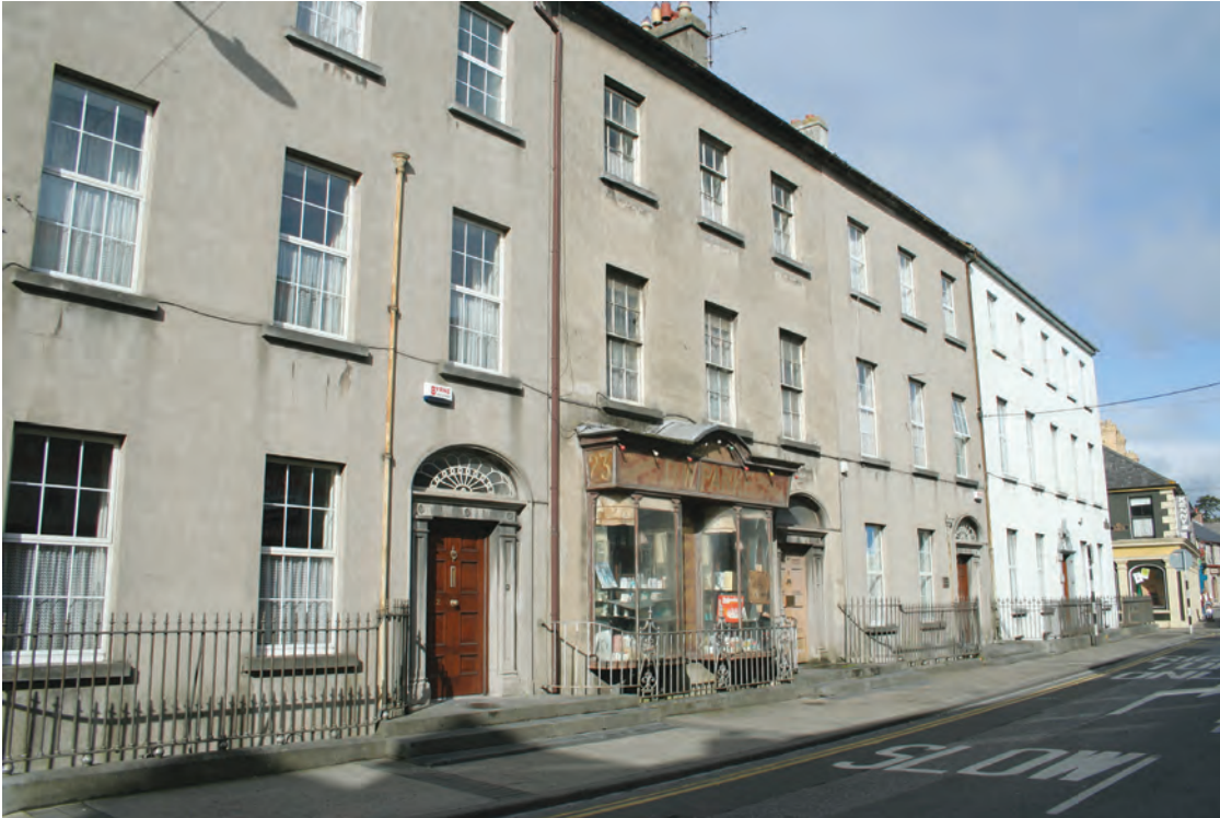
(fig. 103) 22-25 GLADSTONE STREET Clonmel (c. 1840)

A terrace of substantial town houses of three storeys over basements with elaborate limestone doorcases and cast-iron railings.