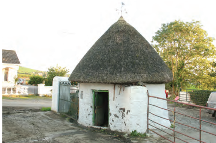
(fig. 97) MONSLATT (c. 1800)

This well-maintained out-building stands in the small farmyard of a thatched house just outside Tipperary Town.