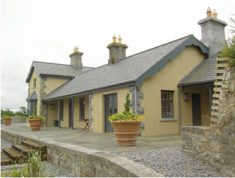
(fig. 68) FARRANALEEN RAILWAY STATION Farranaleen (1880)

Its single-storey size reflects the status of the station on the branch line between Clonmel and Thurles. Rock-faced limestone quoins, dressed limestone chimneystacks and carved timber bargeboards add decorative detail. The station has a small, well-kept goods shed, its original platforms, and a cast-iron milepost. This railway line was closed in 1964.