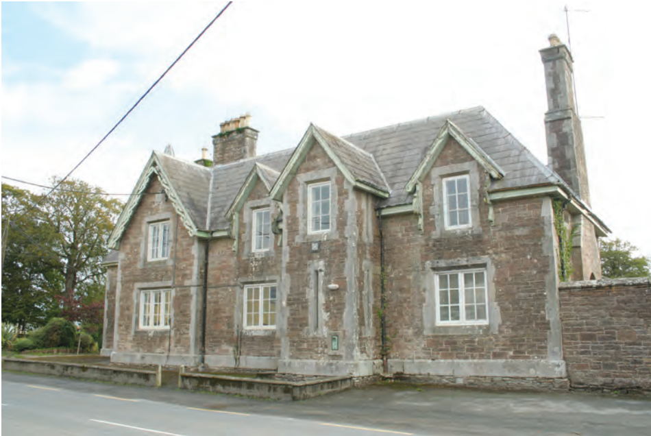
(fig. 145) DUNDRUM GARDA STATION Garryduff East (c. 1865)

Tudor Revival style and detailing are evident in this distinctive former RIC barracks. It was built under the influence of the Hawardens of Dundrum House, as part of what has been described as a 'carefully contrived alien cell with its inn, courthouse, Anglican church, corn mill and constabulary barracks'.