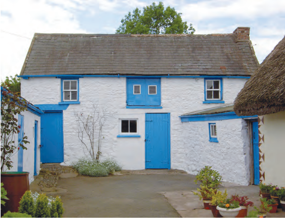
(fig. 96) MURGASTY (c. 1800)

This well-maintained out-building stands in the small farmyard of a thatched house just outside Tipperary Town.