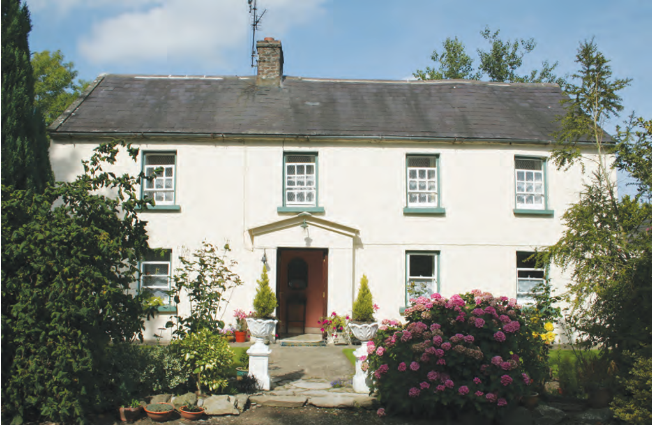
(fig. 95) MOORSTOWN (c. 1850)

Intact two-storey vernacular houses, like this one near Cahir, are relatively rare. They share the traditional plan and layout of the smaller houses. The chimneystack and entrance of this farmhouse betray a lobby-entry layout.