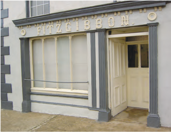
(fig. 110) FITZGIBBON Main Street/ Chapel Street, Cappawhite (c. 1860)

Fitzgibbon's public house has good render detailing in its fluted pilasters, moulded and dentillated cornice and applied lettering.