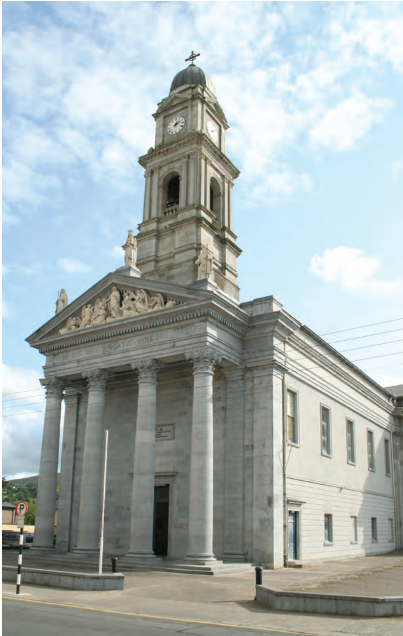
(fig. 158) ST MARY'S CHURCH Irishtown, Clonmel (1837-80)

Designed by J.B. Keane, St Mary's is a monumental building on the site of a thatched penal chapel. Most of the building is rendered, but an optical illusion is created when one stands directly in front, by the use of ashlar limestone to the gable-front and the forward-facing elevations of the transepts. The portico, with a tower of 1880 and a portico of 1890, has fine classical detailing, the effect heightened by the statues to the pediment.