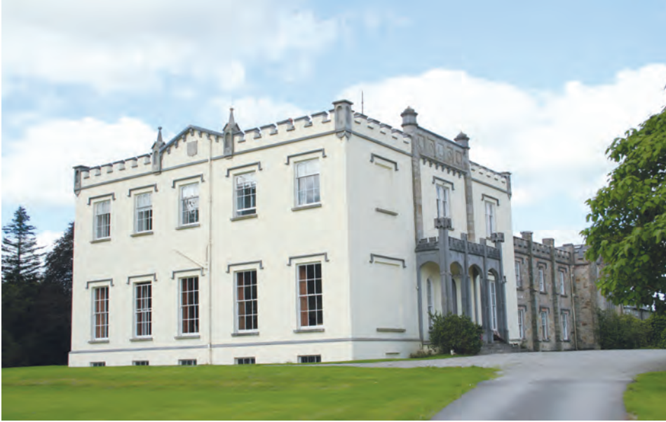
(fig. 86) LISMACUE HOUSE Lismacue (Remodelled 1816)

The south block of Lismacue, at Bansha, dates to c. 1760, the building being extended in 1816 and the ornate Gothic façades applied. The entrance bay is framed in cut limestone and sandstone with decorative shield devices to the parapet. The use of blind window openings is curious and the stonework of the lower service block to the north, although sharing many of the details of the main house, is left unrendered.