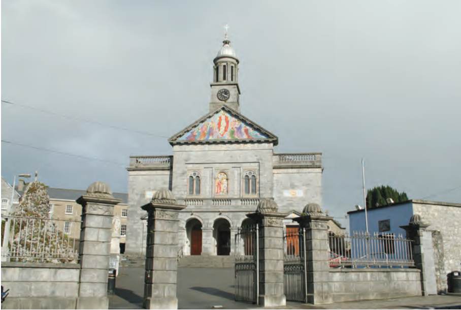
(fig. 162) ST JOHN THE BAPTIST CHURCH Friar Street, Cashel (1772-1804, refronted c. 1890)