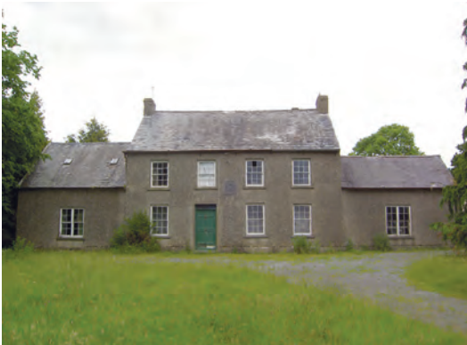
MANGANSTOWN HOUSE Mauganstown (1648, refenestrated c. 1750)