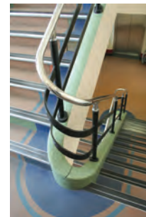
OUR LADY'S HOSPITAL

The building has a fine main staircase. A newspaper at the time reported it as having '64 beds, with private wards for paying patients, is equipped in the most modern manner, and has an 'iron lung' provided by Lord Nuffield'.