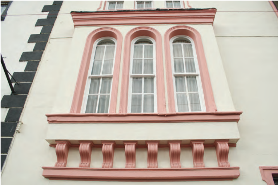
(fig. 108) CASTLE STREET Cahir (c. 1860)

This three-light oriel window ornately punctuates the streetscape opposite the streetscape opposite Cahir Castle.