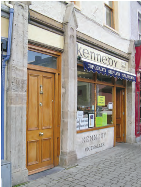
(fig. 107) KENNEDY The Square, Cahir (c. 1840)

William Tinsley was engaged by the Earl of Glengall to remodel much of the town of Cahir. This resulted in the consistent treatment of façades, especially on the north side of Castle Street and the west side of The Square. His hallmark is the distinctive use of gabled, panelled pilasters in ashlar sandstone. The leftmost pilasters are replacements for three lost by the late nineteenth century.