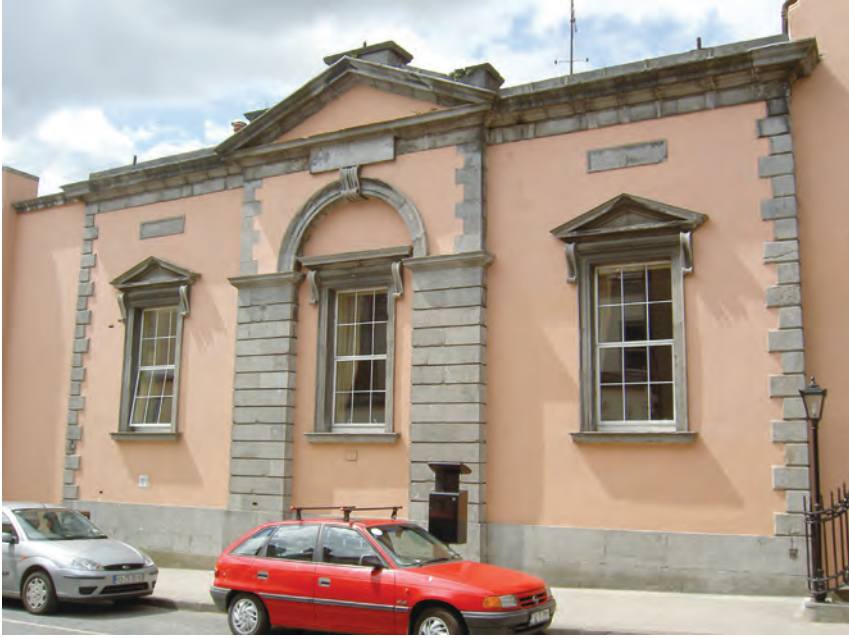
(fig. 113) CLONMEL ARMS HOTEL Sarsfield Street, Clonmel (c. 1845)

The former Trustee Savings Bank was designed with fine classical detailing. It stands on Sarsfield Street, a thoroughfare that is particularly rich in historic buildings.