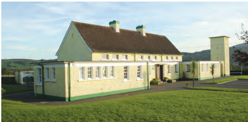
(fig. 193) KILVEMNON NATIONAL SCHOOL Kilvemnon (1961)

Standard designs were produced for national schools throughout the State. This type has clerestory windows to the main block, projecting service wings to the front, a water tower to one end and a bicycle shed to the rear. The school is set in pleasantly lawned grounds.