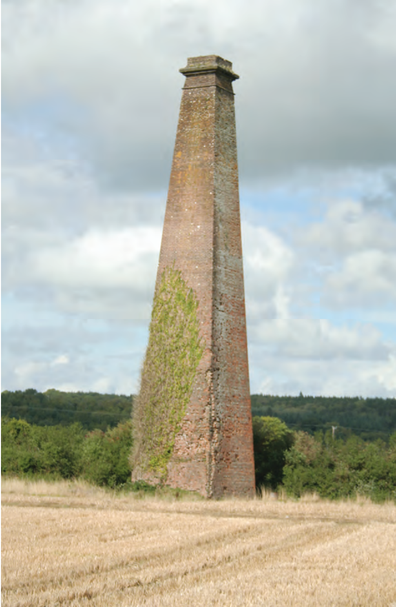
(fig. 75) KILTINAN (c. 1880)

The promoters of a brick-works at Kiltinan, near Fethard, had invested on the assumption that they would be provided with a siding off the Clonmel-Thurles railway line. They were to be disappointed and abandoned the project, having only built the chimney.