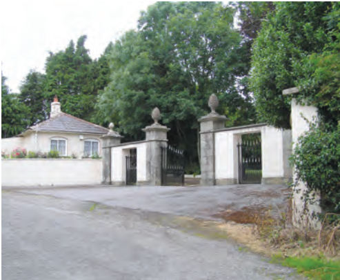
(fig. 89) SUMMERHILL HOUSE Summerhill (c. 1820)