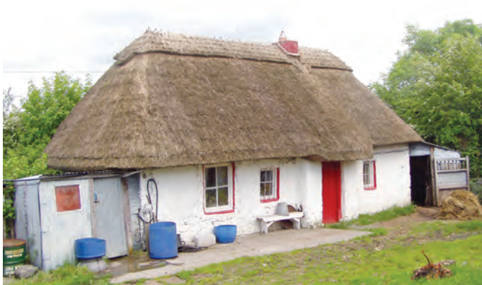
( fig. 93 ) BALLYDUGGAN (c. 1800)

Modest single-storey vernacular houses, with farm buildings ranged around a yard, were built throughout the first half of the century. Most have been extended over time and their original thatched roof-coverings replaced with slate or corrugated iron ( figs. 93-4 ). In South Tipperary, water reed is the most common thatching material, but there is evidence that