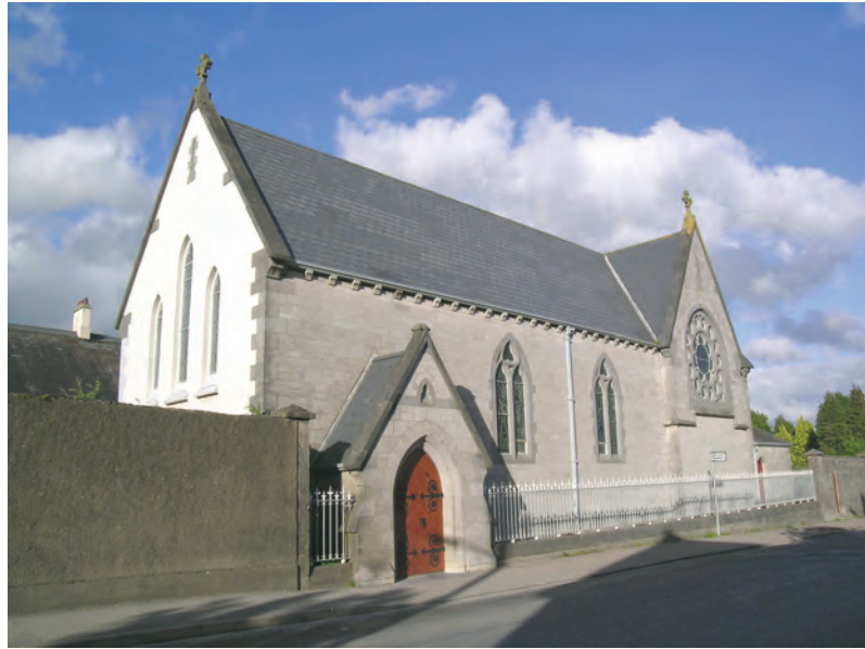
(fig. 171) ST ANNE'S CONVENT Rosanna Road, Tipperary (1886)

The revival of Catholic political and economic influence is also visible in the building of convents, often on prominent sites, on the urban periphery. Some convents had been built in the eighteenth century, but after Catholic Emancipation there was a notable increase in the number and size of these developments. The complexes included chapels, gardens and, on occasion, industrial schools. St Anne's Convent in Tipperary Town opened in 1868, although the present building dates from 1877. The convent chapel was designed by George Ashlin and opened in 1885 ( fig. 171 ). The fine Presentation Convent at Fethard is a particularly good example of a medium-sized convent building, dating from 1862, but having additions of 1885 ( fig. 172 ). Rockwell College, near New Inn, is an impressive complex with its origins in a country house of c. 1830 ( fig. 173 ).