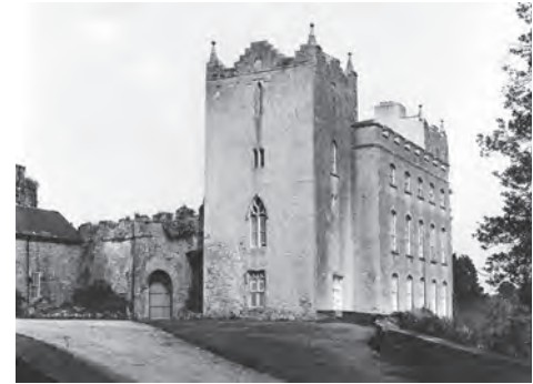
(fig. 23) KILTINAN CASTLE