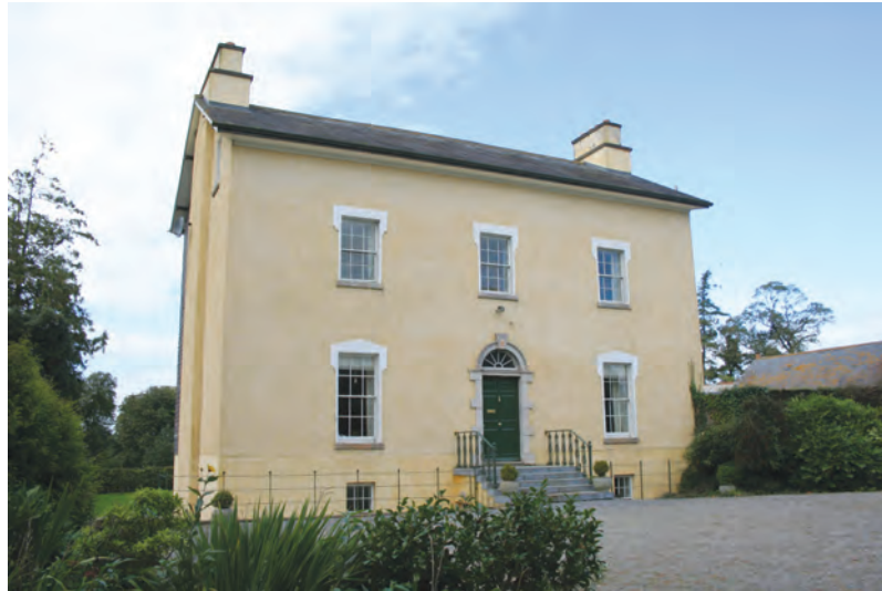
(fig. 33) THE GLEBE Templenoe (1776-84)

Lake, is slate-hung to its southern half and Killough Castle and Templenoe House have slate-hung rear and side elevations ( fig. 33 ). In Shanrahan graveyard, near Clogheen, there is evidence of weather-slating in an unusual application, on a ruined eighteenth-century church tower: only a few slates survive, but the imprint of others is clearly visible. The exposed south wall of Clonmel's West Gate is another non-domestic instance. Slates used in this technique are small and light, probably often off-cuts or rejects. Traditionally, they are bedded in lime mortar instead of being nailed to laths as in roofing applications, although sometimes this is done to effect patch repairs. The south gable of 22 Gladstone Street, Clonmel, has been recently repaired using the traditional technique.