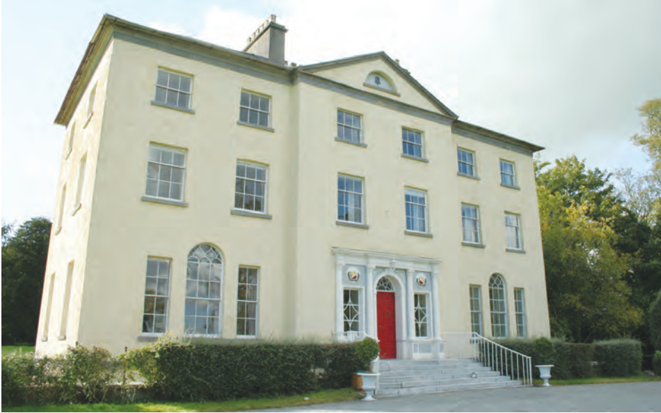
(fig. 35) BALLYOWEN HOUSE Newpark (c. 1760)

The Pennef(e)ather family built Ballyowen, near Cashel, a house distinctive for the Venetian arrangement of openings to the ground floor, a feature reminiscent of the Cashel Palace.