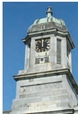
ST LUKE'S HOSPITAL

The former mental hospital at Clonmel was influenced by the work of Francis Johnston and is similar to that in Waterford City. Of good quality limestone work, the long horizontal composition is given added interest by its louvered 'top knot' or tower, which has a date of 1833 inscribed in Roman numerals to the base.