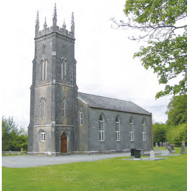
(fig. 151) KILCOOLY CHURCH OF IRELAND CHURCH Kilcoolyabbey (1829)

Ardmayle Church of Ireland is a classic example of a nineteenth-century edifice utilising a pre-existing religious site. The fifteenth-century tower of the medieval church has been incorporated into the later building, whose delicately carved timber windows have trefoil-headed lights.