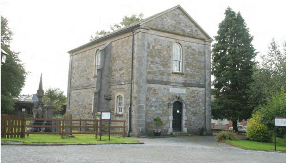
(fig. 157) BOLTON LIBRARY John Street, Cashel (1836)

Built in 1833 and used until 1881 as a Quaker meeting house, the simplicity of this neo-Classical building is elevated by the arched recesses with their fine small-pane timber sliding sash windows. The blind window to the gable is the first view of the building from the street, emphasising the relative modesty of Quaker religious buildings.