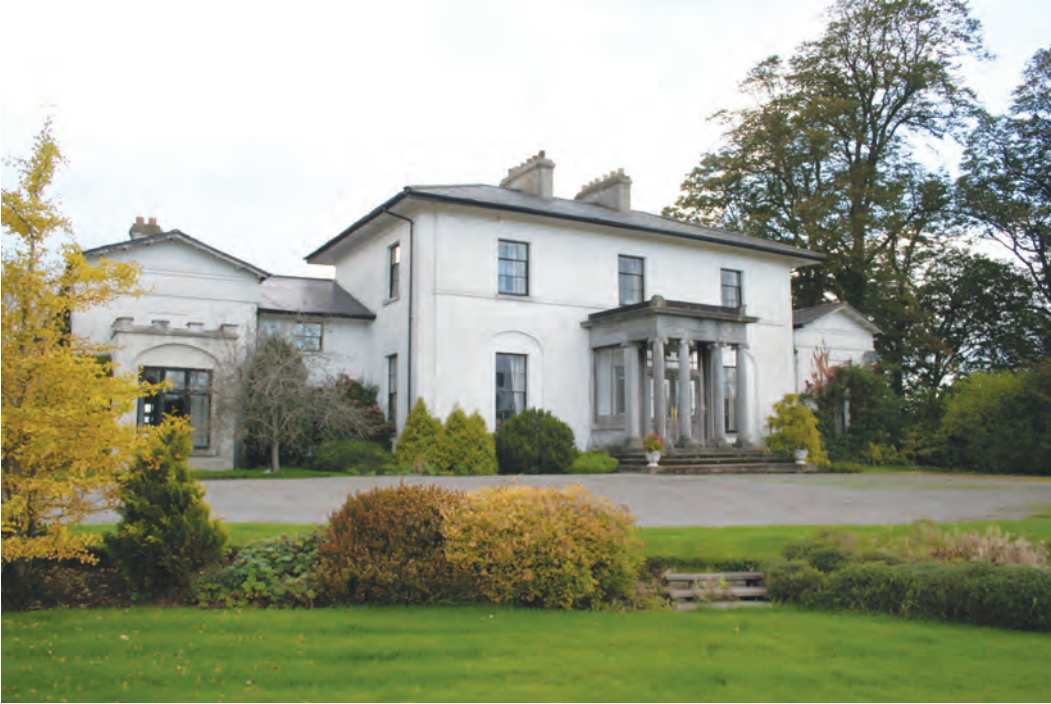
(fig. 39) GLENCONNOR HOUSE Glennconnor (1797)

Glennconnor was erected as a dower house for Ballingarrane. The wings were added c. 1885 and the portico in 1904. It has an elaborately decorated hall.