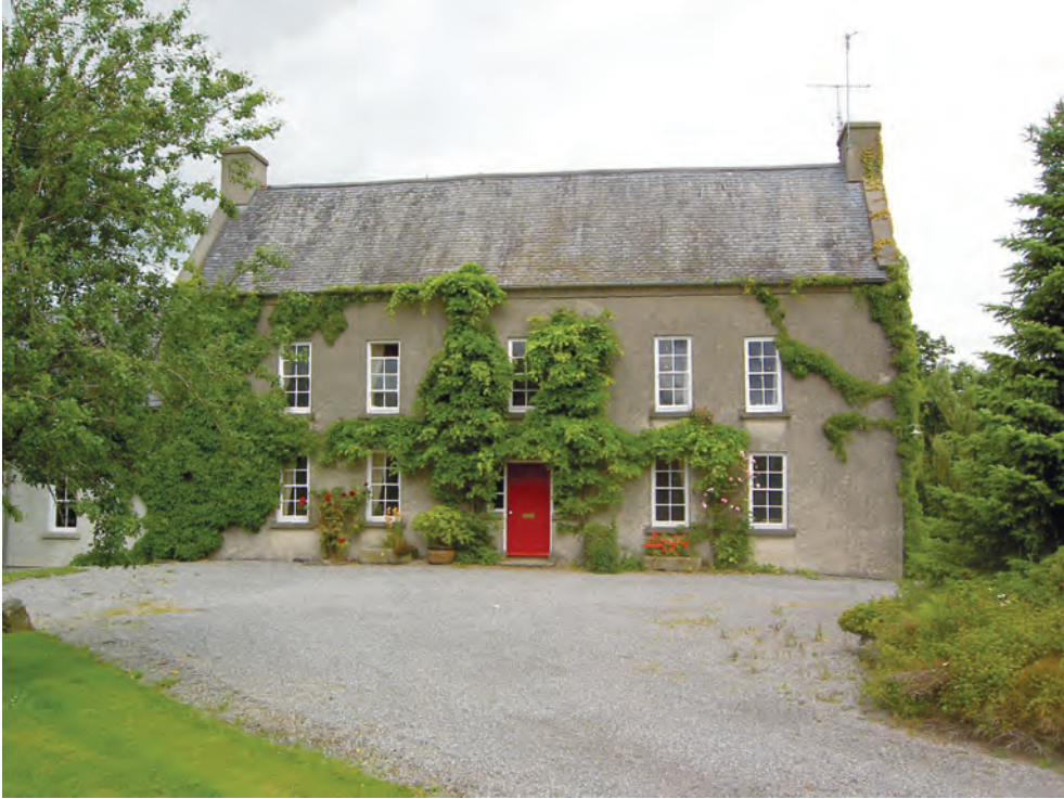
(fig. 29) CLONBROGAN HOUSE Clonbrogan (c. 1700)

This is a rare example of a small early eighteenth-century farmhouse. There are attic windows high in the gables and, unusually, only one original rear window.