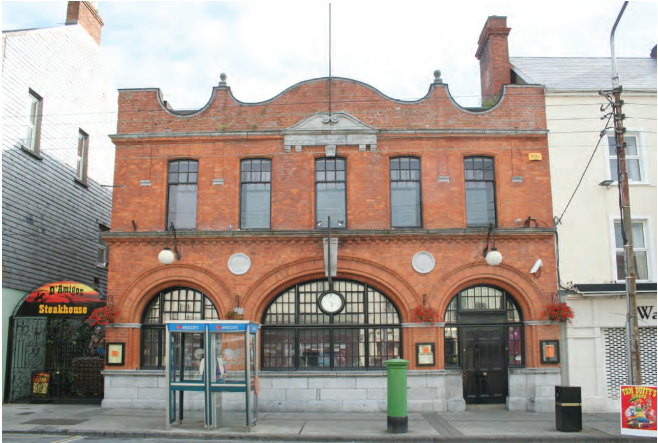
(fig. 184) CLONMEL POST OFFICE (former) Gladstone Street, Clonmel (1901)

Executed in Flemish Revival style by Edward Kavanagh, this former post office displays an accomplished use of brick, with many fine details in its pleasant, harmonious facade. The incorporation of a clock and a date plaque is typical of such public buildings. It was one of a series of post offices built in the county in the very early 1900s.