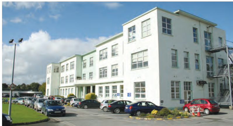
(fig. 192) OUR LADY'S HOSPITAL The Green, Cashel (1934-40)

However, the attitude of the young Free State held out a different promise for public architecture. In 1922, Darrell Figgis, then a minister in the government, called for 'simplicity and truth', the abandonment of 'antique manners' and the 'cleansing' of imitations, in what was akin to a manifesto for International Modernism. The 1930s witnessed a programme of modern construction to meet the requirements of the newly established Electricity Supply Board, and for the health and postal services. Cashel Post Office (1934) is an idiosyncratic combination of modern and traditional idioms (fig. 191). Its two-storey flat-roofed corner tower is almost abstract in its use of solid and void, but its single-storey elevations, to two streets, have strong historical references in the form of round-headed windows and, on one elevation, a pitched roof. Prior to the launch of a programme of hospital construction, the architect Vincent Kelly was commissioned by the government to study contemporary hospitals in a range of European countries. Kelly designed Our Lady's Hospital, Cashel, opened in 1940, as part of that programme. The massing, fenestration and the use of reinforced concrete, make this hospital a significant expression of the new architecture (fig. 191).