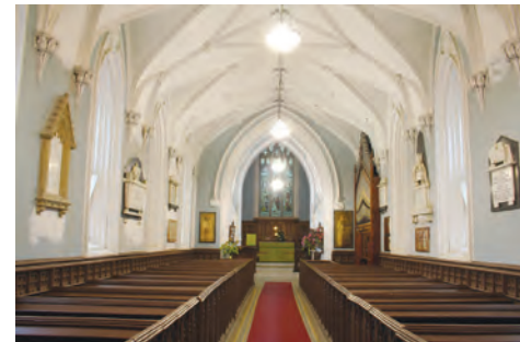
ST PAUL'S CHURCH

The plasterwork in St Paul's ceiling incorporates decorative bosses at all intersections of the ribbed vaulting, each displaying a different form of foliage, with a coiled serpent over the crossing. The carved timber pews are rare survivors.