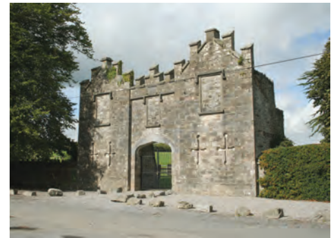
(fig. 24) KILTINAN CASTLE Kiltinan (1842)

The southern gate to Kiltinan, facing the road to Kilsheelan, was an RIC barracks for part of its life. Its design and detailing reflect the nature of the country house that it serves.