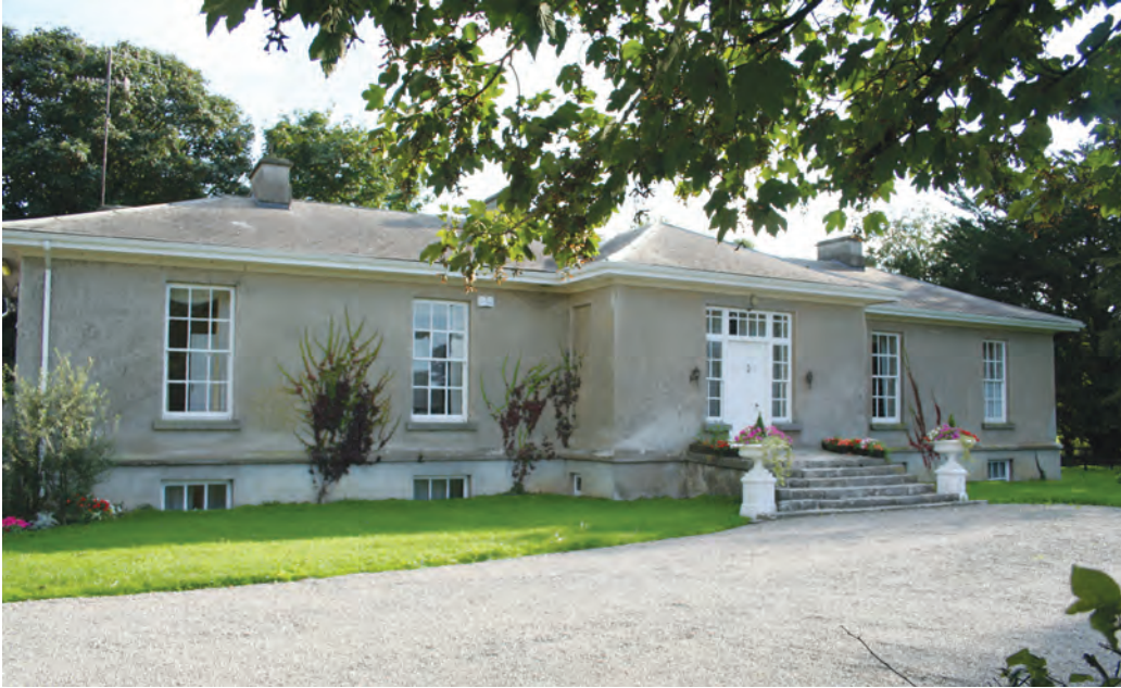
(fig. 91) KILMURRY LODGE Ballynamona (Kilmurry par.) (c. 1830)

This is a rare example in South Tipperary of a villa-type house. It is enhanced by the elegant steps to the projecting entrance bay and the string course between the piano nobile and the basement. It is located near Ballyneill.