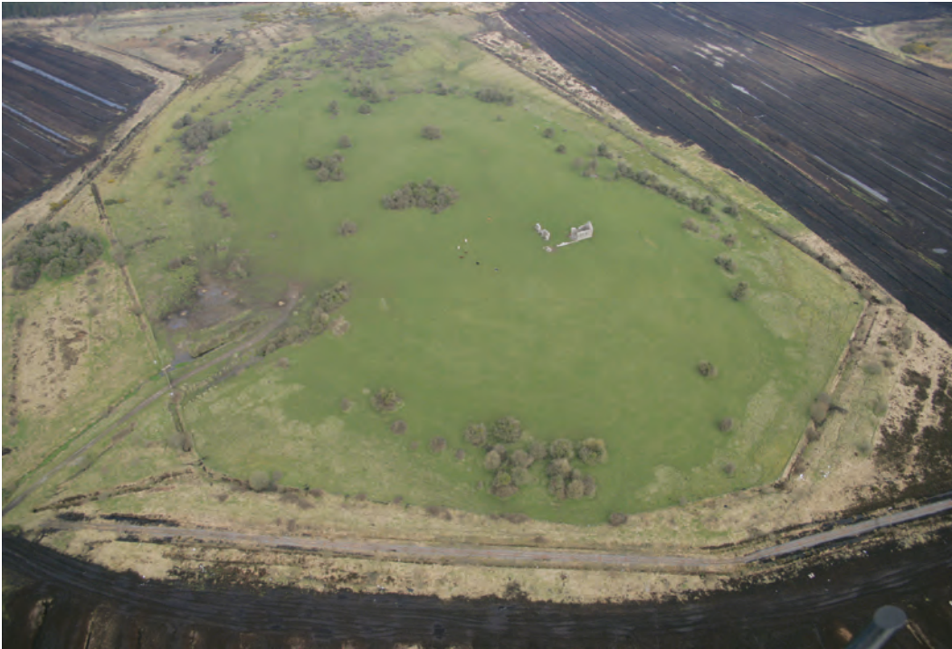
(fig. 3) DERRYNAFLAN ISLAND Lurgoe (Monastery founded sixth century AD)

Cormac's Chapel, on the world-famous Rock of Cashel, is undoubtedly Ireland's finest Romanesque building. The north doorway of the chapel displays classic Romanesque lozenge and chevron details. The capitals are, characteristically, all carved differently. The tympanum depicts a scene with a large lion being hunted by a centaur (half-man, half-horse).