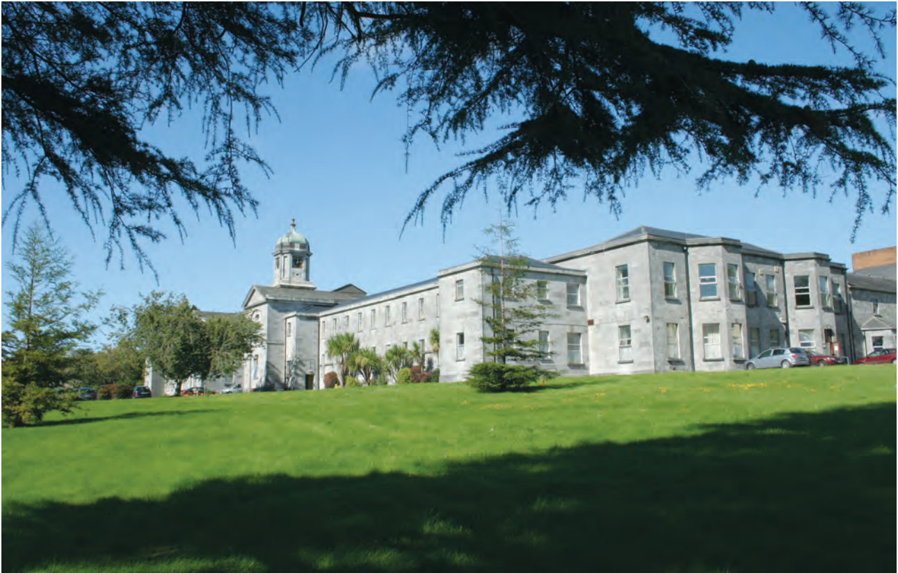
(fig. 148) ST LUKE'S HOSPITAL Western Road, Clonmel (1833)

The former mental hospital at Clonmel was influenced by the work of Francis Johnston and is similar to that in Waterford City. Of good quality limestone work, the long horizontal composition is given added interest by its louvered 'top knot' or tower, which has a date of 1833 inscribed in Roman numerals to the base.