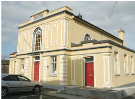
(fig. 187) CASHEL COURTHOUSE Hogan Square, Cashel (c.1910)

Built unusually late in the history of stone-fronted banks, this example stands out on Clonmel's principal thoroughfare due to its bulky form, ashlar limestone and the Giant Order engaged columns to its upper floors.