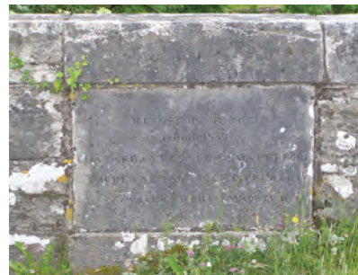
(fig. 65) KINGSTON BRIDGE Barnahown (1859)

A small three-arch bridge over the King's River displays high quality craftsmanship in its contrasting stonework - rock-faced parapets and arch spandrels, and finely dressed string course, arch voussoirs and round cutwaters.