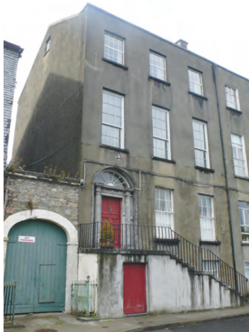
(fig. 119) 3 NEW QUAY Clonmel (c. 1805)

This fine terrace of three-storey over basement houses stands overlooking the River Suir near Cahir Castle. Originally, the Castle Street end was closed off by a gate.