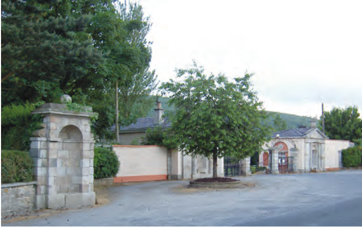
(fig. 16) MARLFIELD HOUSE

The fine neo-classical entrance gates, incorporating gate lodges, to Marlfield House were designed by William Tinsley in 1833. The gates, the finest nineteenth-century example in the county, are sited in Marlfield village, which is very much a demesne creation.