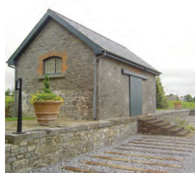
FARRANALEEN RAILWAY STATION

Its single-storey size reflects the status of the station on the branch line between Clonmel and Thurles. Rock-faced limestone quoins, dressed limestone chimneystacks and carved timber bargeboards add decorative detail. The station has a small, well-kept goods shed, its original platforms, and a cast-iron milepost. This railway line was closed in 1964.