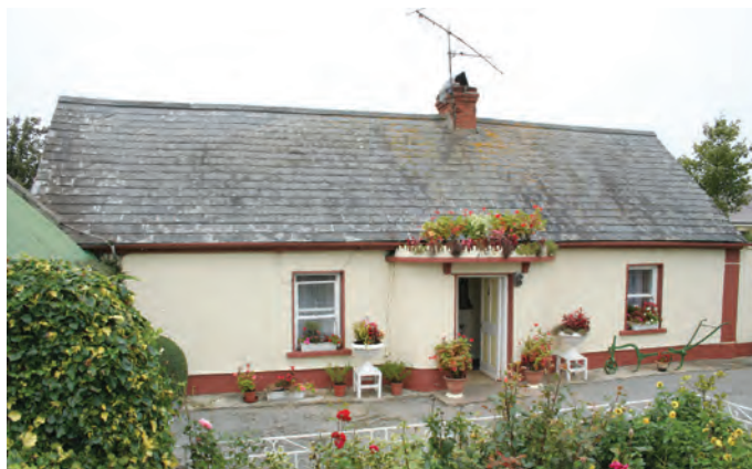
( fig. 94 ) NOAN (c. 1800)

The traditional irregularity of fenestration is seen in this rural thatched house near Ninemilehouse. Its steeply-pitched thatched roof and shallow windbreak are also typical.