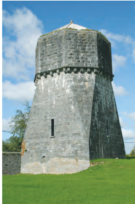
(fig. 142) TIPPERARY MILITARY BARRACKS Station Road, Tipperary (c. 1880)

An unusual and well-built limestone water tower is the only building still standing within the boundary walls of the former military barracks at Tipperary.