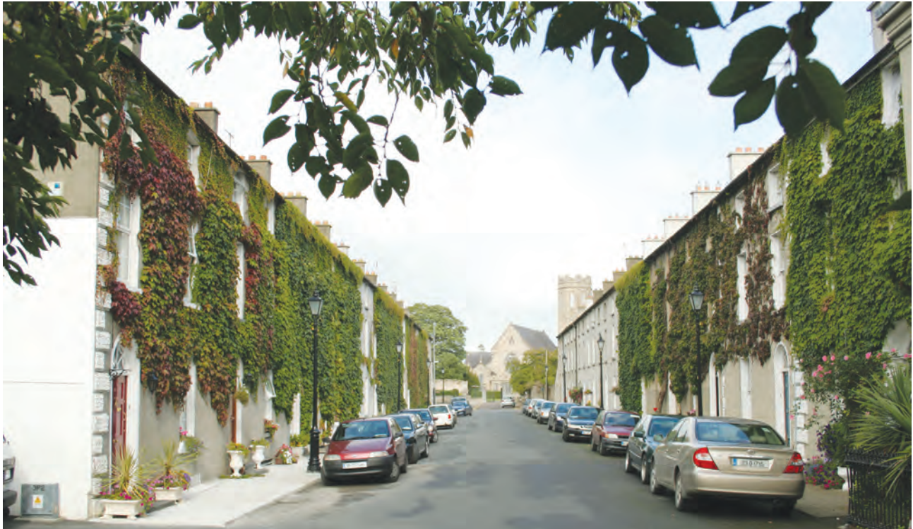
(fig. 116) 1-24 ANNE STREET Clonmel (1821)