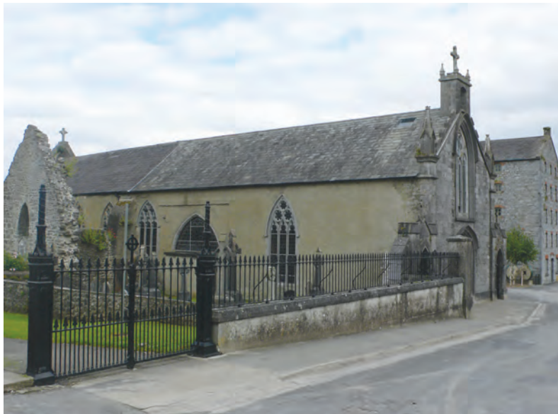
( fig. 100 ) FETHARD AUGUSTINIAN ABBAY Abbeyville, Fethard (remodelled 1836)

courthouse of the Tipperary Palatinate was extensively altered, with floors inserted, to accommodate shops with dwellings above ( fig. 98 ). At the same time, the street line behind the building was brought forward to create additional commercial space, while the square in front of the building was partly built over. The fashion for the medieval, expressed in the reworking of country houses in the Gothic style, is visible in the reconstruction of the West Gate in 1831 ( fig. 99 ). In Fethard, the conventual buildings of the medieval Augustinian Friary were partly converted - the east range used for storage and the south range demolished and a mill built on part of the site. The friary returned to the Augustinians in 1820 and was restored for religious services, the medieval tower being taken down in 1836 and a new west front and entrance doorway being added, with a gallery above ( fig. 100 ).