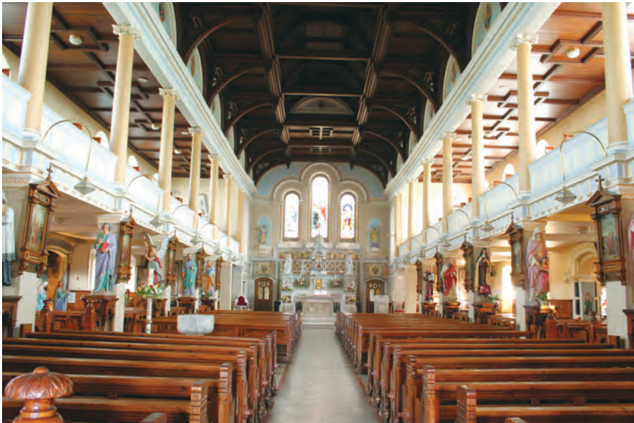
(fig. 163) ST JOHN THE BAPTIST CHURCH

Cashel's Catholic parish church was built on the site of the town's long-destroyed medieval Franciscan friary. The building, designed by John Roberts, was built in 1772-1804; its present frontage and tower were added by W.G. Doolin c. 1890. The notable ashlar limestone gate piers have carved friezes and domed caps.