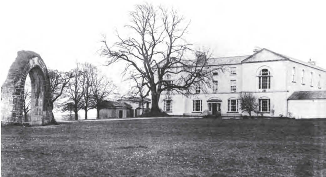
(fig. 131) ABBEY SCHOOL Abbey Street/ Railway Road, Tipperary (1820)