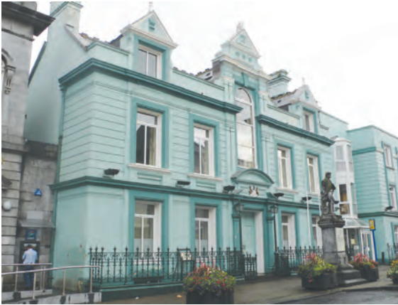
(fig. 136) CLONMEL TOWN HALL Parnell Street, Clonmel (1881)