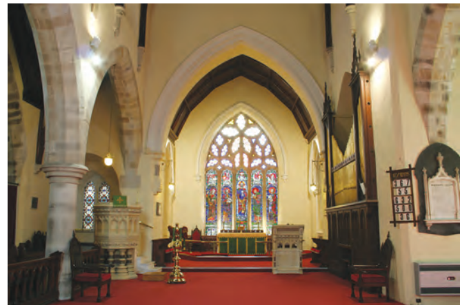
(fig. 54) ST MARY'S CHURCH OF IRELAND