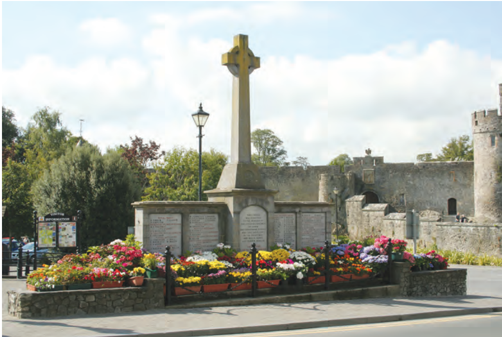
(fig. 180) WAR MEMORIAL Castle Street, Cahir (1930)

Cahir's First World War dead are commemorated in the fine and well-maintained monument prominently sited near the castle.