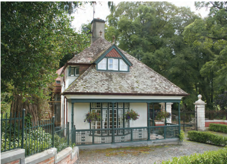
(fig. 176) BALLYBRADA HOUSE Ballybrada (c. 1880)

This unusual colonial-style house is highly visible at the south end of Dillon Bridge. Its veranda, small-paned timber casement windows and the delicate valences to its eaves also give the building something of an Arts and Crafts appearance. The builder was reputedly a former sea captain on the China routes.