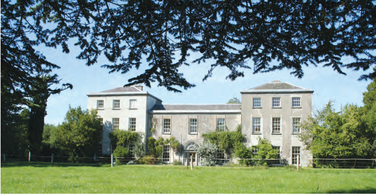
(fig. 82) NEWTOWNANNER HOUSE Newtownanner Demesne (1829)

The seat of the Osborne family at Newtownanner has an unusual plan, the middle bays being lower than the projecting ends. Its entrance door case displays a particularly elaborate fanlight. The house is set in extensive landscaped grounds with a lake, canal, recently restored temple, gardener's house, a very fine stable block and important specimen trees.