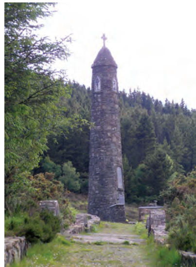
(fig. 181) LIAM LYNCH MEMORIAL Crohan (1935)

Detail of an inscribed panel listing soldiers who fell in the First World War.