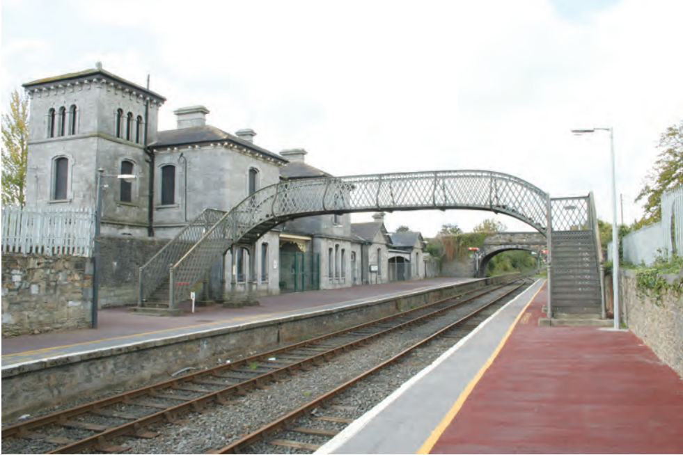
(fig. 67) CLONMEL RAILWAY STATION

A trackside view of the station, with its iron foot-bridge of 1886.