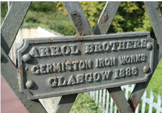
CLONMEL RAILWAY STATION

A trackside view of the station, with its iron foot-bridge of 1886.