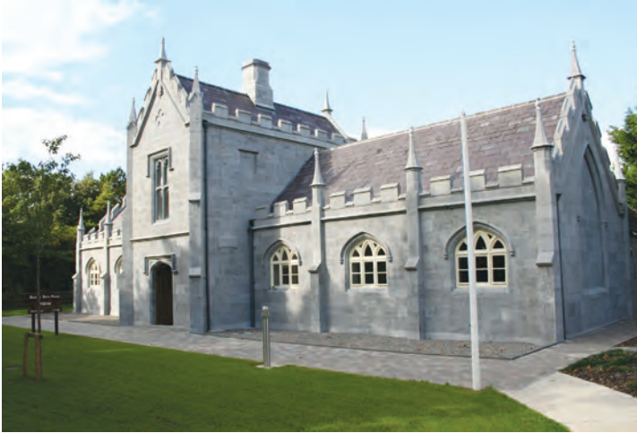
(fig. 129) ERASMUS SMITH BUILDING Church Street, Cahir (1818)

A schoolhouse designed by the noted architect John Nash, this building forms part of a setting with the nearby St Paul's Church of Ireland church. It has similar detailing, especially evident in the pinnacles, and the castellations and turrets echo the architecture of Cahir Castle. It was envisaged as a multi-denominational establishment. It is now used as local authority offices.