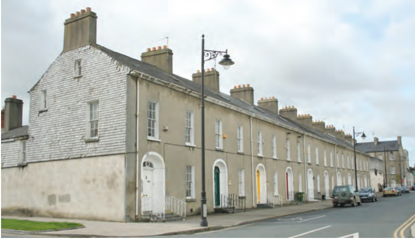
(fig. 120) 1-10 DOCTOR CROKE PLACE Clonmel (1842)