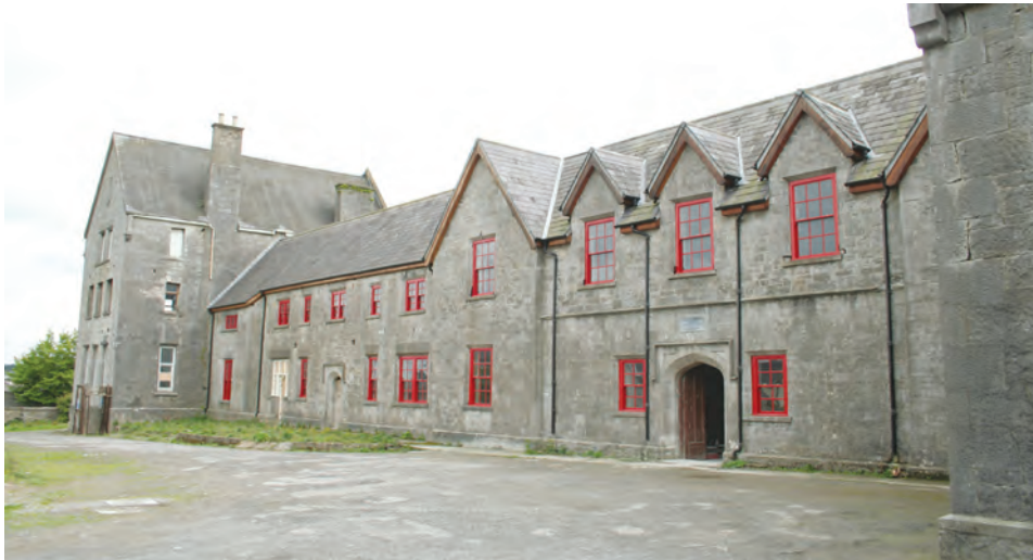
( fig. 147 ) TIPPERARY WORKHOUSE Station Road, Tipperary (1841)

Many of the rural Protestant churches of the late eighteenth and early nineteenth century were constructed on earlier ecclesiastical sites. The church at Marlfield in First Fruits style, designed by Thomas Tinsley and built in 1818,