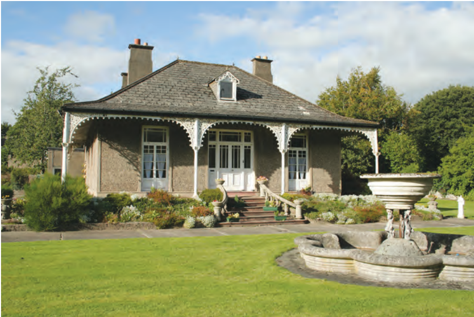
(fig. 185) ST MICHAEL'S ROAD/MURGASTY Tipperary (c. 1900)

The veranda of this colonial-style bungalow in Tipperary is formed by fluted cast-iron columns supporting an ornate cast-iron valence.