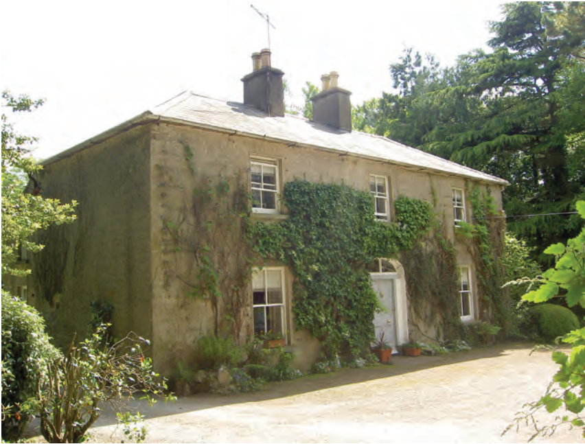
(fig. 177) BALLYCREHANE HOUSE Ballycrehane (c. 1860)

The two-over-two pane sliding sash windows of this house at Lisvarrinane are typical of the second half of the nineteenth century. A high degree of symmetry is achieved by the three-bay plan and the centrally-placed chimneystacks.