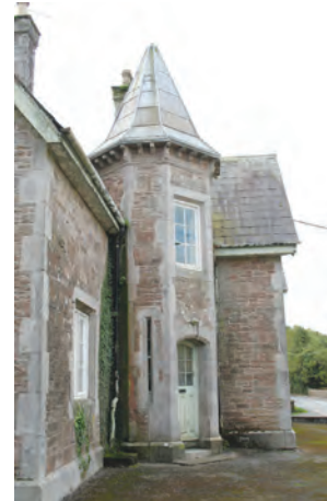
DUNDRUM GARDA STATION

Tudor Revival style and detailing are evident in this distinctive former RIC barracks. It was built under the influence of the Hawardens of Dundrum House, as part of what has been described as a 'carefully contrived alien cell with its inn, courthouse, Anglican church, corn mill and constabulary barracks'.