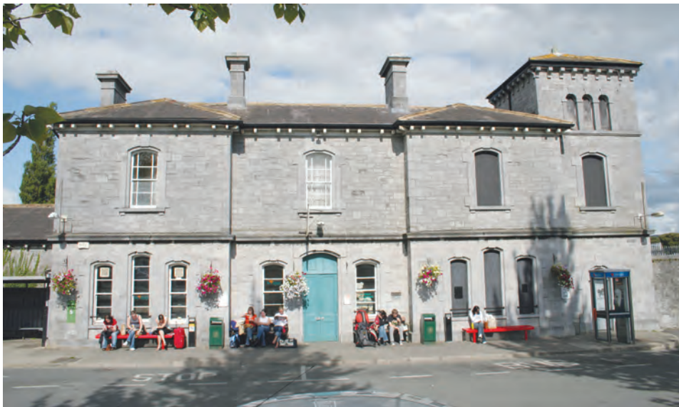
(fig. 66) CLONMEL RAILWAY STATION Thomas Street, Clonmel (1852)

The railway also had an important symbolic value, which was reflected in the quality of the associated engineering and architectural works. Stations and staff housing, bridges and signal cabins, workers' cottages, water-towers and goods sheds were all constructed to high standards. Crisply detailed cut stone, elaborate timber bargeboards and decorative cast-iron elements typified the buildings along the lines. The station at Clonmel ( figs. 66-7 ) was designed in 1852, probably by J.S. Mulvany, builder of Broadstone Station in Dublin. Other stations at Tipperary, Dundrum, Fethard, Goold's Cross and