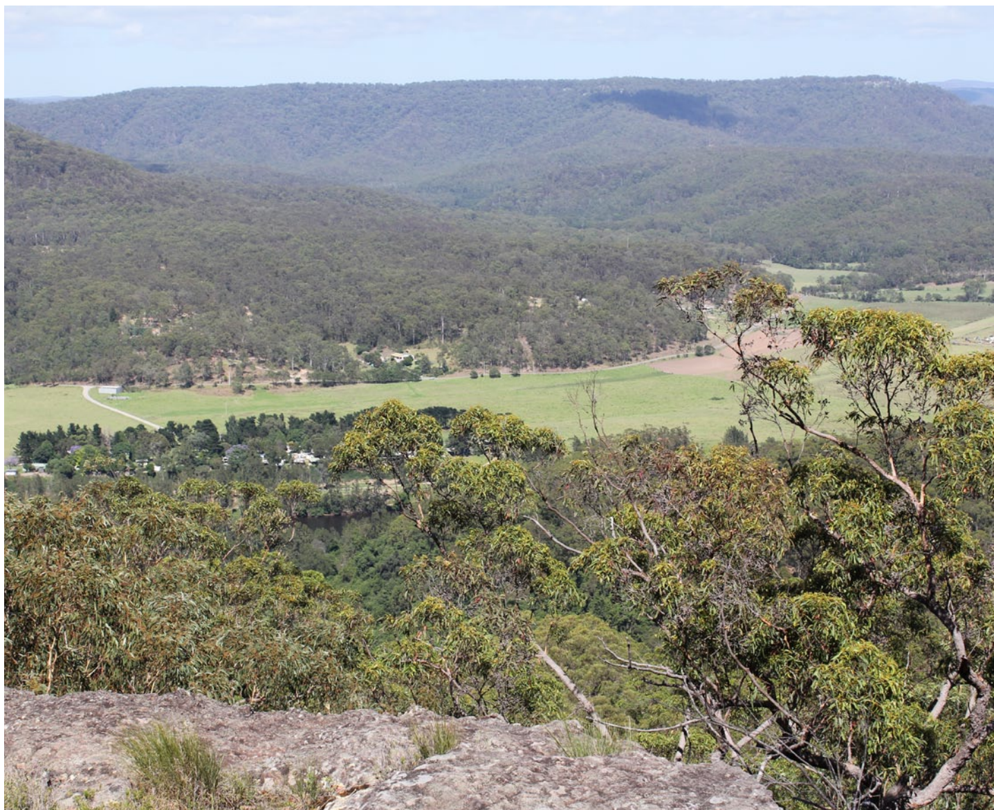
image: View from West escarpment, Eearie Park 2