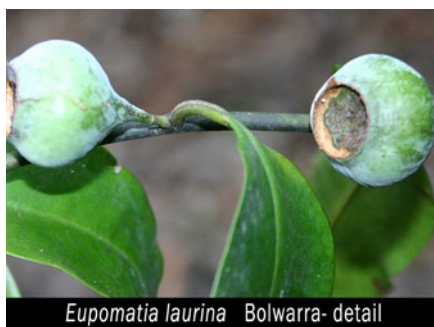
Eupomatia laurina Bolwarra- detail