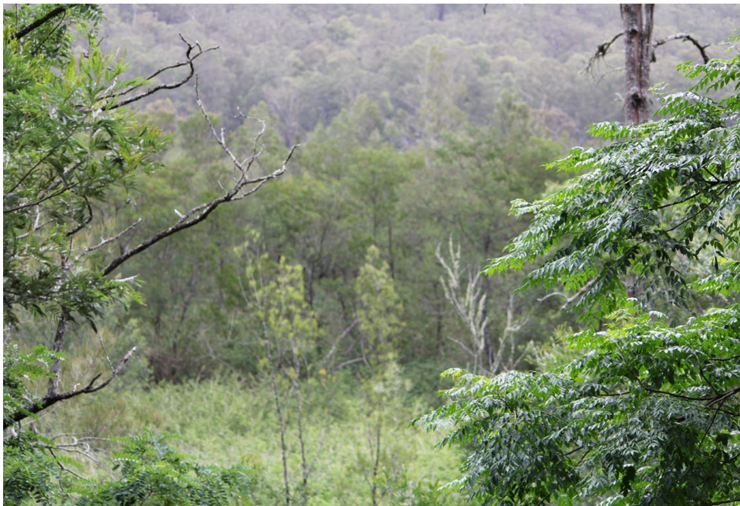
Image: View across to the island from Bundanon Road