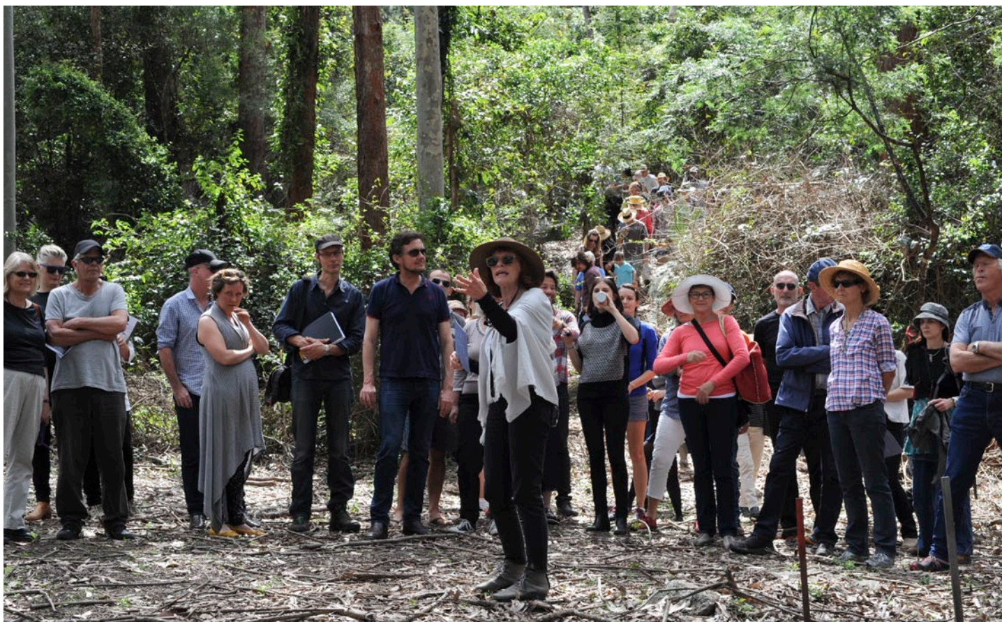
Image: Artist Janet Laurence leads participants in Siteworks 2014 on a walk of Tree Lines Track , a passage of trees, planted in the style of a linear arboretum. This three kilometer walking track connects the natural bushland to the Homestead garden and new regeneration zone at Bundanon.

Over twenty-five years, Janet Laurence's practice has extended to painting, sculpture, installation, photography, architectural and landscape interventions. The major themes that have emerged in the work include: the relationship between the museum, the natural world, and notions of preservation; the exploration of hybrid landscapes that involve a fusion of natural and urban elements; alchemy and the transformation of elements from one state to another.