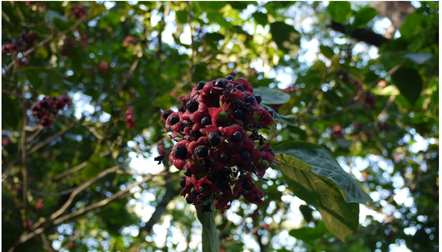
Clerodendrum tomentosum in fruit along Bundanon Road

This vegetation community is a tall eucalypt forest characterised by an open eucalypt canopy, a dense small tree sub-canopy and a moist shrubby understorey. Warm Temperate Layered Forest occurs predominantly south from the Hacking River along the Illawarra scarp, to Nowra and throughout the Kangaroo Valley. Within this area it is found below 400m on sheltered slopes in gullies and on escarpments with loamy soils where mean annual rainfall exceeds 1000mm. Warm Temperate Layered Forest frequently adjoins Subtropical and Warm Temperate rainforest map units, and contains several rainforest taxa below its eucalypt canopy.