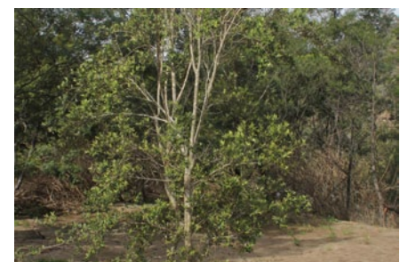
Backhousia myrtifolia Grey Myrtle