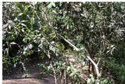
Notelaea longifolia Large Mock-Olive