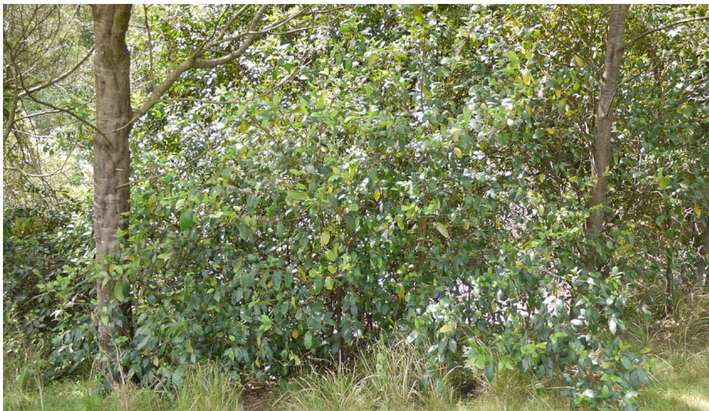
Image: Ficus coronata at Riversdale Creek