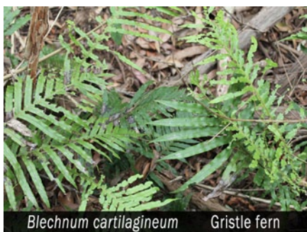
Blechnum cartilagineum Gristle fern

Distribution Pattern on the Bundanon Property as mapped by NVSNSW: Below southern facing ridge of western valley.