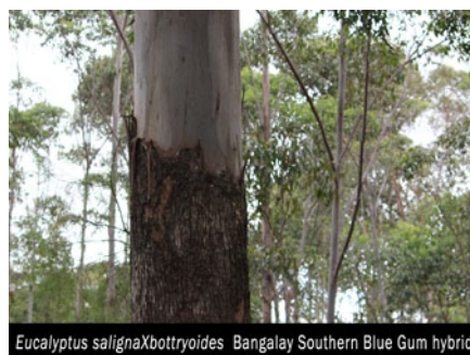
Eucalyptus saligna X botryoides Bangalay Southern Blue Gum hybrid