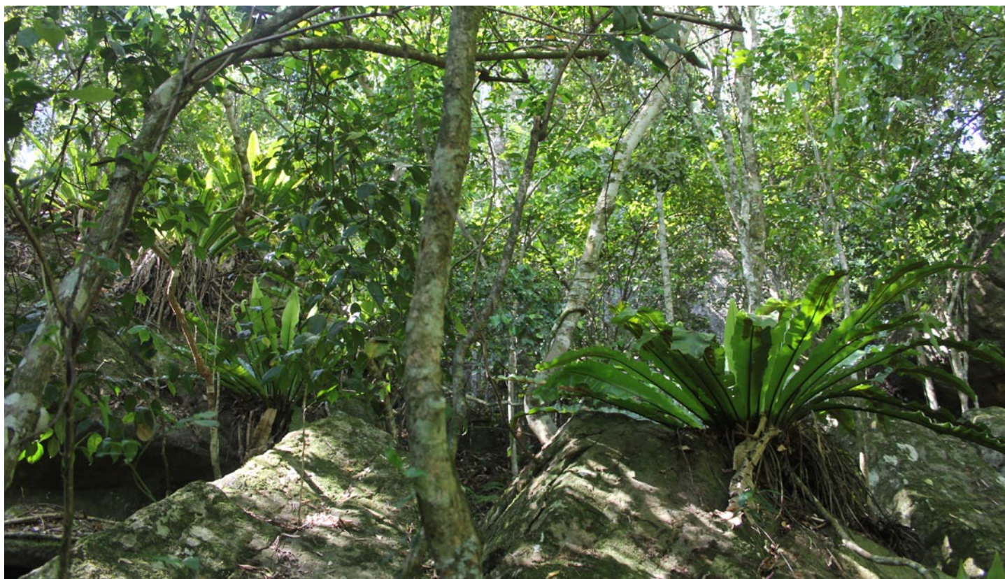
Image: Birds Nest Ferns Bundanon, off Cedar Walk