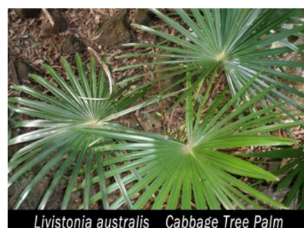
Livistona australis Cabbage Tree Palm