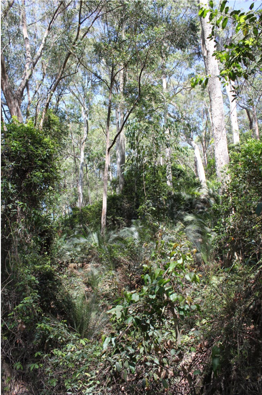
image: Southern Lowland Wet Forest view