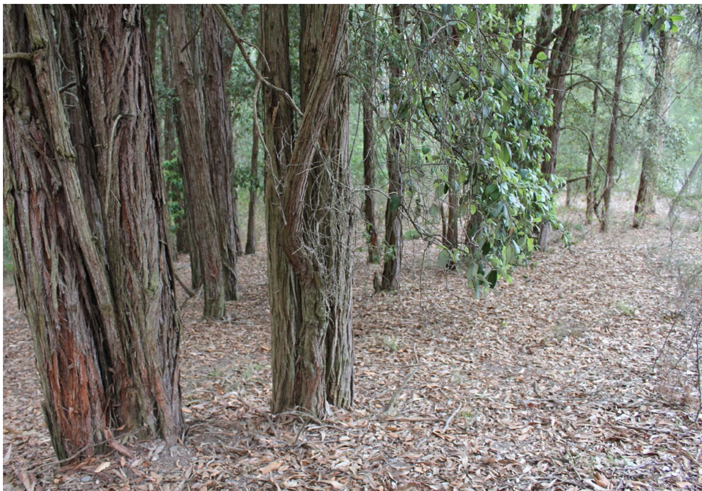
Image Southern Turpentine Forest