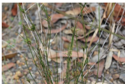
Entolasia stricta Wiry panic