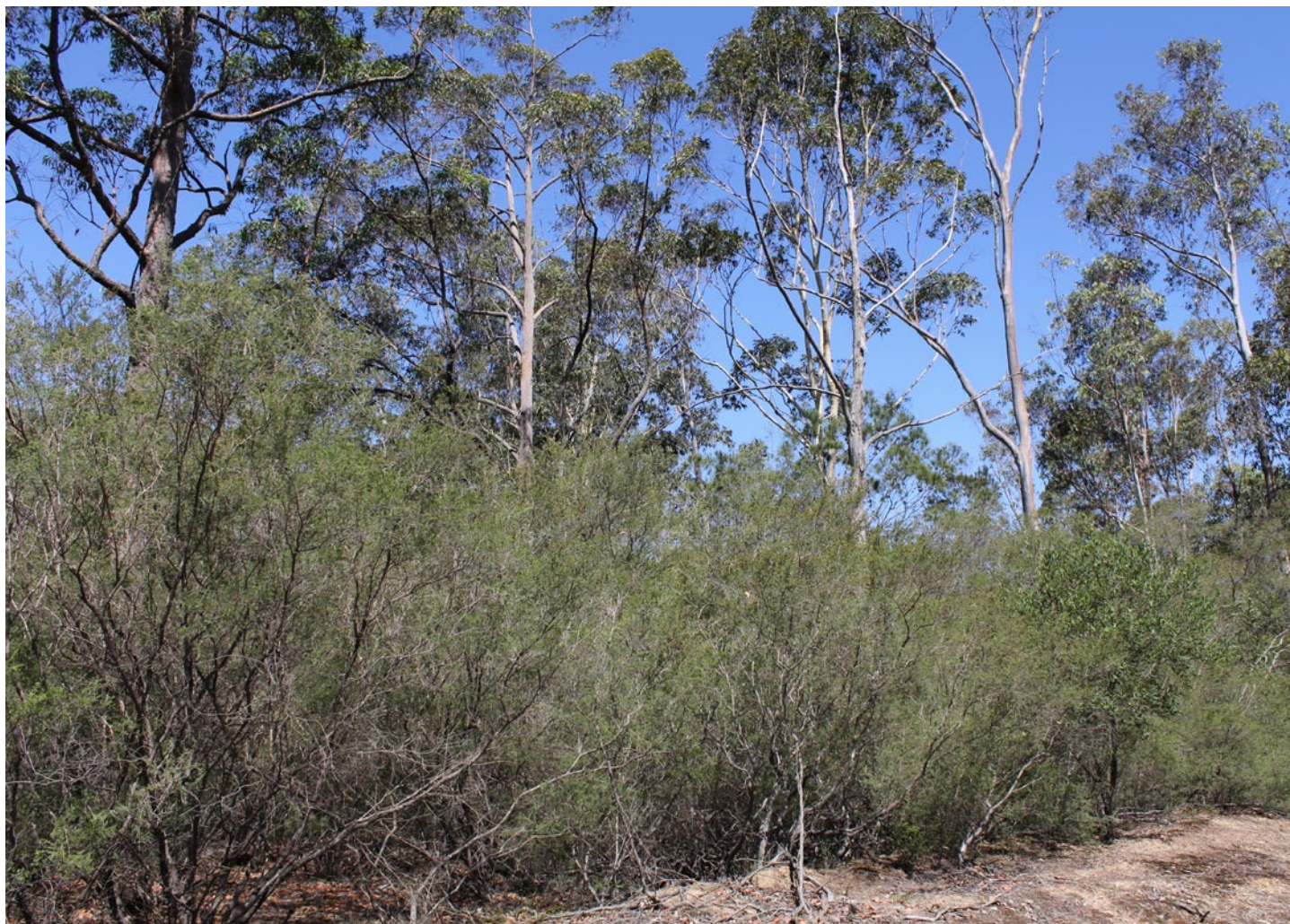
Image: Earrie Park Morton Mallee Heath