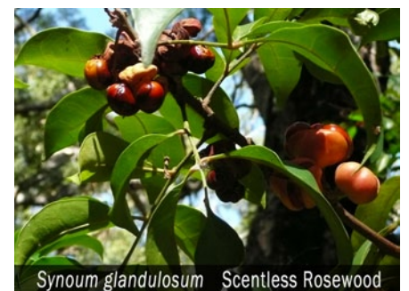
Synoum glandulosum Scentless Rosewood