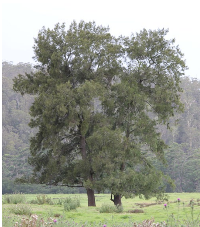
River Oaks, Bundanon

Distribution Pattern on the Bundanon Property as mapped by NVSNSW: At water's edge, particularly along Earle Park and The Island.