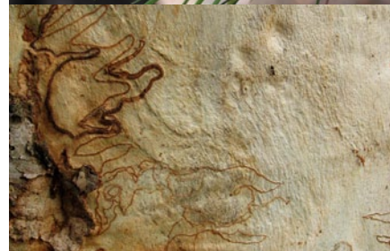
Images: Narrow Leafed Geebung, Scribbly Gum details