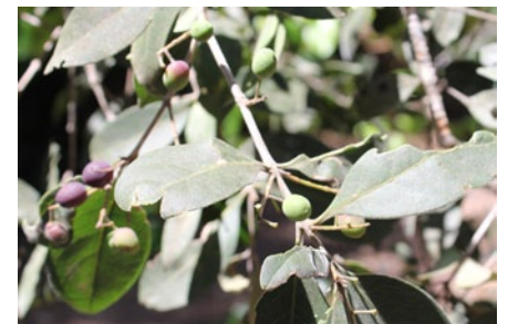
Notelaea longifolia Large Mock-Olive