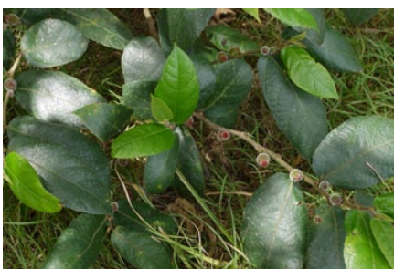
Ficus coronata Sandpaper fig

Distribution Pattern on the Bundanon Property as mapped by NVNSW: At the mouth of the western valley.