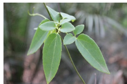
Clematis Aristata Travellers joy