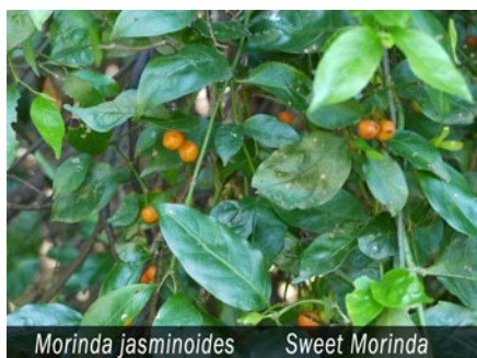
Morinda jasminoides Sweet Morinda

Distribution Pattern on the Bundanon Property as mapped by NVSNSW: Between mouth of western valley and bottom of valley slopes.