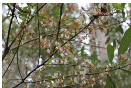
Elaeocarpus kirtinii Pigeonberry ash

Distribution Pattern on the Bundanon Property as mapped by NVNSW: Mainly surrounding the Bundanon property and on slopes downstream on east of study area.