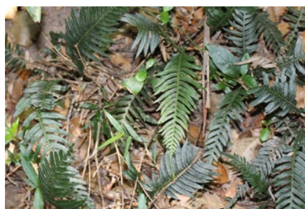
Doodia aspera Prickly Rasp Fern