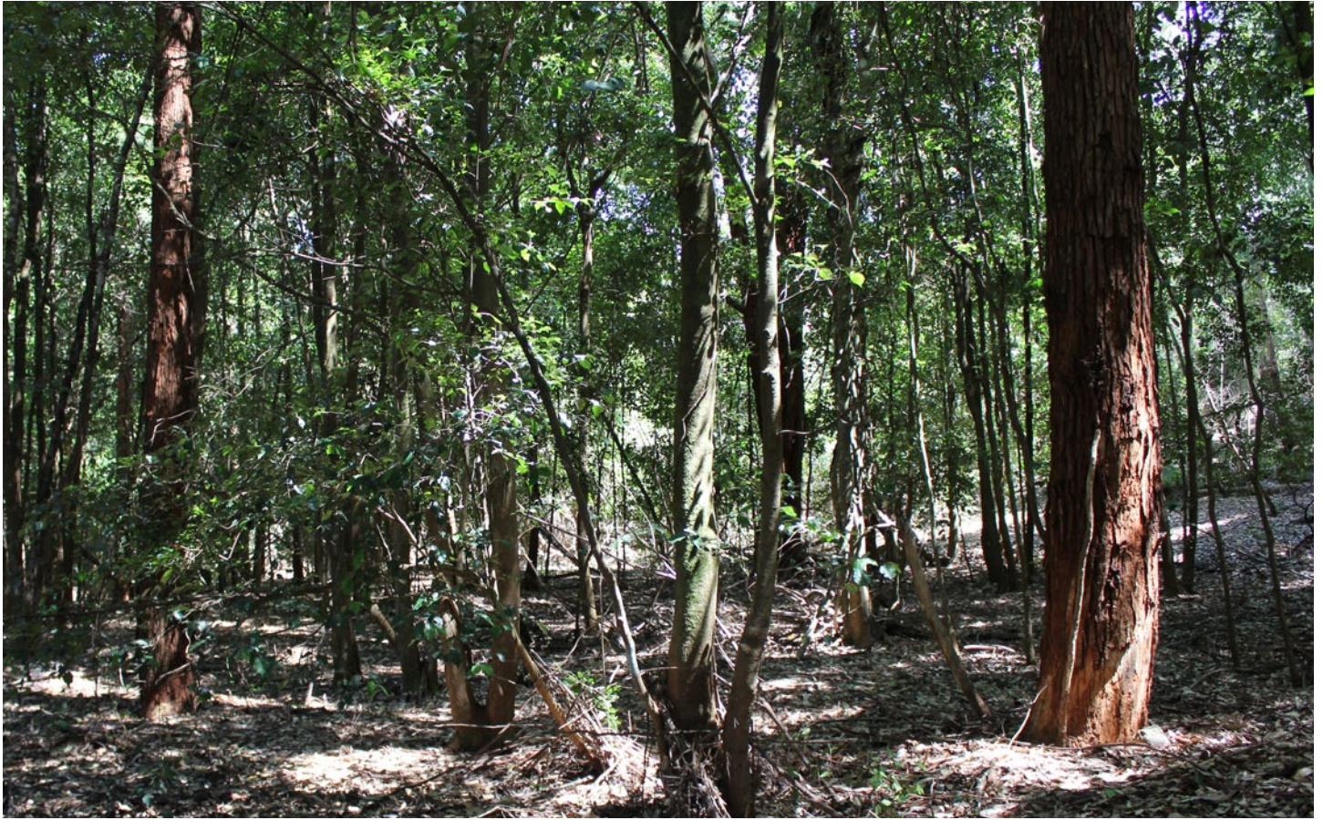
Image: Lilly Pilly Gully View