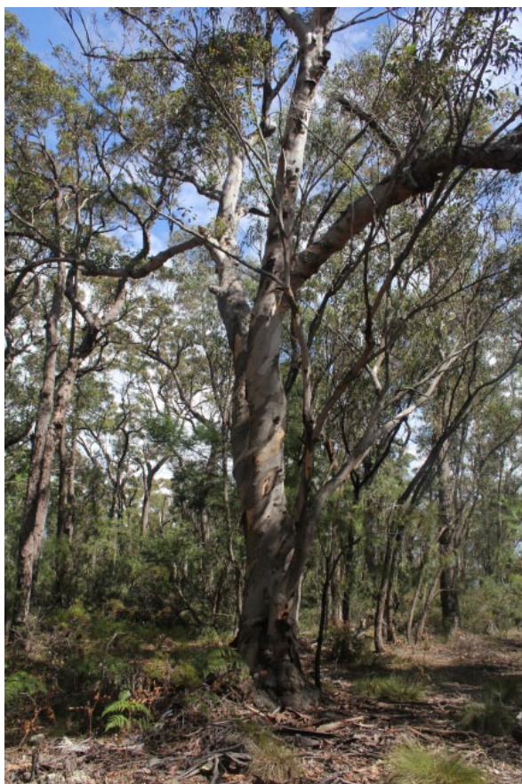
Images Above, Eucalyptus punctata , below, Patersonia sericea