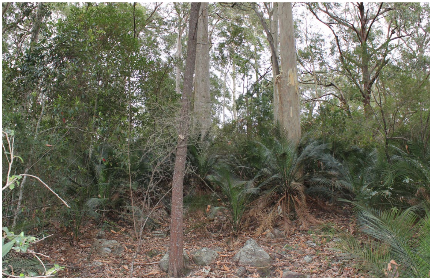
Image: Currambene-Batemans Lowlands Forest View