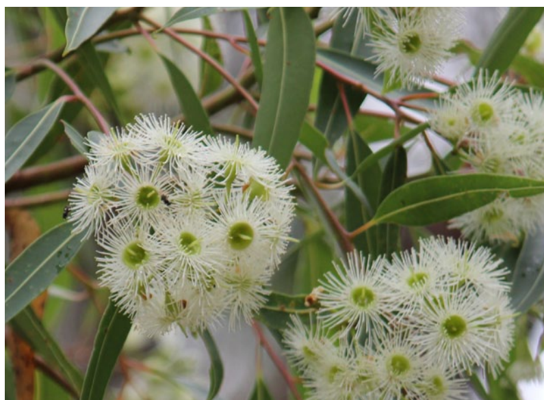
Images: Right, Corymbia gummifera Blossom details; Below, details of Macrozamia communis , Burrawang

Distribution Pattern on the Bundanon Property as mapped by NVSN-SW: Mainly on slopes on west of property.