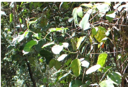
Tylophora barbata Bearded Tylophora

Distribution Pattern on the Bundanon Property as mapped by NVSNSW: At the base of cliffs in western valley.