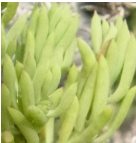
The leaves are fleshy, long cylindrical with a pointed tip.