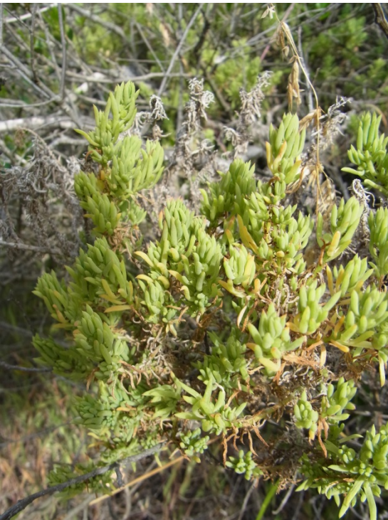
Threlkeldia diffusa is a spreading shrub.

A plant common on the fore dunes at Peppy Beach is Threlkeldia diffusa commonly called Coast Bone Fruit (see also Threlkeldia diffusa ). It is common in near coastal areas, especially in winter-wet depressions. It is recorded from Broome in the north to the South Australian border in the east and also occurs in South Australia, Victoria and Tasmania. Threlkeldia is named after an English botanist Caleb Threlkeld (1676-1728) and diffusa from the Latin diffusus meaning loosely or widely spreading in reference to the growth habit of this species. Threlkeldia diffusa is a much branched spreading shrub up to 30cm high, flowering is recorded from most months. The fleshy, narrowly cylindrical leaves are up to 3cm long and 2mm wide, scattered and without a stalk but with a pointed tip. The solitary flowers are green, and occur in the leaf axils. The calyx is 3-lobed with a fleshy tube up to 2mm long with membranous lobes up to 0.5mm long. There are no petals. The fruiting calyx is urn shaped, up to 3mm long with a shallow, 3-lobed cup at the top, woody with a thin black fleshy outer layer.