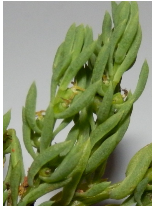
The flowers are solitary in the leaf axils, green in colour but without any petals.