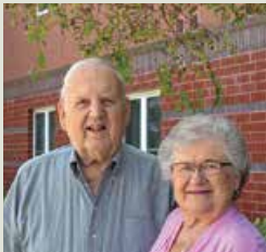
A Dream Becomes a Reality