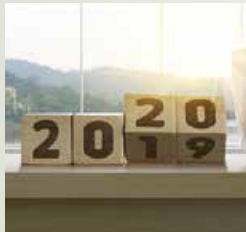
New Year Refined Focus!