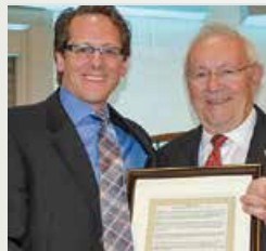
Saying Thank You through the Century Fellowship