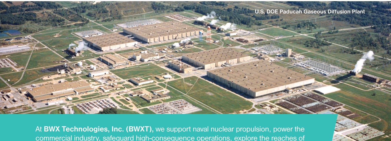
U.S. DOE Paducah Gaseous Diffusion Plant

At BWXT Technologies, Inc. (BWXT) , we support naval nuclear propulsion, power the commercial industry, safeguard high-consequence operations, explore the reaches of space and develop life-saving technologies. We are People Strong, Innovation Driven.