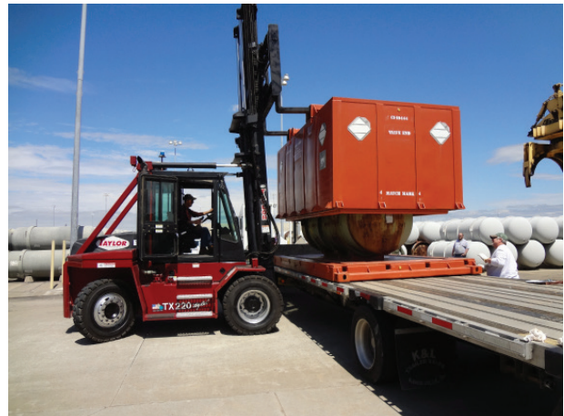
BWXT previously served as the project operating contractor for the depleted uranium hexafluoride (DUF6) project at the Paducah Gaseous Diffusion Plant