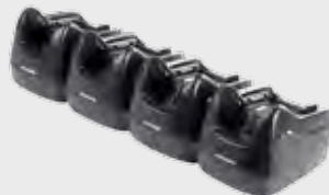
• 94A150037 4-Slot Charging Dock • 94A150038 4-Slot Ethernet Dock