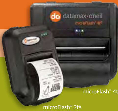
microFlash® 4t e