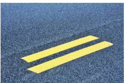
The Sometimes Subtle Difference Between 'Conflate' and 'Equate'

A word that has added meanings for centuries