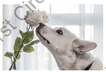
What's that Smell?! Quiz