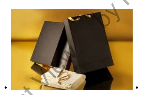
The Word History of 'Swag'

A word that has added meanings for centuries