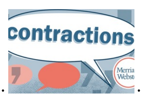
On Contractions of Multiple Words

You all would not have guessed some of these