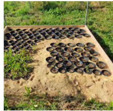
Convolvulus arvensis plants from different years and origins (Europe and North America) grown in the CABI garden

Since the species is hard to collect in the field, we tried to establish a rearing colony in 2019 and 2020, by transferring eggs onto specially prepared field bindweed plants under common garden conditions. In 2021, adults started to emerge mid-July and are expected to continue emerging in August. Females will be mated and resulting eggs will be used to continue egg transfer tests.