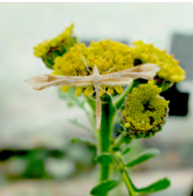
Male of Platyptilia ochrodactyla on a flower head of Tanacetum huronense