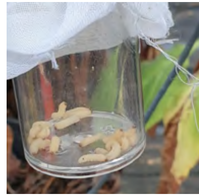
Mature larvae of Mogulones borraginis leaving the fruits of houndstongue and being trapped in a vial for collection