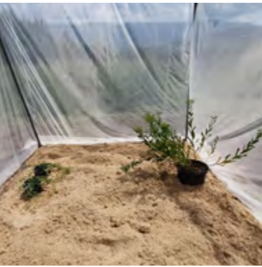
Single-choice cage test where Lepidium integrifolium (left) and the control, Lepidium draba (right) were exposed to C. turbatus