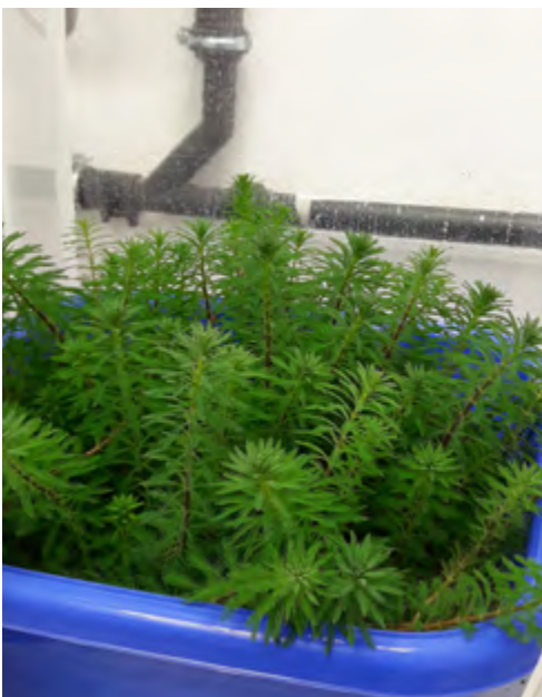
Parrot's feather, Myriophyllum aquaticum , in the CABI quarantine awaiting the arrival of Lysathia sp. from South Africa