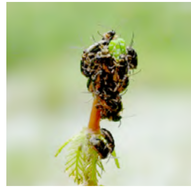
Adult leaf beetles ( Lysathia sp.) attacking the emergent shoots of parrot's feather

Despite much of BC being extremely cold, the region around Vancouver, Vancouver Island and Fraser's Valley has a relatively warm climate influenced by the ocean. This may work to our advantage and allow biological control agents to establish and control parrot's feather. Currently there are two potential agents which originate from Argentina at our disposal, the defoliating chrysomelid beetle Lysathia sp. and the stem-mining weevil Listronotus marginicollis . We plan to import Lysathia sp. from the mass rearing facility, run by the Centre of Biological Control (CBC), Rhodes University in South Africa to CABI Switzerland in the next few weeks and initiate host range testing as well as thermal physiology studies. Currently we have been working on boosting our cultures of parrot's feather in anticipation of the insects to arrive. In addition to this we are sourcing and propagating various test plant species that are considered critical to be tested with these agents in a Canadian context.