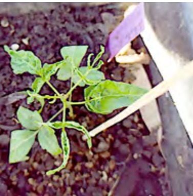
Inoculation of Aculus mosoniensis on a seedling (top) and symptoms observed 24 days after the inoculation (bottom)