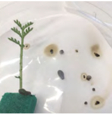
Larvae of Chrysolina eurina provided with a leaf of Tanacetum huronense in a Petri dish

On 27 and 28 May, we collected about 1,000 shoots infested with P. ochrodactyla in western Germany. The emerging females were released in an open-field test with flowering plants of T. camphoratum , T. huronense , T. parthenium and T. corymbosum . The flower heads of test and control plants will be dissected for larvae about two months after the exposure to P. ochrodactyla .