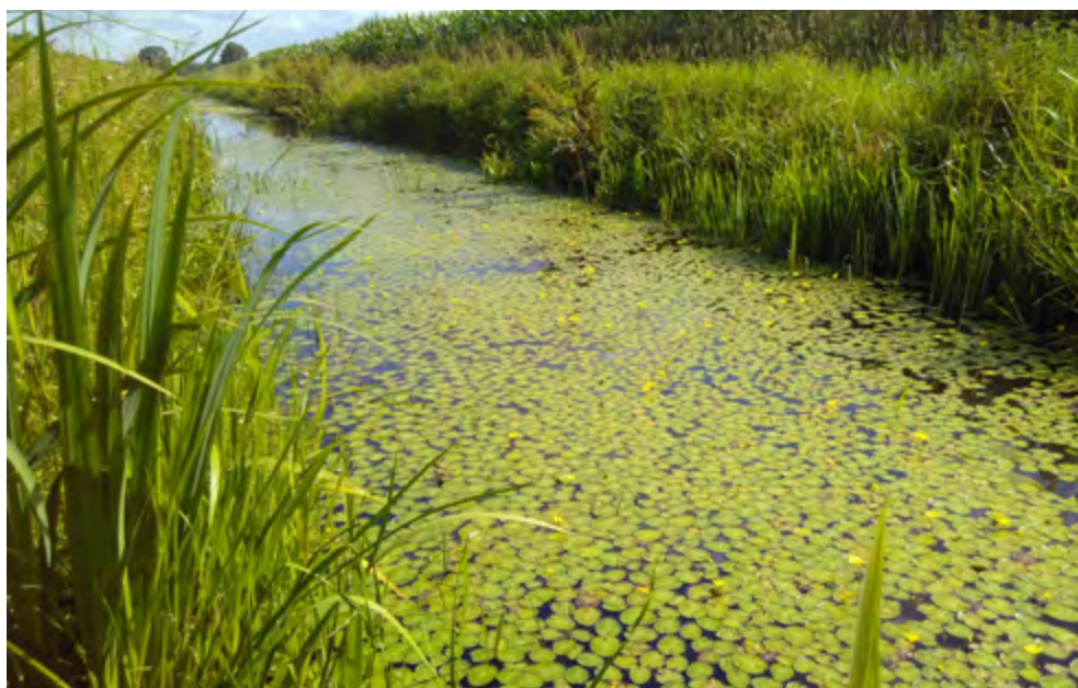
Nymphoides peltata growing in a channel in the Netherlands

From July to September we plan to conduct several field trips in Europe (i.e. Switzerland, the Netherlands, Romania) to look for the pathogen U. nymphoidis and to collect leaves for molecular and chemical analyses. Furthermore, we will collect additional data on the N. peltata populations in Europe (e.g. plant density) for comparison with Asian and North American populations.