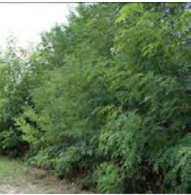
Robinia pseudoacacia infestation along the Rhine river in southern Germany

Due to the cool and very wet spring and summer season in 2021, population levels of the known insects associated with black locust have been extremely low and thus far no collections for shipments to South Africa have been possible. During surveys however, leaf rippling and curling was noticed which is unlike what is caused by the known insects. Upon inspection, an eriophyid mite was discovered. We have setup a rearing of this mite in order to obtain information on the biology and impact and to obtain an identification.