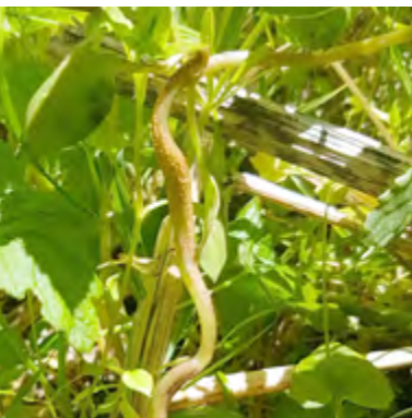
A Himalayan balsam seedling infected with the rust Puccinia komarovii var. glanduliferae in the field