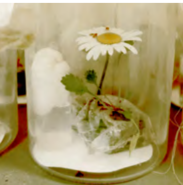
Set-up used to check Oxyina nebulosa females for egg-laying before using them in tests