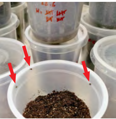
C. constrictus emerging from overwintering containers

Between April and July, adult C. scrobicollis emerged from rearing plants infested with field collected adults in October 2020. So far about 140 adults emerged and units of two females and one male are kept on potted rosettes for aestivation. Weevils will either be shipped to AAFC for additional field releases in autumn and/or kept at CABI for rearing.