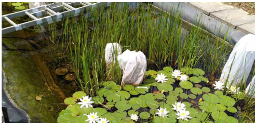
Artificial pond for maintaining test plants, flowering rush and a rearing of Bagous nodulosus in Switzerland

In addition, herbarium samples of B. umbellatus from a large geographical range in Europe and Asia were sourced from the Royal Botanic Garden Edinburgh and sent to John Gaskin for further analyses (for details see annual report 2020). Unfortunately, the DNA was too degraded to obtain good AFLP data. Results nevertheless suggest that samples are unlikely to match with any of the six invasive genotypes.