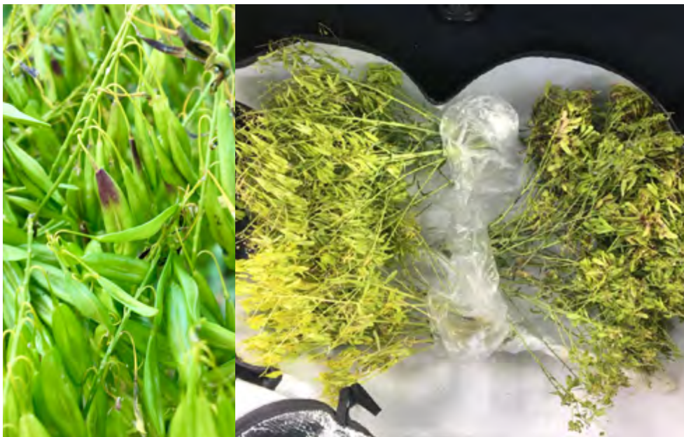
The seed pods collected in the Abruzzo mountains, Italy where Ceutorhynchus peyerimhoffi occurs naturally to study the parasitoids associated with the weevil