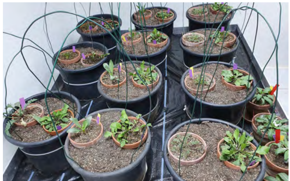
Plants prepared for single-choice tests with Ceutorhynchus marginellus . Pots were afterwards covered with gauze bags and two females were released per pot

We also continued to maintain a rearing colony of C. marginellus . From the 700 adults that were kept in incubators set at 2–3°C during winter 2020/2021, 250 females and 200 males survived until March 2021. These weevils were transferred onto potted perennial pepperweed plants to continue our rearing. More than 1,000 weevils emerged from these plants. They are currently being kept in plastic cylinders and regularly fed with leaves of perennial pepperweed or were placed onto potted perennial pepperweed plants.