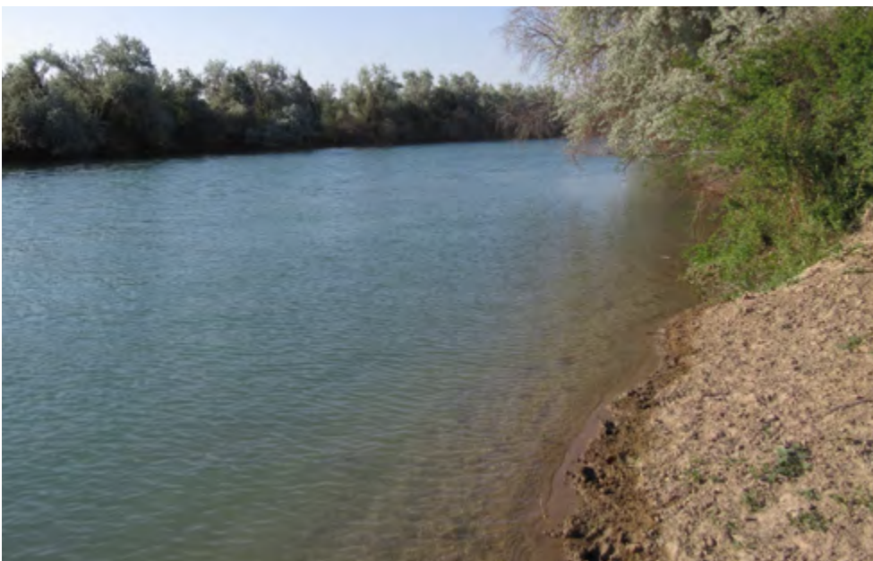
Typical Russian olive habitat along rivers and water bodies in Kazakhstan