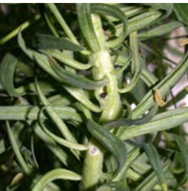
Yellow toadflax plant infested with Mecinus heydenii

In mid August, a collection trip for M. peterharrisi is planned to the Pelagonian plateau in North Macedonia to re-establish the rearing colony.