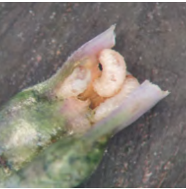
Larvae of Ceutorhynchus marginellus in a gall on Lepidium latifolium