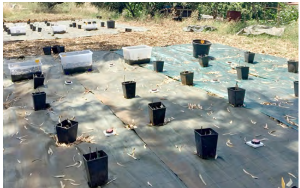
Setup to evaluate the impact of the mite Aculus mosoniensis on tree of heaven at BBCA in Rome