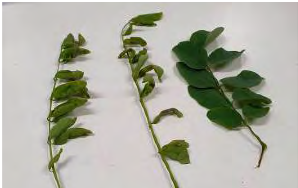
Robinia pseudoacacia leaf rippling and curling (damaged leaves left and middle, undamaged leaf right) caused by the presence of an unknown eriophyid mite