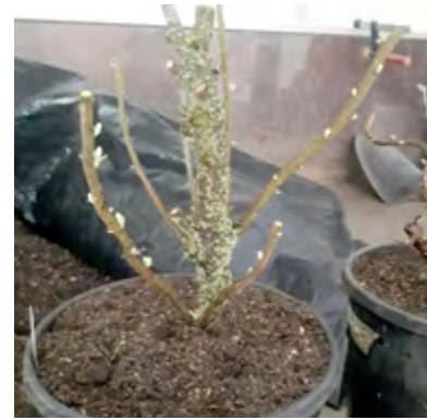
Russian olive trees with newly developing buds ready for the inoculation of mites

Unfortunately, due to COVID-19 travel restrictions, all field surveys for additional agents had to be put on hold.