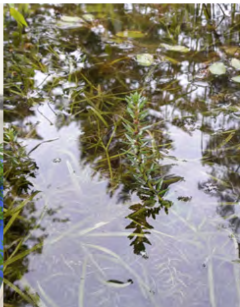
Myriophyllum heterophyllum collected in Europe for host range testing of Lysathia sp.