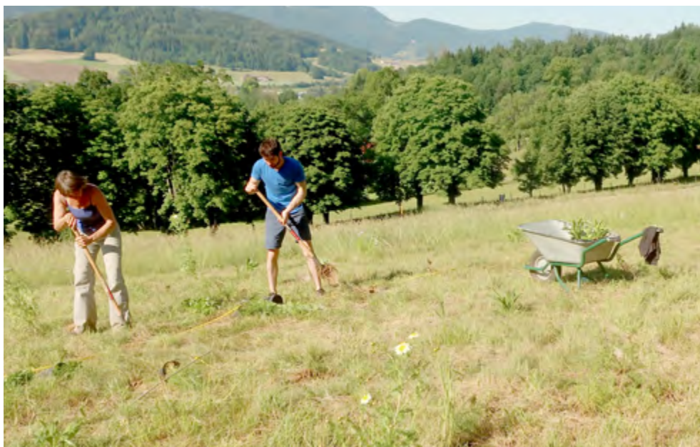
Our garden technicians, Florence Willemin and Quentin Donzé, preparing the open-field test with Cyphocleonus trisulcatus

In May and June, we set up no-choice oviposition and larval development tests with this root-mining weevil exposing 11 non-target plant species that are either native or of horticultural value in Australia. No larvae were found in any new test species. In addition, in mid-June, we set up an open-field test with seven non-target species and cultivars that supported larval development under no-choice conditions. These plants are currently being dissected for larvae.