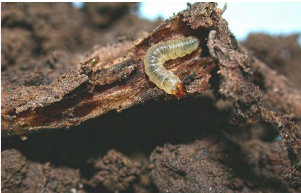
Microsphecia brosiiformis larva mining in Convolvulus arvensis root