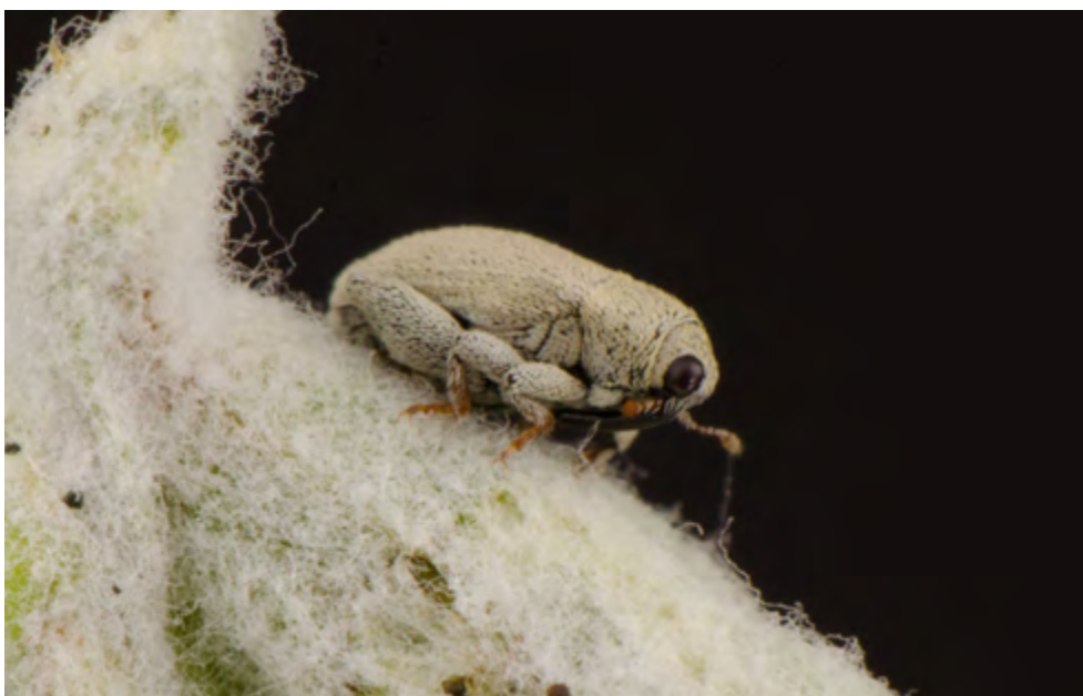
Adult female Pseudorchestes sericeus from the quarantine culture maintained at CABI.

The larval mining commonly seen on Russian knapweed leaves (above) compared to those commonly seen on non-target plants, in this case artichoke (below)