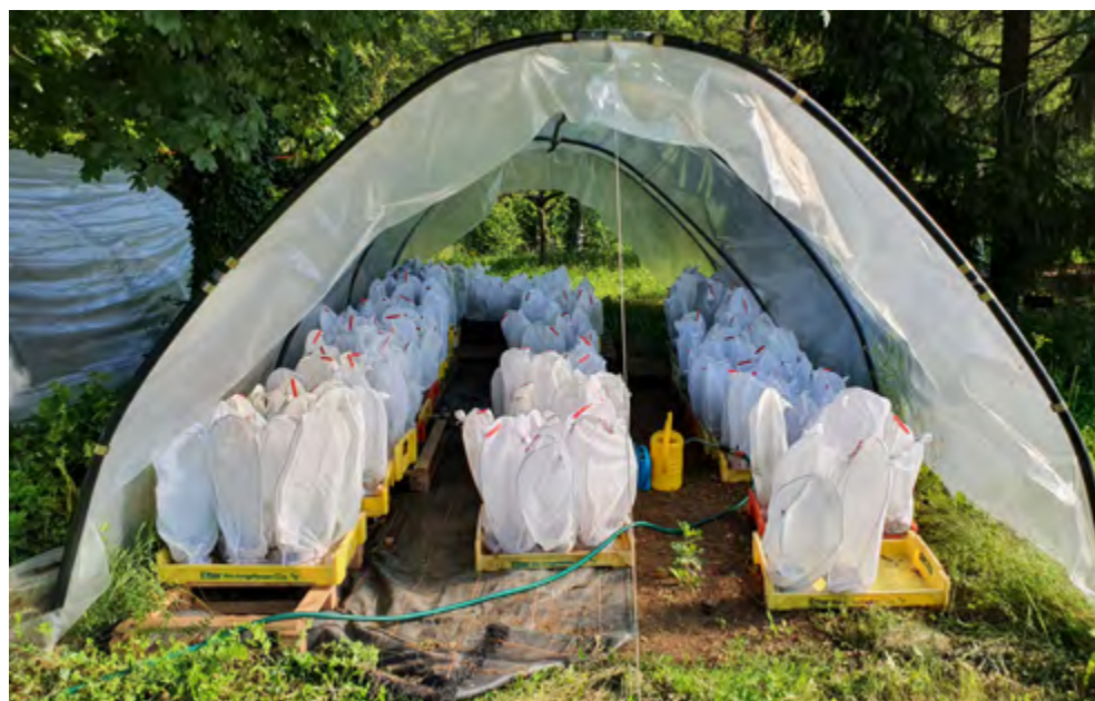
No-choice tests established with both biotypes of Aulacidea pilosellae at CABI

In 2021, the sun appeared only on very rare days during the usual flying period of the syrphid C. urbana . The first individual was observed in the CABI garden on 22 April. Females were collected between 27 April and 9 May, and kept in an incubator at about 10-15°C until they were shipped to Dr Littlefield, Montana State University. Eggs were collected from the storage containers on 12 May (N=30) and 16 May (N=170) and placed in two small vials with a piece of paper towel to keep them in place. The eggs and 9 females were sent to Montana on 18 May. There were delays during the transport and unfortunately the females died without laying new eggs. A few larvae hatched from the eggs collected prior to the shipment, but died before arrival and no larvae hatched from the remaining eggs.