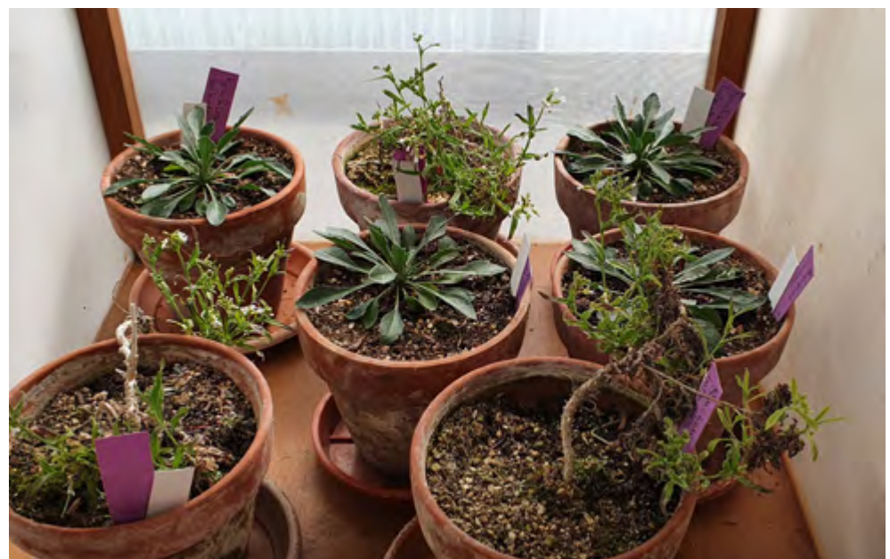
Cage exposing Boechera holboellii to Ceutorhynchus constrictus for an oogenesis study