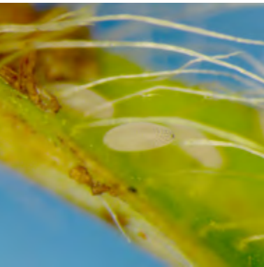
Egg of Cheilisia urbana on Pilosella officinarum