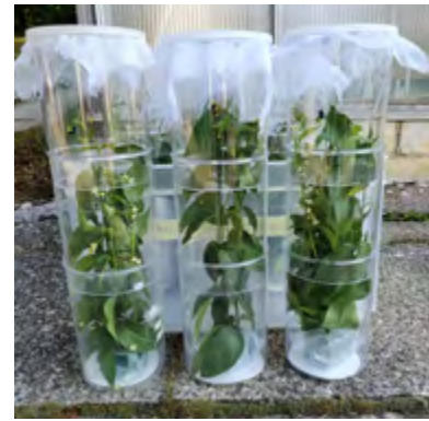
Storage of adult Chrysochus asclepiadeus for egg harvest

Due to very limited funding, it was decided to discontinue any work on this seed-feeding fly for the time being.