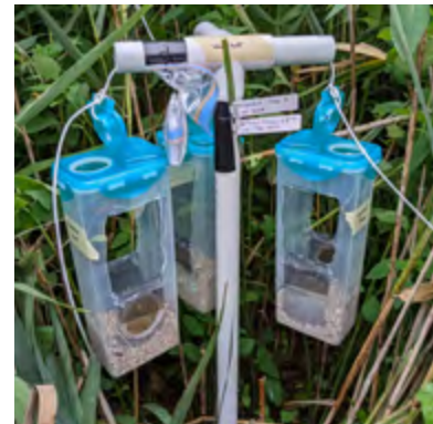
Setup for release of moth pupae at a field site in Canada