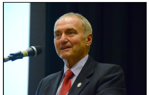
Senator Joseph Day