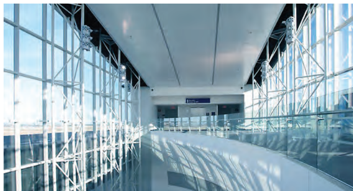
↑ International flights arrive at DFW's newest terminal.

Academy orientation – An orientation session for all participants is scheduled for Sunday afternoon, May 19, 2013 at 4:00 p.m. at the Center for American and International Law. It is important to attend the orientation. A reception here at the Center will follow, giving you a chance to meet