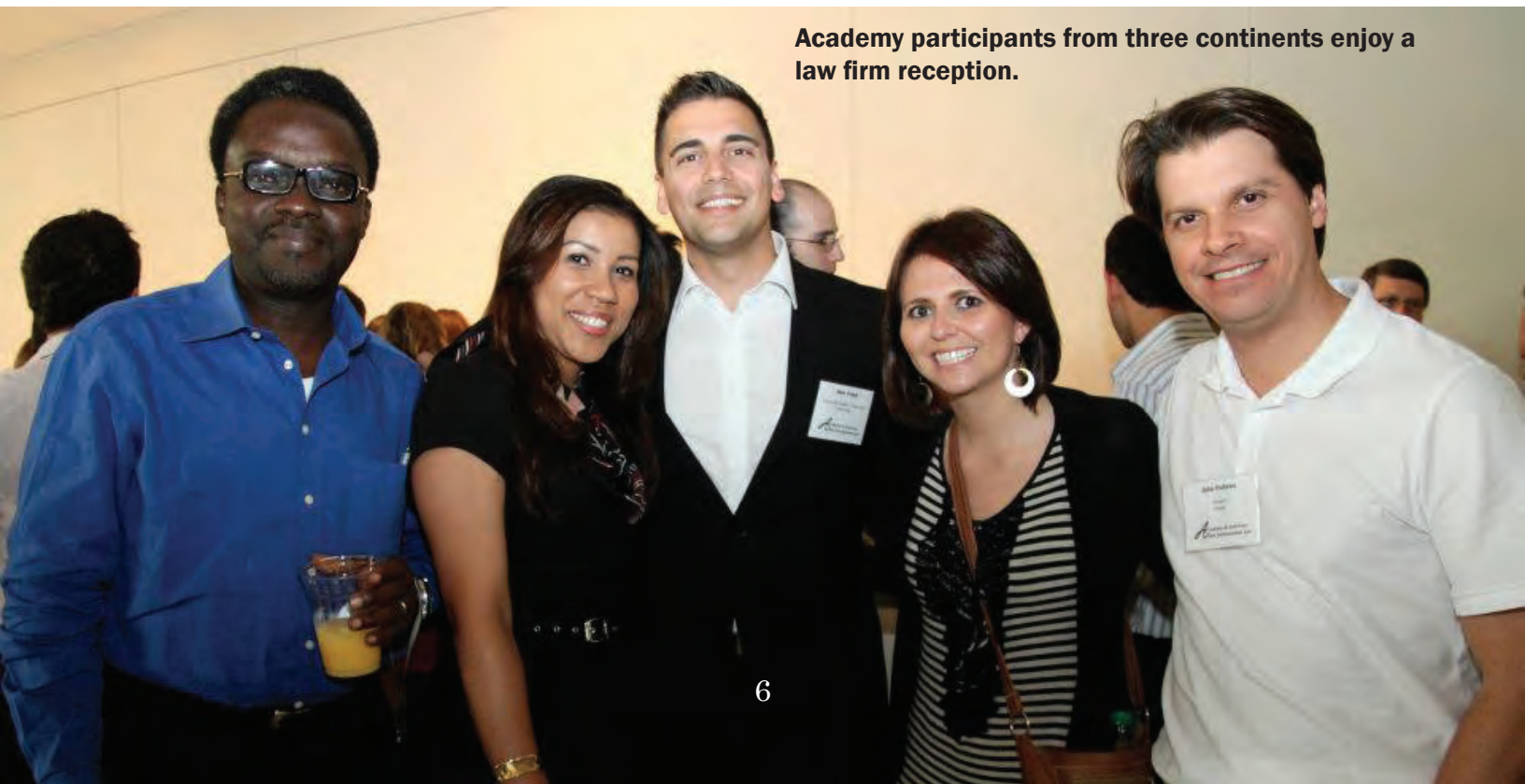
Academy participants from three continents enjoy a law firm reception.

Incidental expenses – In addition, you will have some incidental expenses, including the cost of most meals, doing laundry and dry cleaning, purchase of personal items, and entertainment. On each class day, the cost of lunch is included as a part of your tuition, but you will have to pay for groceries, meals on the weekends, and any purchases you make during the many extra-curricular activities (e.g., refreshments, souvenirs, non-Academy transportation, eating out with other participants, tips, etc.). For the activities in which everyone is expected to participate, the Academy will pay your admission and provide your transportation without charge.