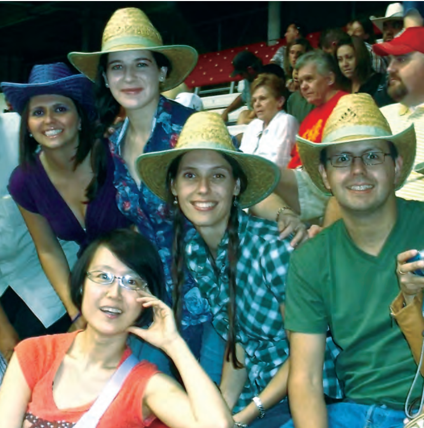
↓ Attending a real, Texas rodeo, with cowboy hats and all.