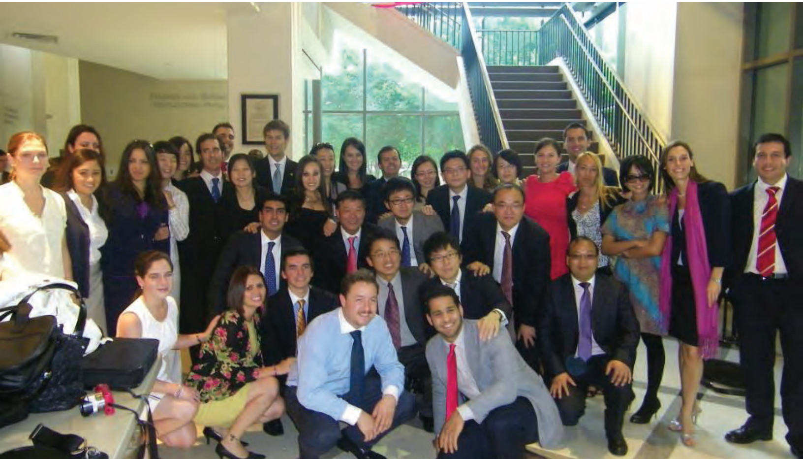
The 49th Academy (2012) gathers for a farewell photo on their last day together.

Please note that the Academy begins with an afternoon Orientation Session on Sunday, May 19, and concludes with the Farewell Luncheon on Friday, June 28. Attendance at the Orientation is required. Participants must plan their schedules so that they arrive in time to attend the 4:00 p.m. Orientation Session on May 19 and depart after the conclusion of the Farewell Luncheon on June 28. No departing flight should be scheduled before Friday at 5:00 pm.