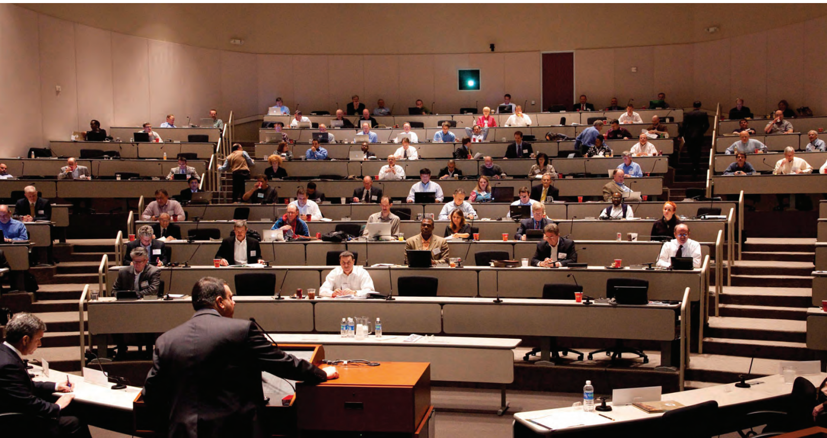
↑ The Symposium on Global Markets is an annual event that attracts lawyers from all over the world. Academy participants sometimes make presentations concerning their countries' practices.

You may join now and immediately take advantage of member benefits. Here is the online application . We encourage you to send someone to the 2013 Academy, which is described in greater detail in this brochure, and to appoint a representative to the Institute's Advisory Board. The annual Advisory Board meeting and the Symposium take place in June 2013. We hope to see you then.