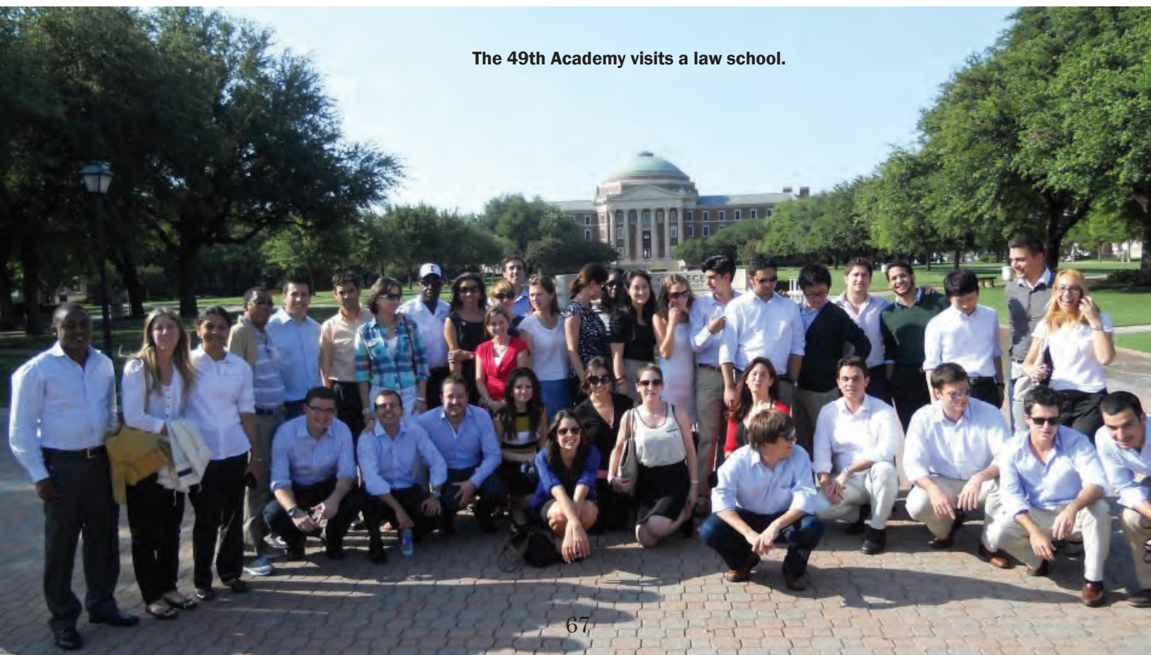
The 49th Academy visits a law school.