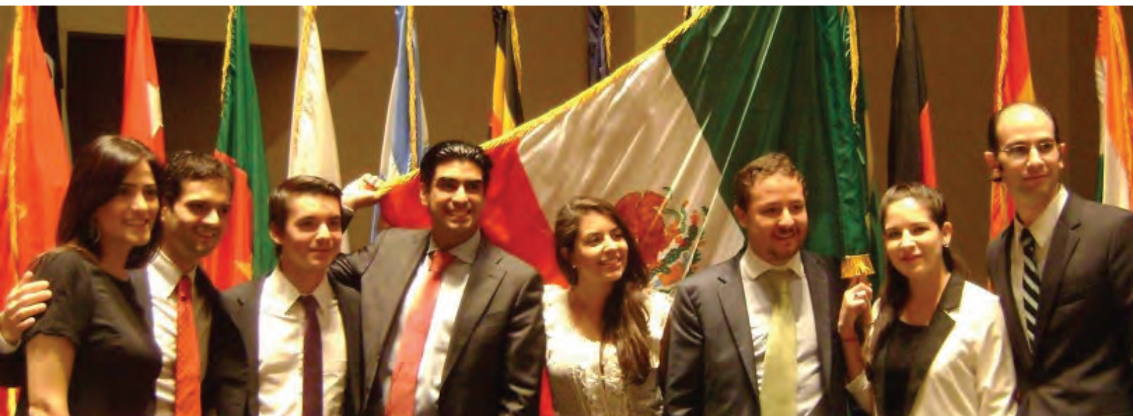
↑ After farewell ceremonies, Mexican participants pose in front of the Mexican flag.

Because the Academy is in the nature of an extended continuing legal education conference for foreign attorneys that have previously completed their degree studies, we do not issue a Certificate of Eligibility. You will, however, have a copy of your letter of admission to the Academy.