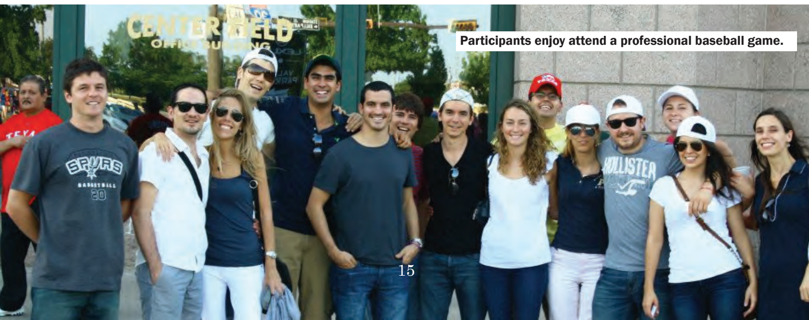
Participants enjoy attend a professional baseball game.