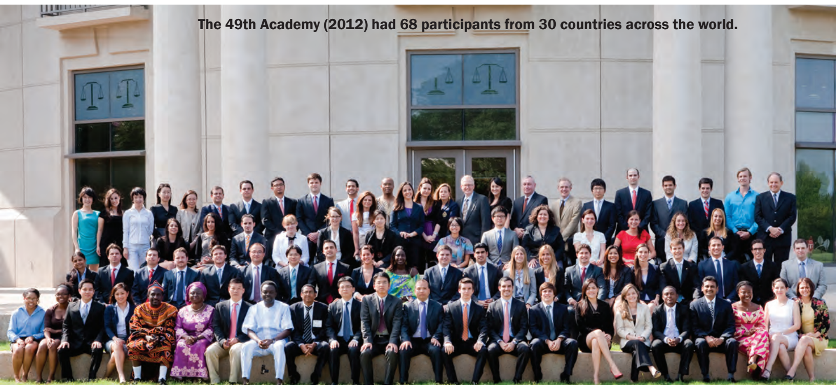
The 49th Academy (2012) had 68 participants from 30 countries across the world.