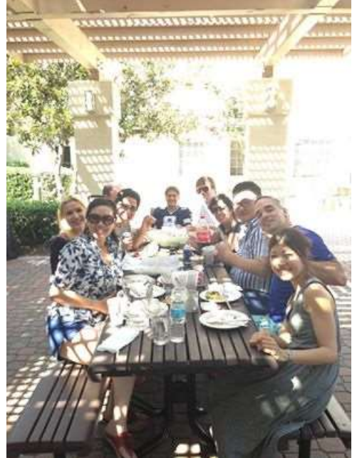
Participants share a meal in the hotel courtyard.

You will receive an activities calendar when you arrive. Participation in some of these activities is mandatory. For any mandatory event there is no charge to you. Optional activities will be available according to your interest and willingness to pay for admission and transportation.