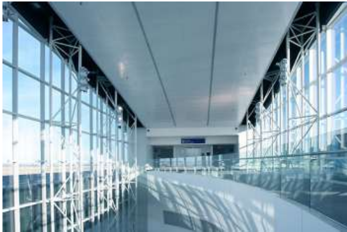
Inside a terminal of the Dallas-Fort Worth Airport

Airport arrival – All international flights and most domestic flights land at the Dallas/Fort Worth Airport (DFW).