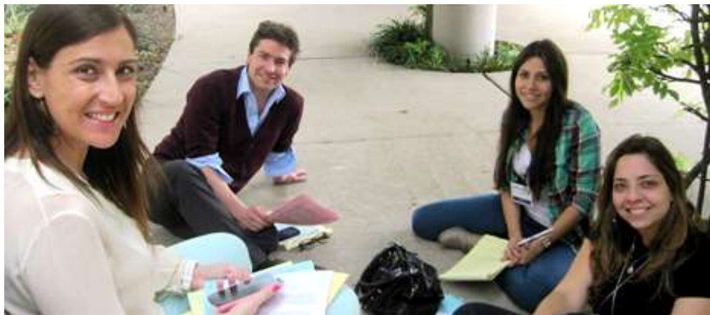
Academy participants use the CAIL courtyard as a venue for their small group discussion.