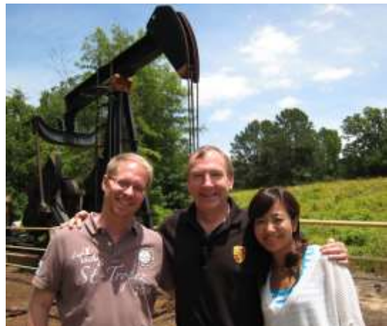
A local host takes two participants to the East Texas Oil Museum.