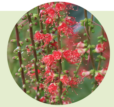
Stream Barringtonia Barringtonia acutangula