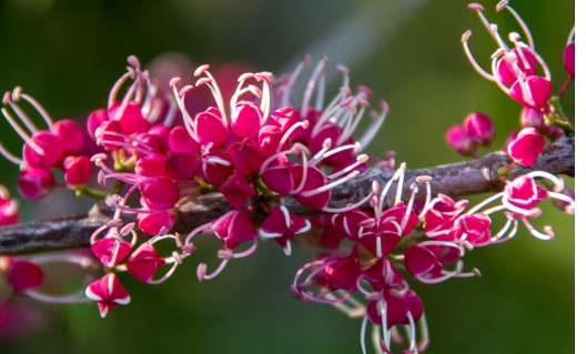
Little Evodia Melicope rubra