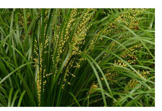
Green Mat Rush Lomandra hystrix