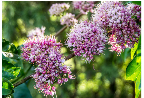
Corkwood Melicope elleryana