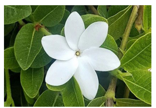
Glennie River Gardenia psidioides