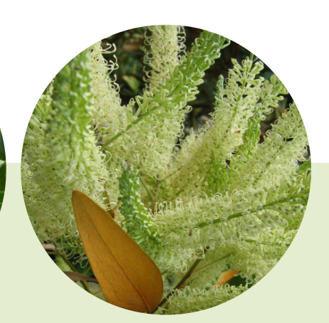
White Oak Grevillea baileyana

This guide is designed to be used to create a beautiful native or mixed garden in the Cairns region. The plants have been identified in groups to provide ideas for species of different sizes and purposes.