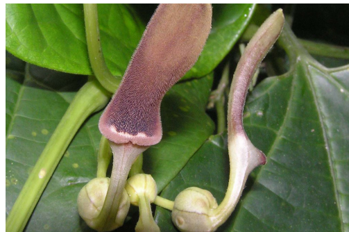
Dutchman's Pipe Aristolochia tagala