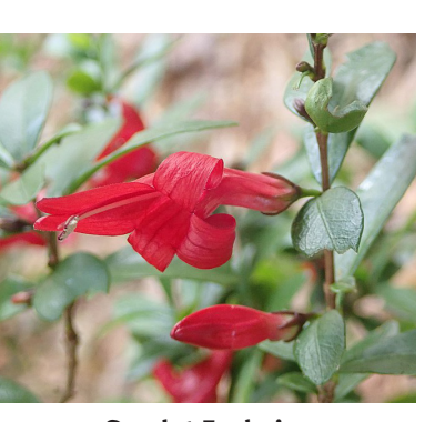
Scarlet Fuchsia Graptophyllum excelsum