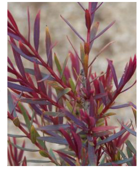
Claret Tops Melaleuca