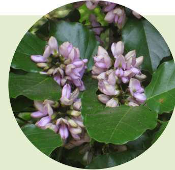
Indian Beech Tree Milletta pinnata

These trees are endemic to coastal and gallery forest environments and can withstand strong sun and winds. They flourish in sandy and loam textured soils, which have limited capacity to retain nutrients and moisture.