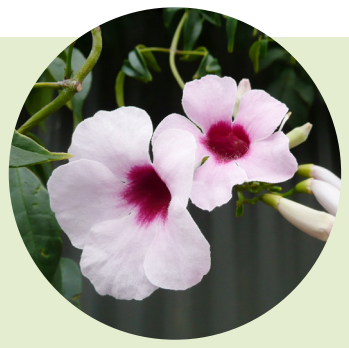
Bower of Beauty Pandorea jasminoides