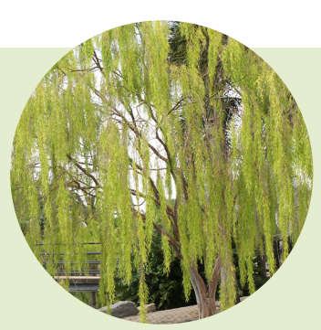
Weeping Tea Tree Leptospermum madidum