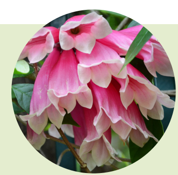
Roaring Meg Tecomanthe dendrophylla cv.