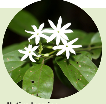
Native Jasmine Jasminum elongatum

Climbers can hide walls and fence off boundaries, particularly in small and narrow gardens. They can enclose structures and provide shelter or shade when supported by wire, wood, trellis, arches and other plants.