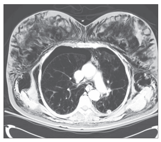
Fig. 2. Noncontrast CT scan of chest with bilateral pneumothoraces and left shift. Extensive subcutaneous emphysema again appears in multiple fascial planes.

The differential diagnosis of acute facial swelling with dyspnea includes angioedema, severe soft tissue infection, superior vena cava syndrome and subcutaneous emphysema.1 Subcutaneous air can result from a number of processes, including blunt or penetrating trauma, barotrauma, infection, malignancy or as a complication of surgical procedures.1 Spontaneous subcutaneous emphysema can result from any process that acutely raises alveolar pressure, such as labour or excessive cough as can be seen in asthma or cannabis use.23 Traumatic causes of subcutaneous emphysema include rib fractures, tracheal rupture, esophageal perforation or direct introduction of air to the subcutaneous space through skin wounds.4-6 A thorough evaluation for the portal of air entry is required because of the mortality associated with some causes of subcutaneous emphysema.<sup>7,8</sup> Infection should be ruled out, as the air may have been produced by gas-forming organisms, which require immediate antibiotics and surgical debridement. Chronic obstructive pulmonary disease (COPD) is a significant risk factor for the development of spontaneous subcutaneous emphysema. The coupling of bullous airspace