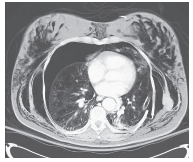
Fig. 3. Noncontrast CT scan of chest also showing bilateral pneumothoraces with shift. The thoracostomy tube is present on the left, and the displaced posterolateral rib fracture is seen on the left. Subcutaneous emphysema is tracking through multiple planes.

Most commonly, pneumomediastinum with subcutaneous emphysema is characterized by chest pain accompanied by thoracic crepitus and distention. Crepitance can often be noted over the supraclavicular fossa and a Hamman crunch may be auscultated over the precordium. Extensive subcutaneous air may cause significant periorbital swelling and ptosis. Distended neck veins indicate compromised peripheral venous return and possible tension pneumothorax or pneumomediastinum. Chest radiographs may reveal