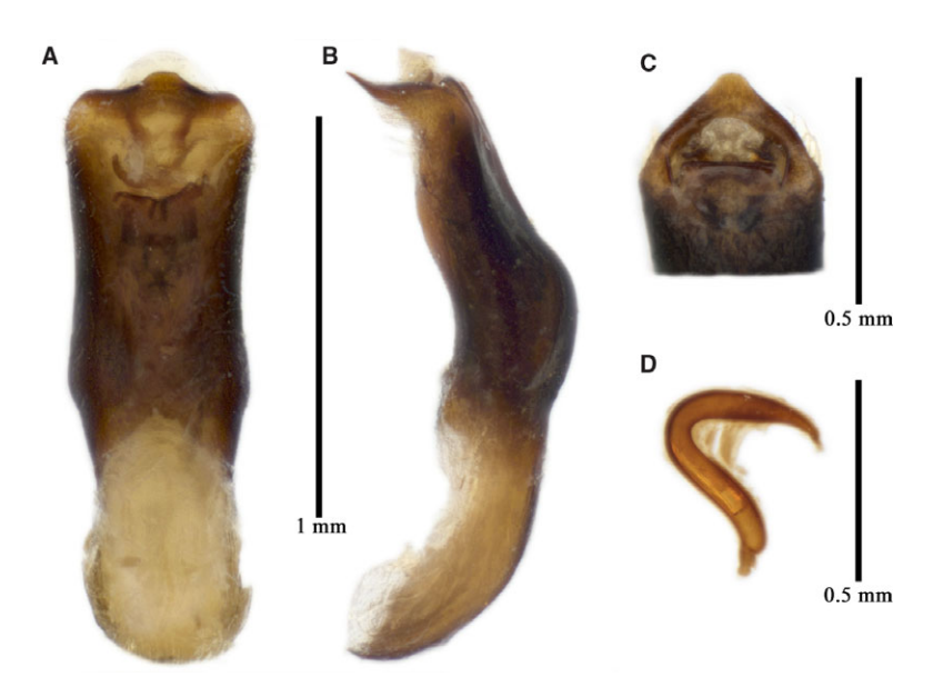
Fig. 3. Genitalia of Cryptocephalus moraei from Québec, Canada: A, aedeagus, dorsal view; B, aedeagus, lateral view; C, aedeagus apex in apico-dorsal view; and D, spermatheca.