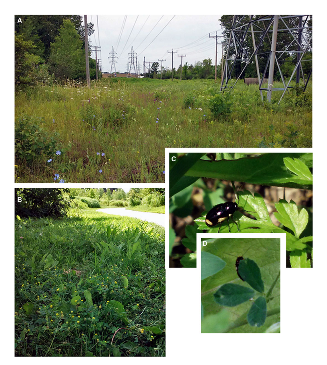
Fig. 1. Habitat and resting plants used by Cryptocephalus moraei from Québec, Canada: A , Boisé Papineau, Laval, Québec, Canada; B , Parc Zotique-Racicot, Montréal, Québec; C , on leaf (possibly of Pastinaca sativa Linnaeus (Apiacieae)); and D , under leaf of Medicago lupulina .

Mohr 1966). The aedeagal shape (Fig. 3A–C) also distinguishes this from previously illustrated North American Cryptocephalus species (White 1968). The prosternum also has pale peg-like postcoxal projections (Fig. 2D) not observed in other North American Cryptocephalinae. Females can be distinguished from males by dark anterior edge of the pronotum and a mesal depression on ventrite 5. The eastern North American Cryptocephalus quadruplex Newman, 1841 is similar, but pale markings are absent from the head and pronotum, and most specimens have the humeral pale spot reaching the elytral base.