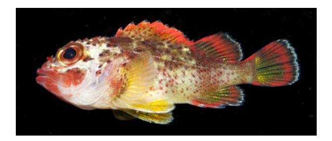
Fig. 5. Sebastapistes coniorta Jenkins, 1903, family Scorpaenidae. USNM 442298.

Order Syngnathiformes Berg, 1940 Family Aulostomidae Rafinesque, 1815 Aulostomus chinensis (Linnaeus, 1766)