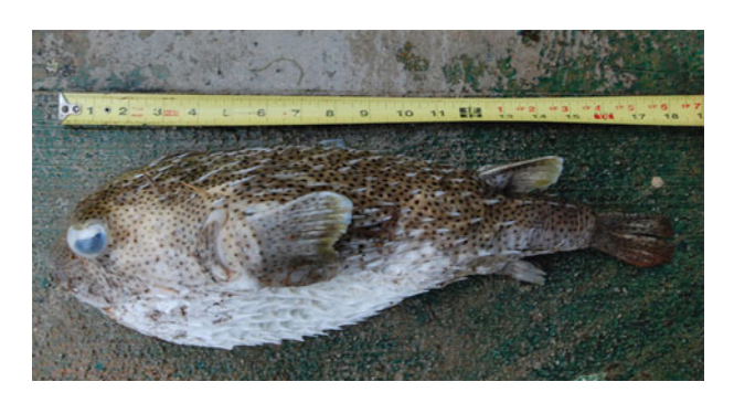
Fig. 12. Diodon hystrix Linnaeus, 1758, family Diodontidae. USNM 442206.