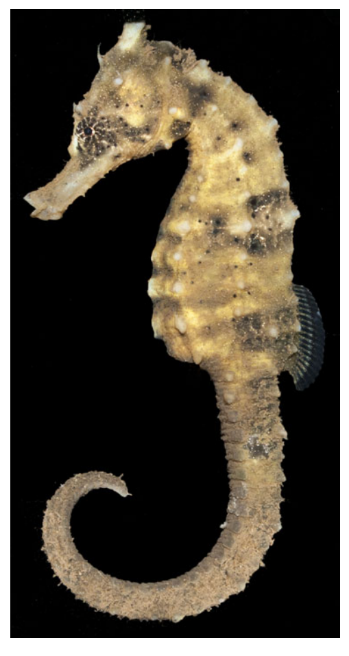
Fig. 4. Hippocampus kuda Bleeker, 1852, family Syngnathidae. USNM 442322.