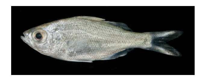
Fig. 9. Kuhlia xenura (Jordan & Gilbert, 1882), family Kuhliidae. USNM 442361.

Note: All species of cichlids in the Hawaiian Islands are introduced. Species in three genera – Oreochromis , Sarotherodon and Tilapia – have been recorded and many specimens likely represent hybrids (B. Mundy personal communication).