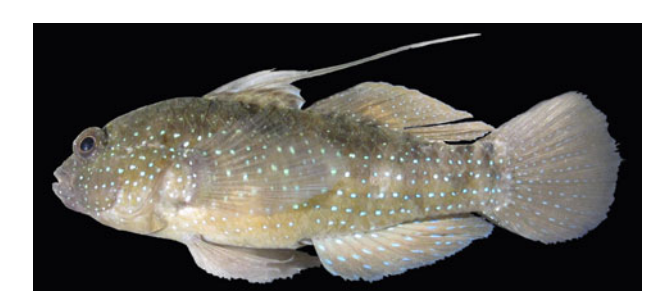
Fig. 6. Asterropteryx semipunctata Rüppell, 1830, family Gobiidae. USNM 421677.