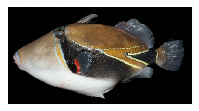
Fig. 11. Rhinecanthus rectangulus (Bloch & Schneider, 1801), family Balistidae. USNM 442410.

Family Pomacanthidae Jordan & Evermann, 1898 Centropyge potteri (Jordan & Metz, 1912)