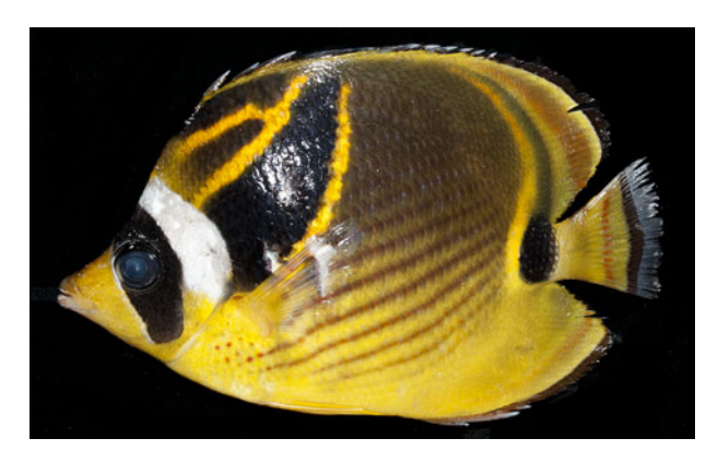
Fig. 8. Chaetodon lunula (Lacépède, 1802), family Chaetodontidae. USNM 442377.