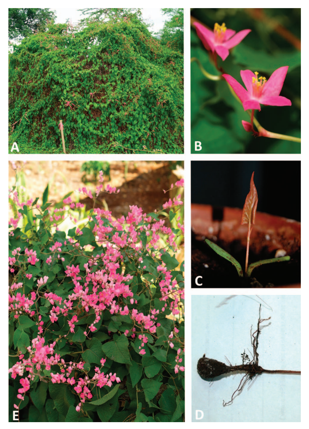
Figure 1. Images clockwise from top left: (A) Habit of Antigonon leptopus on roadside in St. Eustatius. (B) Detail of flower. (C) Seedling with cotyledons and first leaf. (D) Tuberous root produced from seedling. (E) Detail of inflorescence and leaf morphology.