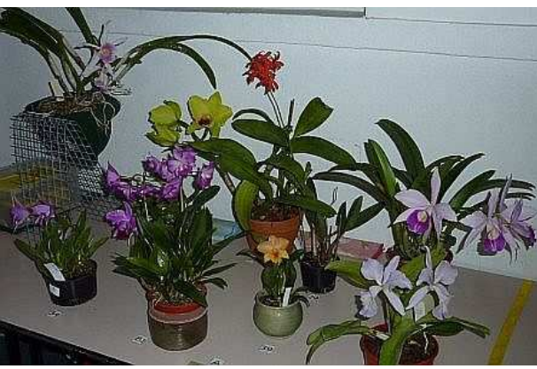
The Laeliinae Hybrid class at the December Meeting.

Click here for info and registration form in Word Click here for info and registration form in pdf