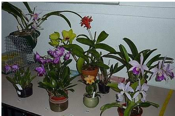
The Laeliinae Hybrid class at the December Meeting.

Click here for info and registration form in pdf