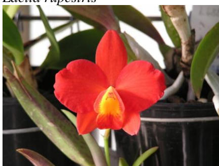
Sophrolaeliocattleya Red Jewel