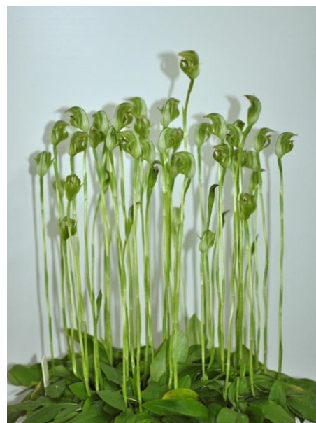
September Orchid of the Night: Pterostylis curta , grown by Nita Wheeler