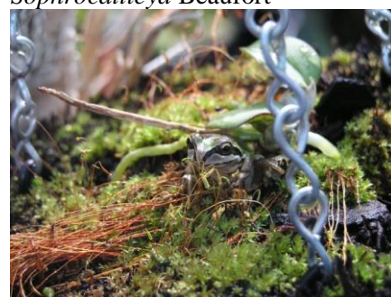
Perin's tree frog