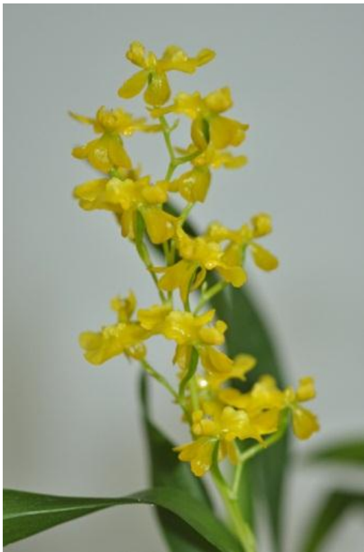
September Judges' Choice Species: Oncidium cheirophorum , grown by Pam Phillips