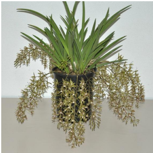
October Judges' Choice Species & Orchid of the Night: Cymbidium canaliculatum , grown by Karen Groeneveld