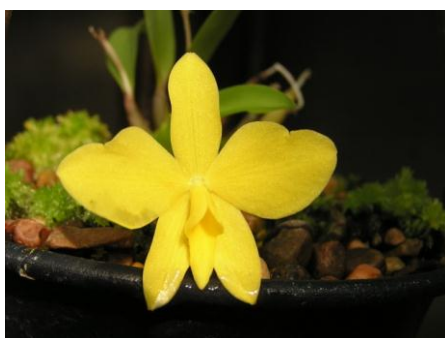
Sophronitis coccinea 'Yellow'