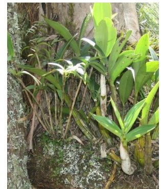
Thelychiton gracilicaulis & T. speciosus