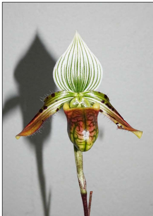
Judges' Choice — Species, July Paphiopedilum venustum grown by David Judge.