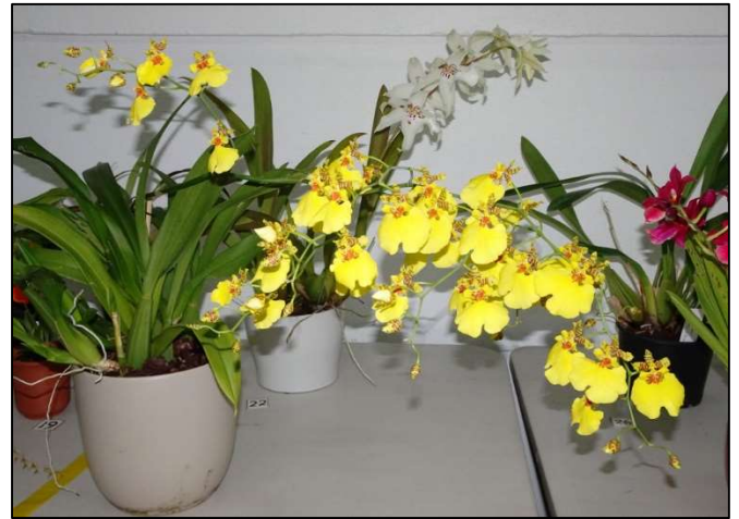
Judges' Choice –Specimen, August Oncidium unknown hybrid grown by Andrea Robold.

Mike started out by using mainly Perlite. It's a natural volcanic glass that is 'popped' in an oven, like popcorn. Easy to source, cheap and very good for increasing the aeration of your mix, whatever you use. But it can suffer a build-up of salts after a while and requires frequent flushing; difficult to rewet if it gets very dry. Top pots with scoria to stop the perlite