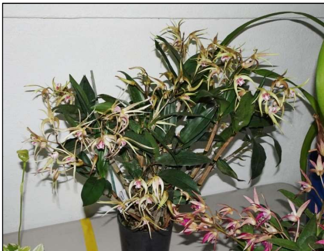
Judges' Choice — Hybrid, August Dendrobium Yondi's Star grown by Brian Dear.

Mike’s take-home message? Don’t be afraid to break the rules and experiment with different mixes and methods in your orchid growing, particularly if there is a group that you’ve had trouble with in the past – something different might just work!