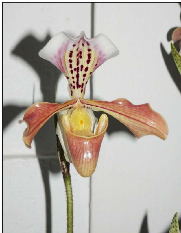
Joint Orchid of the Night, July — Paphiopedilum gratrixianum 'Geyserland' grown by David Judge.

We always need shallow cardboard boxes, high-sided rectangular plastic containers, like those used for packaging fruit in the supermarkets, and plastic bags at the sales table for plant sales. If you can, please collect these and bring with you to the show.