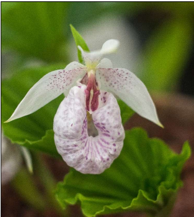
Orchid of the Night, October — Cypripedium formosanum grown by Mike Pieloor