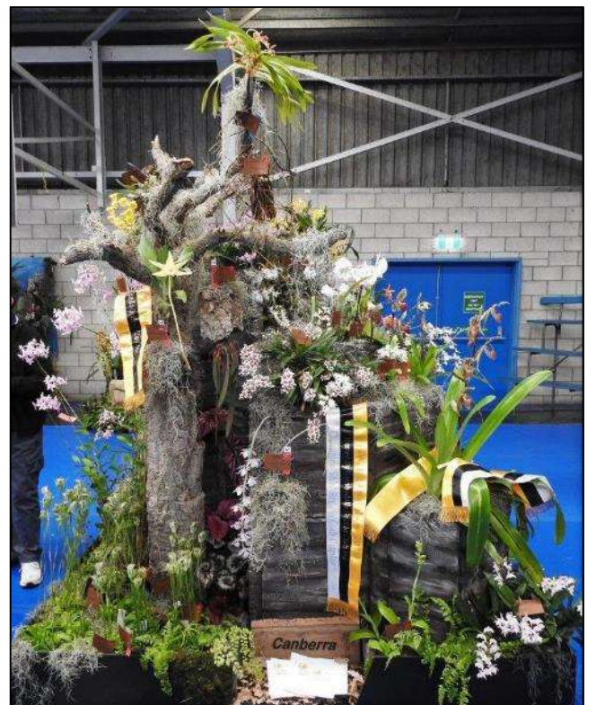
The Society's winning display at the South and West Regional Show