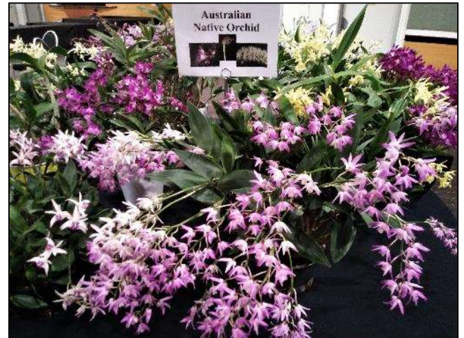
Members' Thelychitons at our show

We owe huge thanks to the many members who have contributed their time and energy to make both of these events a success. The society committee, the display committee and all the members who volunteered. Without their passion and energy we just wouldn't be able to have an orchid show in Canberra, or a display at a conference. Well done and thank you!