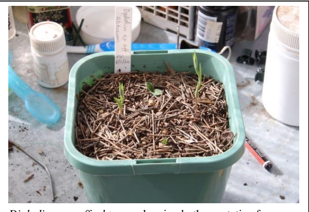
Diplodium sp. aff. obtusum showing both vegetative forms.

of leaves and look like many other greenhoods. However, flowering plants look very different. They lack a basal rosette and instead appear as a stem with several slender leaves, topped by a flower. Whether a tuber produces a flower or not is dependent on whether the plant has the energy available to invest in flowering. As a result, smaller tubers tend to produce only basal rosettes and larger tubers tend to flower.