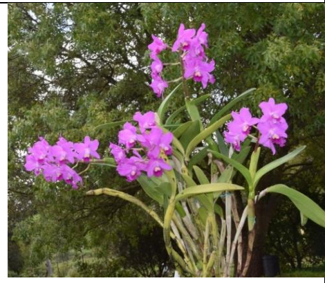
Cattleya Portia Grown by Ben Wallace