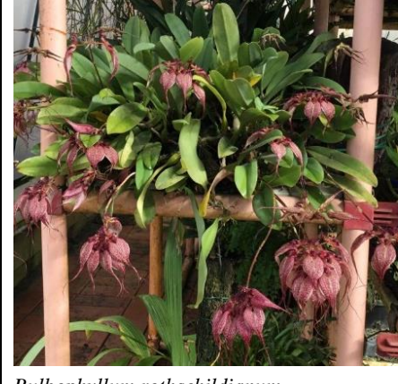
Bulbophyllum rothschildianum Grown by Bill Ferris