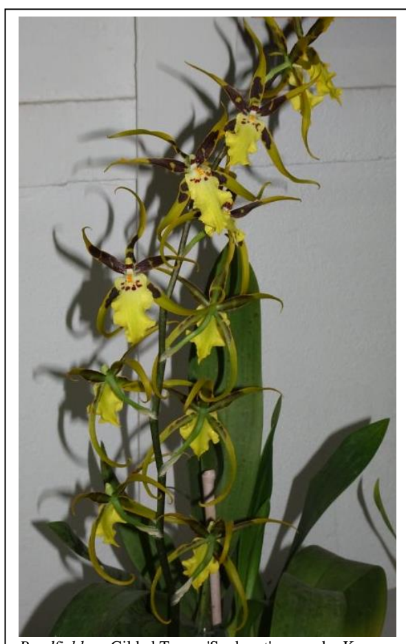
Bandfieldara Gilded Tower 'Sunburst' grown by Karen Groeneveld – Judges' Choice Hybrid, March meeting.

Don't repot if the plant has a flower-spike coming — wait and enjoy the flowers; then repot. Back-bulbs without leaves won't re-flower, but will continue to contribute nutrients to the plant, so should be included in plant divisions when repotting.