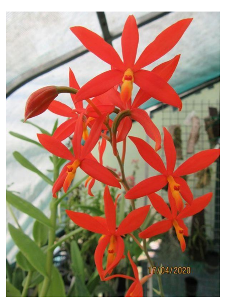
Encyclia vitellinaa, grown by Lynne Phelan, April