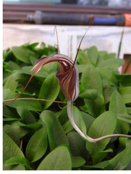
Diplodium coccinum Grown by Karen Groeneveld