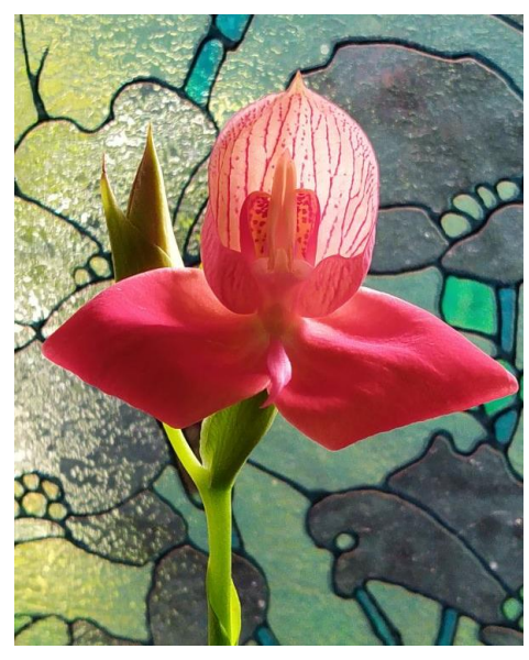
Disa uniflora, grown by Zoe Groeneveld, December meeting