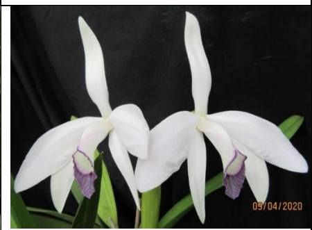
Laelia perrinii var coerulea Grown by Lynne Phelan