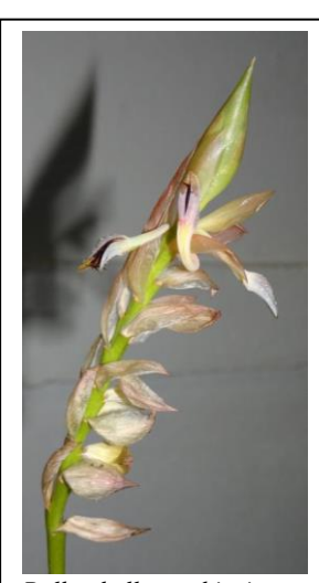
Bulbophyllum schinzianum grown by Mark Fraser & Sandra Corbett.

• Bulbophyllum schinzianum – an African species. The type species of Bulbophyllum comes from Africa (Mauritius). Unlike Asian species (and those from PNG), which generally have single flowers, the African species usually have a flowering rachis with continuous growth and multiple flowers. The petals of B. schinzianum have little 'diggley bobs', suggesting it's probably fly-pollinated.