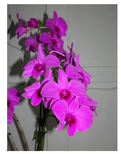
Vappodes phalaenopsis grown by Karen Groeneveld