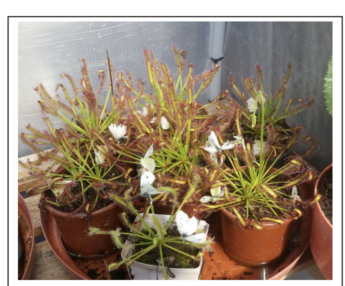
Sundews catching cabbage moths.