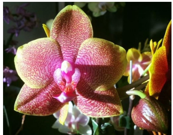
Popular Vote Phalaenopsis Unknown Grown by Craig Allen