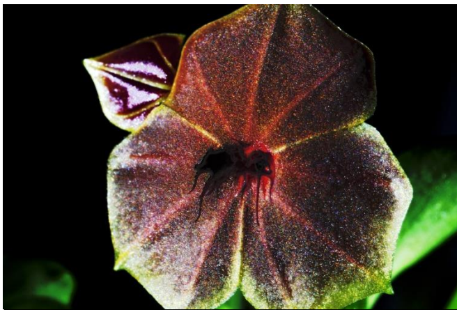
Best Exhibit: Art, Craft, Photography and Best Exhibit: Photography Lepanthes telipogoniflora Presented by Mark Fraser