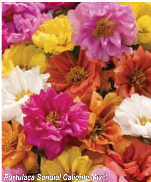
Portulaca Sundial Caliente Mix D