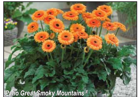
Patio Great Smoky Mountains E

The Gerbera Garvinea series boasts true garden performance from a gerbera. The smaller flowers are more numerous than in pot plant types. Garvinea gerbera serve well for early spring production, tolerating a light frost once established and are hardy in mild climates (Zone 7+). Produced from tissue culture. Allow 12-14 weeks to finish earlier crops, 10-12 weeks to finish later crops. Garvineas finish nicely in 6" or gallon pots, one plant per pot.