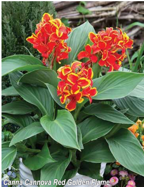
Canna Cannova Red Golden Flame A