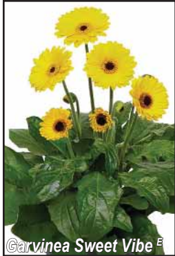
Garvinea Sweet Vibe E