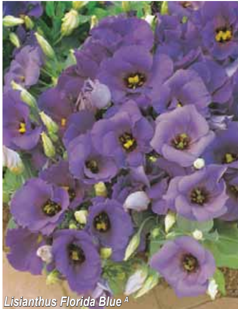
Lisianthus Florida Blue A