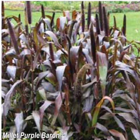
Millet Purple Baron A