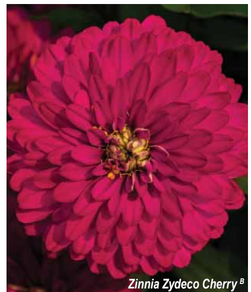
Zinnia Zydeco Cherry B