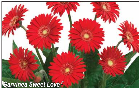
Garvinea Sweet Love E