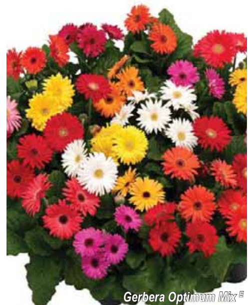
Gerbera Optimum Mixture ®

Use: packs, pots Ht: 4-8" Colorful foliage for accents •288• Red Rose