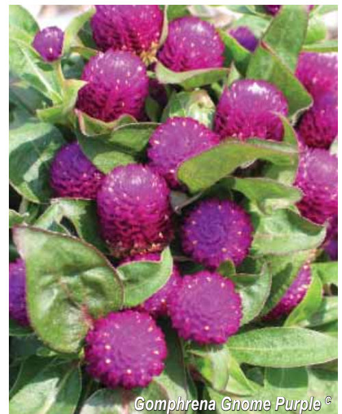
Gompheana Gnome Purple ®