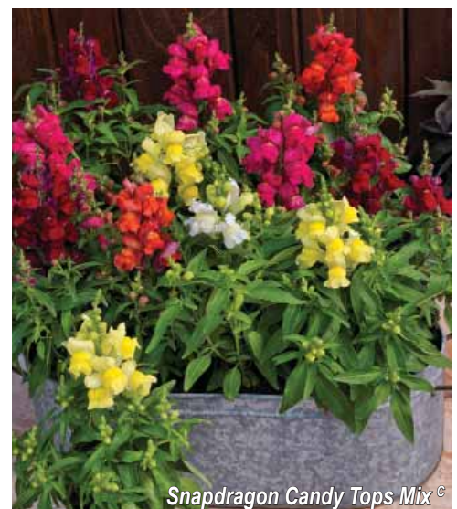
Snapdragon Candy Tops Mix ®