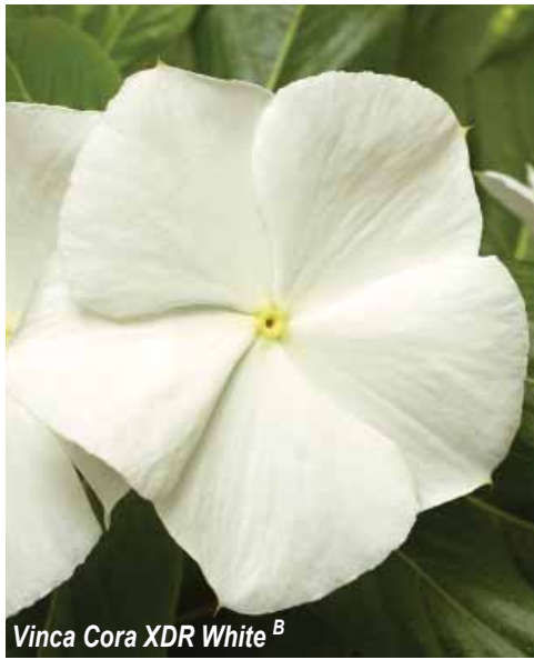
Vinca Cora XDR White B