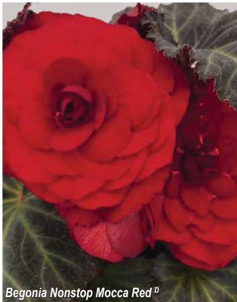
Begonia Nonstop Mocca Red D