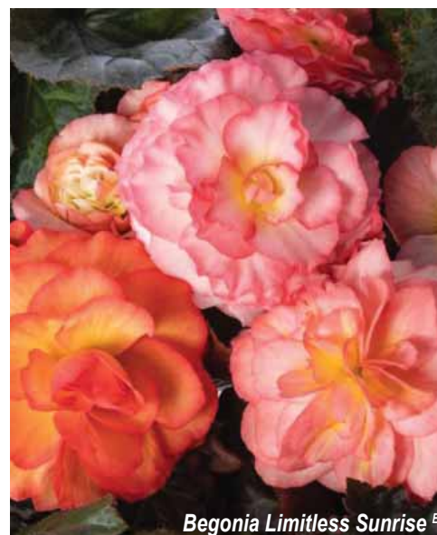
Begonia Limitless Sunrise B