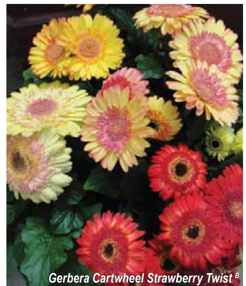
Gerbera Cartwheel Strawberry Twist ®