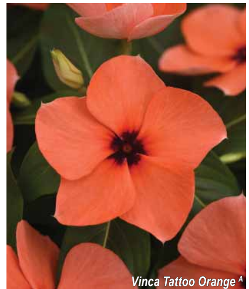
Vinca Tattoo Orange A