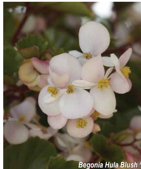
Begonia Hula Blush A

Use: pots, baskets Ht: 8-12" Fully-double, extra-large flowers with early blooming. •51 Strip•72• Mix - NEW Cream Shades - NEW Dark Red - NEW Dark Rose - NEW Orange - NEW Sorbet - NEW Sunrise - NEW Sunset - NEW Yellow - NEW