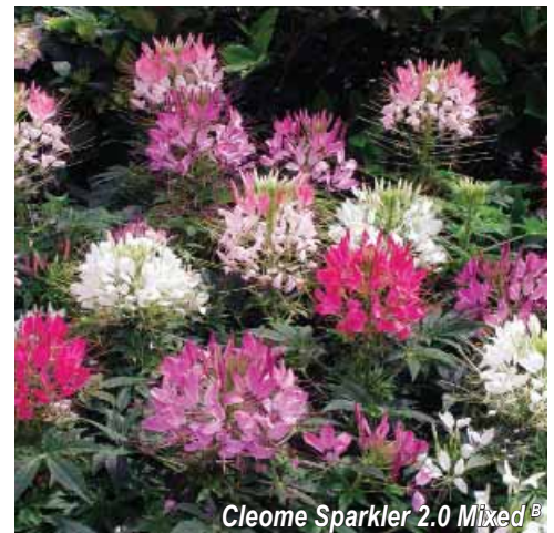
Cleome Sparkler 2.0 Mixed B