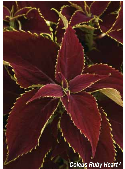
Coleus Ruby Heart A