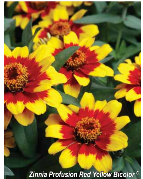
Zinnia Profusion Red Yellow Bicolor C