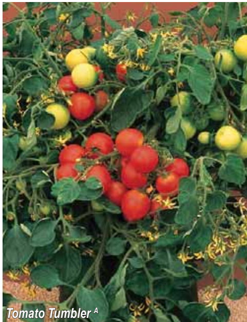
Tomato Tumbler A