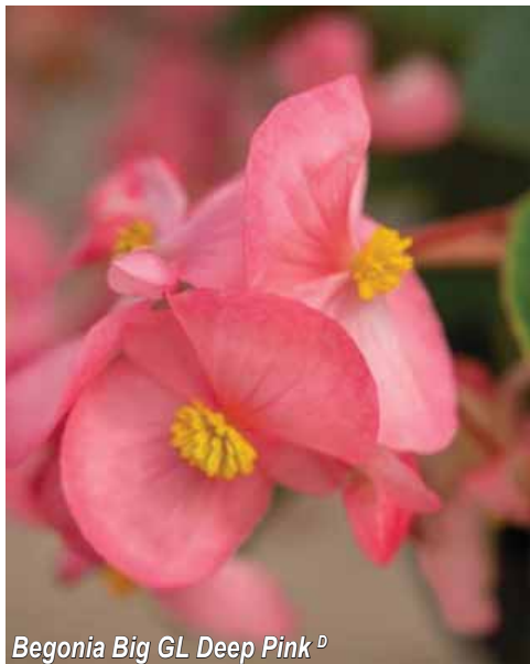
Begonia Big GL Deep Pink D