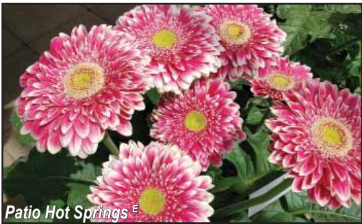
Patio Hot Springs E