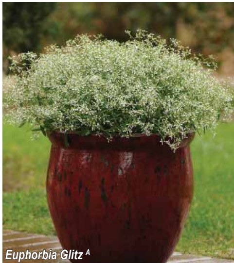
Euphorbia Glitz A