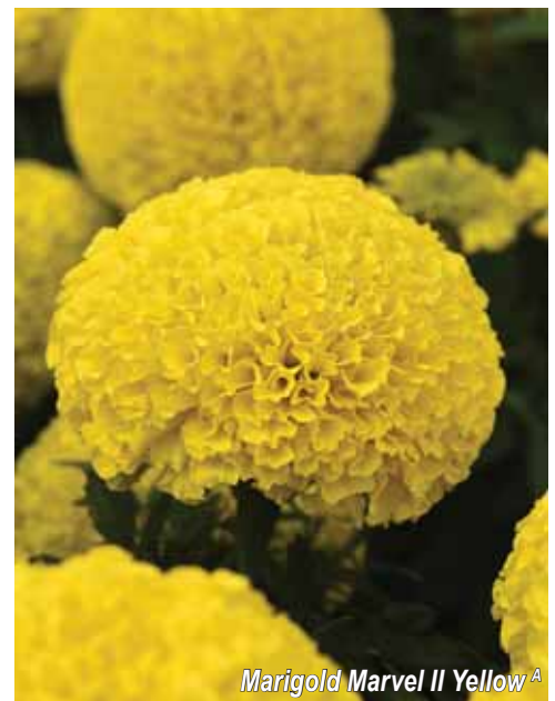
Marigold Marvel II Yellow A