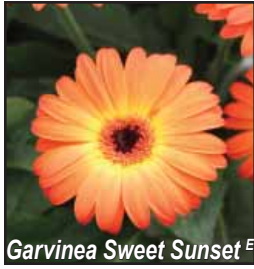
Garvinea Sweet Sunset E