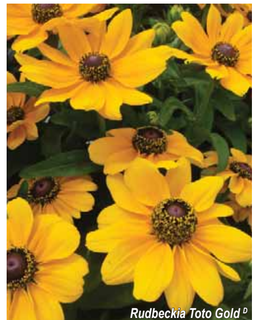
Rudbeckia Toto Gold D