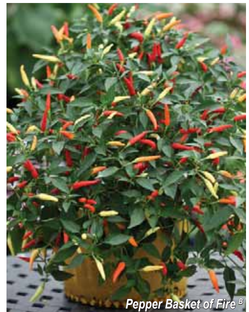
Pepper Basket of Fire B