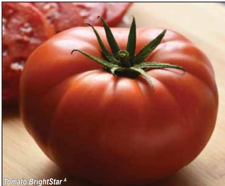
Tomato BrightStar A