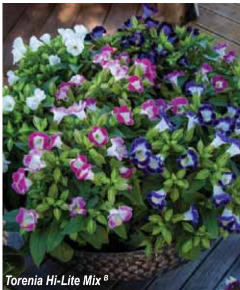
Torenia Hi-Lite Mix B