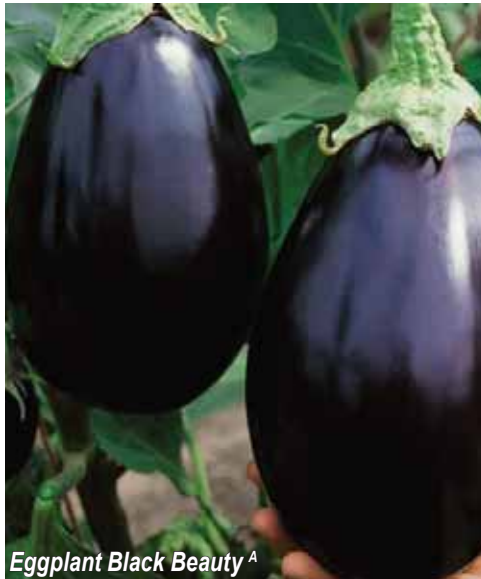
Eggplant Black Beauty A