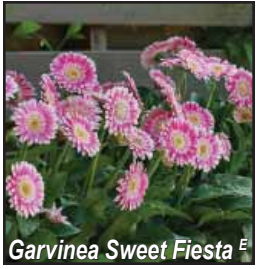
Garvinea Sweet Fiesta E