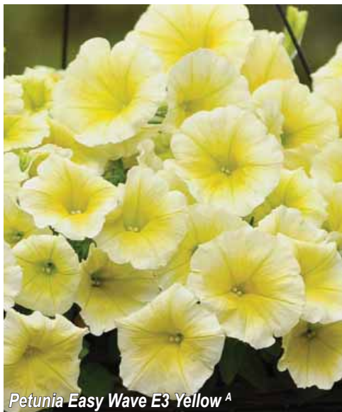
Petunia Easy Wave E3 Yellow A