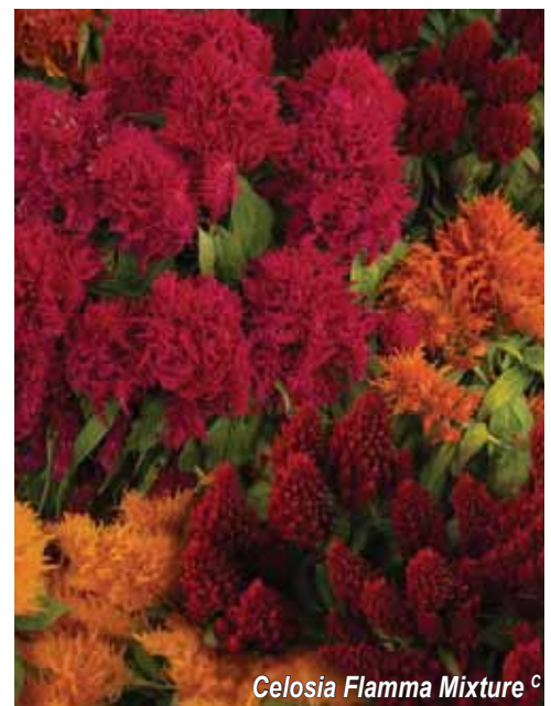
Celosia Flamma Mixture C