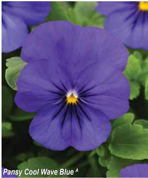
Pansy Cool Wave Blue A