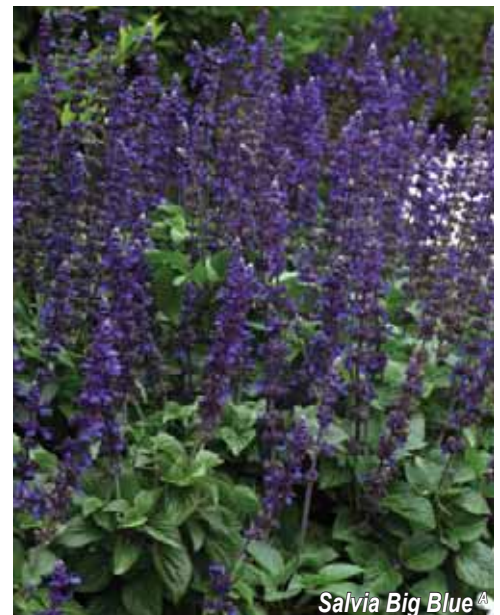
Salvia Big Blue TM

Use: pots, combos Ht: 16-24" Fine textured, upright grass •144•51 Strip•