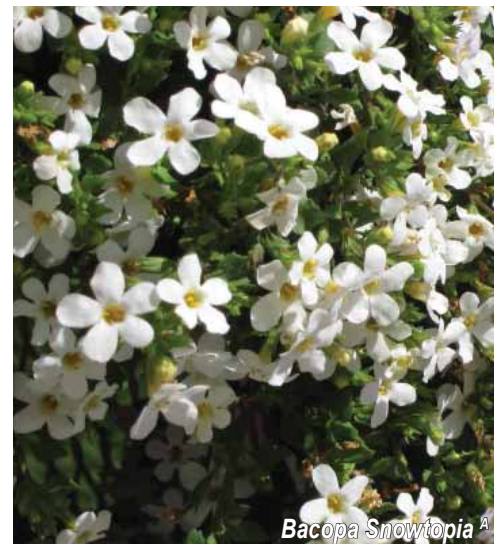
Bacopa Snowtopia A