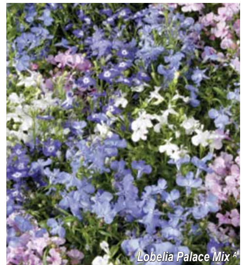
Lobelia Palace Mix A