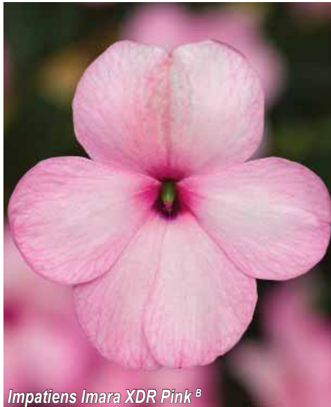
Impatiens Imara XDR Pink B