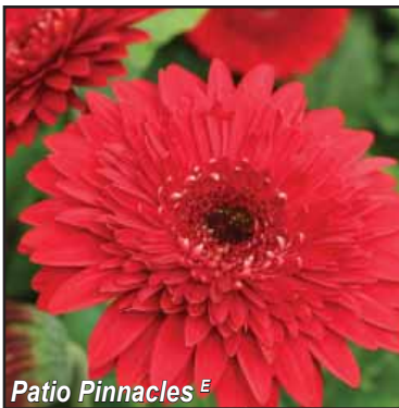
Patio Pinnacles E