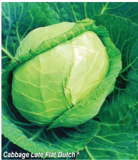
Cabbage Late Flat Dutch A