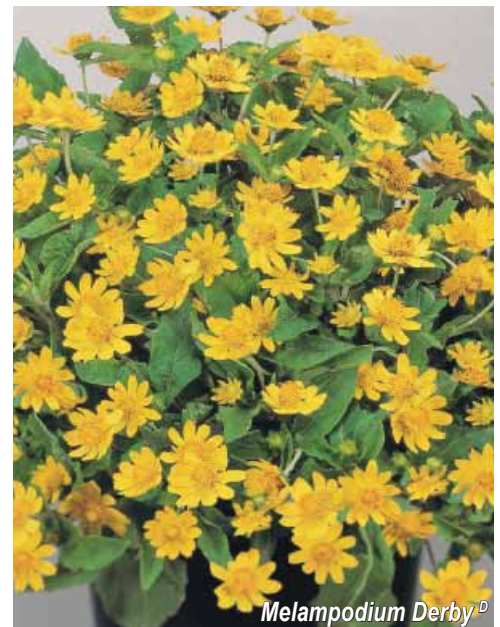
Melampodium Derby D

Use: pots, packs Ht: 8" Golden yellow, mounded •288•