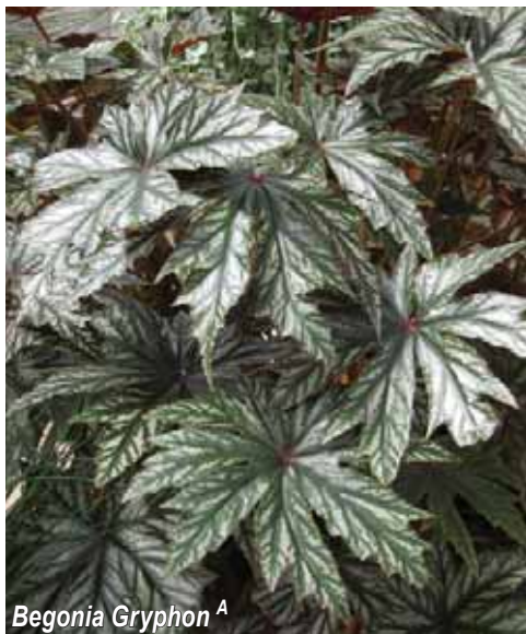
Begonia Gryphon A