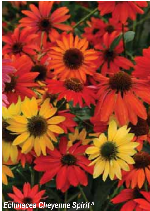
Echinacea Cheyenne Spirit A