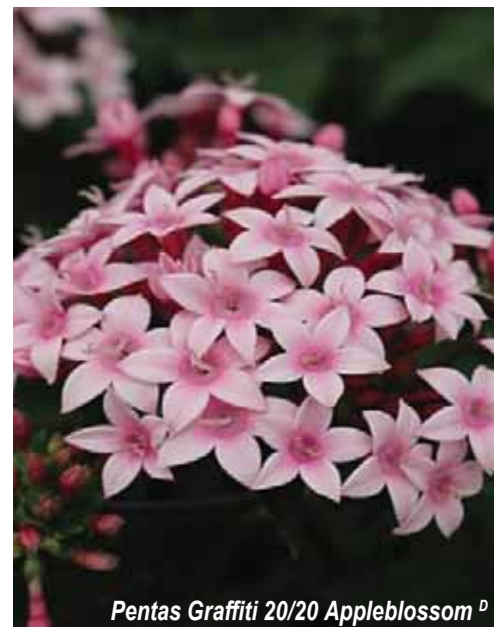
Pentas Graffiti 20/20 Appleblossom D