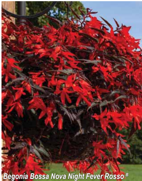
Begonia Bossa Nova Night Fever Rosso B