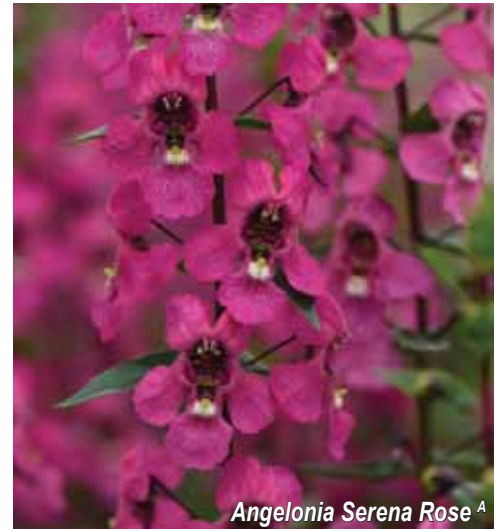
Angelonia Serena Rose A

•288•51 Strip• Sweet Large Leaf (Eleonora) •51 Strip• Dolce Fresca Lemon Purple Ruffles Spicy Globe Sweet Thai