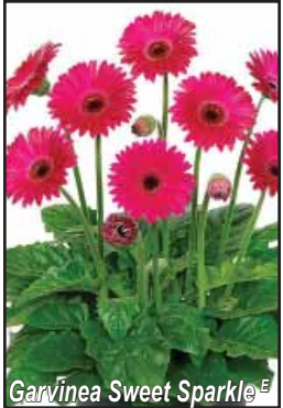
Garvinea Sweet Sparkle E