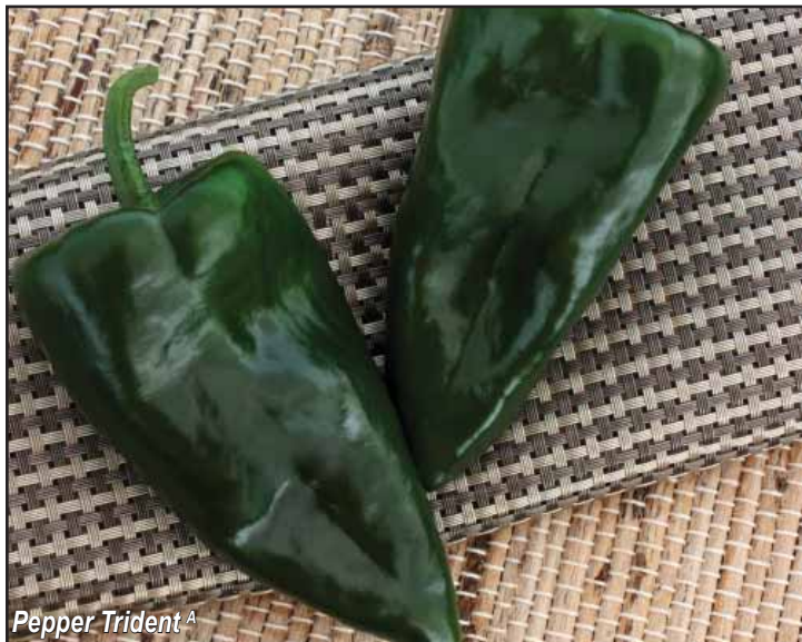
Pepper Trident A