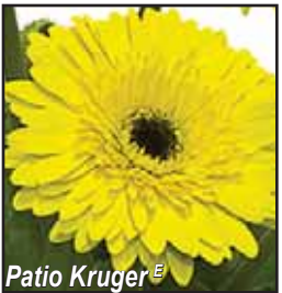
Patio Kruger E