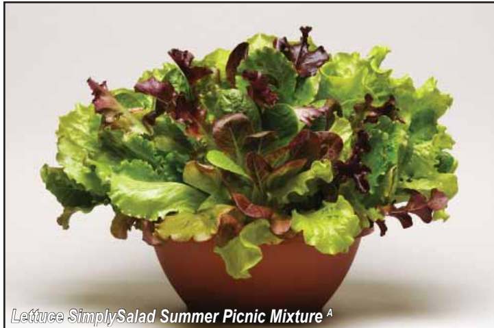
Lettuce SimplySalad Summer Picnic Mixture A