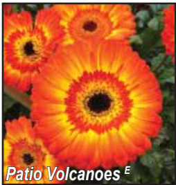
Patio Volcanoes E