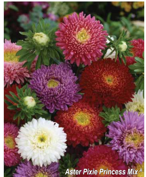
Aster Pixie Princess Mix A