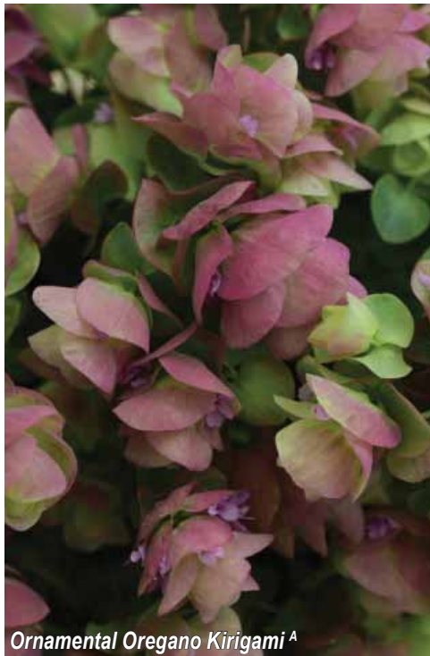
Ornamental Oregano Kirigami A