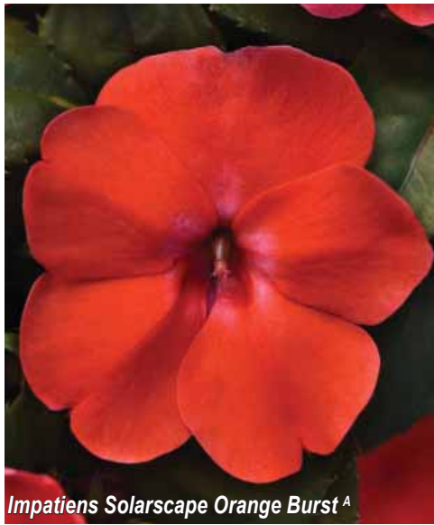
Impatiens Solarcape Orange Burst A