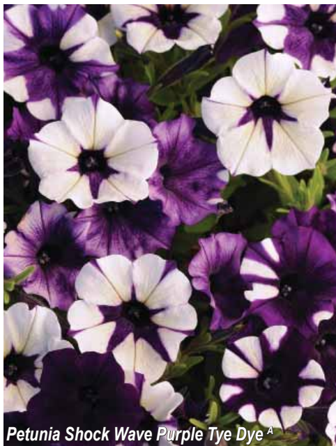
Petunia Shock Wave Purple Tye Dye A