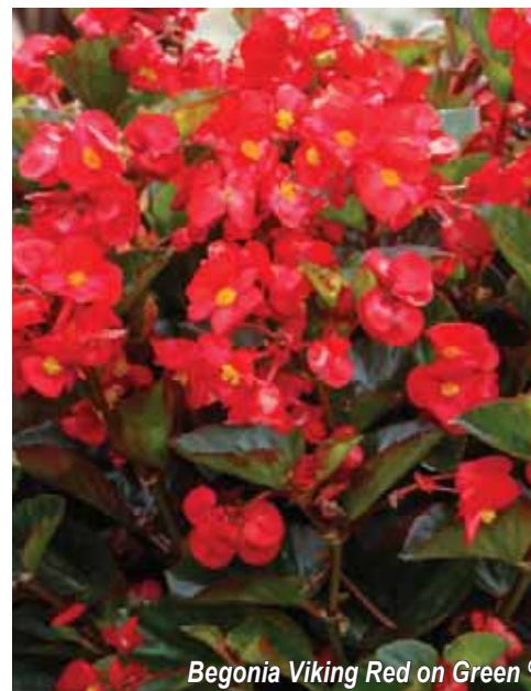
Begonia Viking Red on Green C