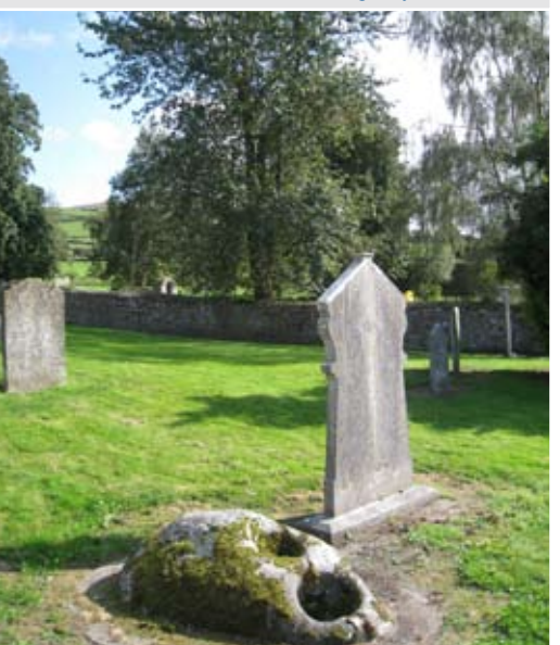
Remains of the church dedicated to St. Finian in the 6th century

Double bullaun stone in the church graveyard