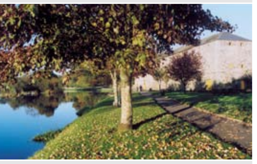
Bagenalstown Railway Station, considered one of the finest in the country