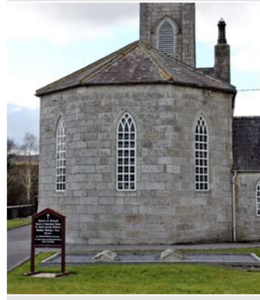
St. Lazerian's Roman Catholic Church