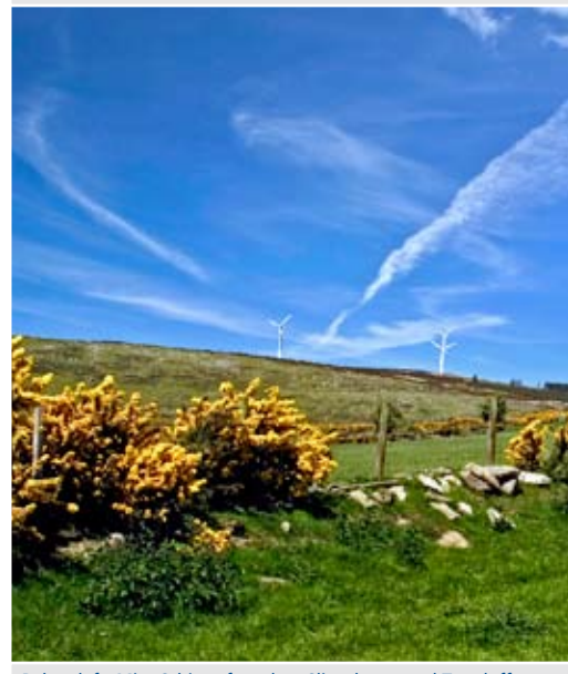
Below left: Mica Schist – found on Slievebawn and Tomduff Below right: granite, principle rock type of the Blackstairs Mountains