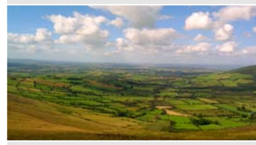
Bunclody Golf and Fishing Club

Bunclody – access point to Mount Leinster and the Blackstairs Mountains