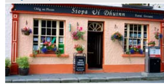
Weavers Cottages, Clonegal