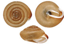
Photo(s): Euchemotrema fraternum has a stout, "fuzzy" shell, by Larry Watrous ©.