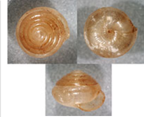
Photo(s): Euconulus fulvus shell, showing the height of the final whorl greater than half the entire shell height.