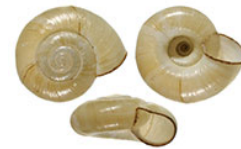
Photo(s): Live Haplotrema concavum by Bill Frank ©, views of a shell by Larry Watrous ©. Note the tube-shaped whorls and wide umbilicus.