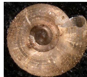
Photo(s): Three views of a Helicodiscus diadema shell, noting the curved processes upon the outer protein coat.