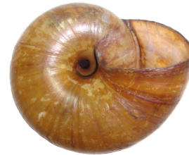
Live Mesomphix cupreus, and shell