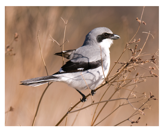
Loggerhead Shrike. (Jeff Lemons)

The Loggerhead Shrike was designated as "critically imperiled" as a breeding species within Mecklenburg County in 2008 because only a few remaining nest sites were known. The last nest site in the county was in a field beside a busy movie multiplex parking lot. Unfortunately, this outparcel was later turned into a gas station. Volunteers failed to find any evidence of breeding during the recent Breeding Bird Atlas project, and it now appears that this bird may have been extirpated (lost) as a breeding species in Mecklenburg County, at the core of the Central Carolina region.