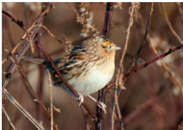
Le Conte's Sparrow in Gaston County.

Near the town of Chester, S.C., on the dividing ridge between the Broad and Catawba Rivers, there is an "old-field" of some two hundred acres that has been lying out, until recently, for a number of years. Here and there are patches of newly-sown grain, but the greater portion is now in broomsedge and weedy stubble corn land. Near the middle there is a small "wet weather branch," which empties into a large creek a mile distant. November 11, 1881, in this