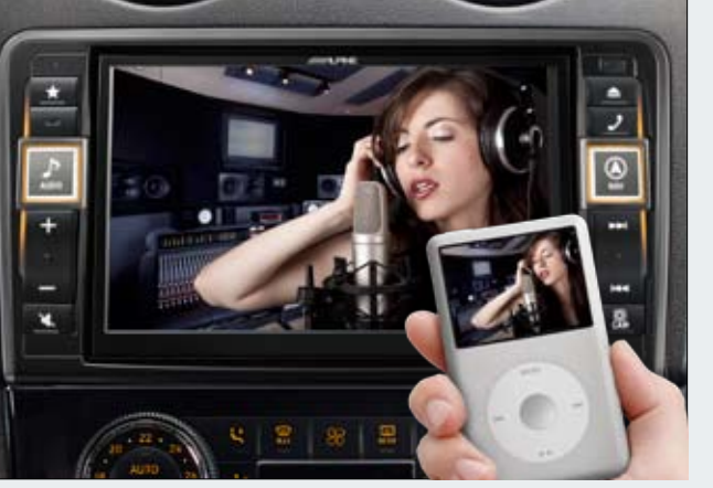
Mobile entertainment: connect your digital or analog mobile devices for video entertainment on the road

The X800D-ML allows you to enjoy movies, music videos or TV shows from many different sources, such as DVDs from the built-in optical drive, USB sticks, latest smartphones with HDMI output or portable video devices connected to the A/V connector (optional cables may be required). You can also connect your iPod or iPhone to enjoy your video content on the large 8-inch display. For driving safety the video playback feature is only available if the vehicle is not in motion.