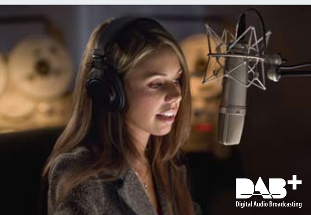
DAB Digital Radio: enjoy noise-free, digital sound quality from hundreds of DAB radio stations.

The built-in DAB/DAB+/DMB tuner uses the most advanced digital technology to deliver radio reception in outstanding, noise-free sound quality. DAB also offers many other advantages over traditional FM radio: select from a much wider range of radio stations and after an initial station scan you can easily select your desired channels from an alphabetic and genre list of available stations.