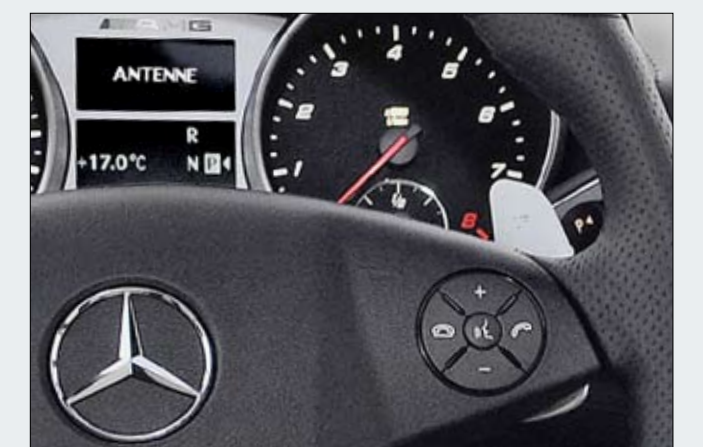
The system is fully compatible with the ML's steering wheel control buttons and multi-information display.

Our innovative "One Look" split-screen technology allows the driver to view the navigation map and audio playback information at one glance. This eliminates the need to switch between different applications. The user can switch from regular to One Look view with just the touch of a button. This function is especially useful on long highway trips.