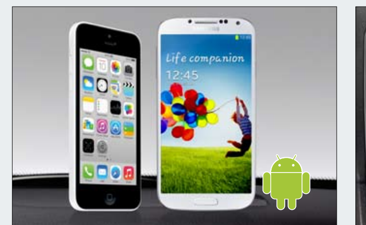
Stay Connected: the X800D-ML is compatible with the latest smartphones

The Alpine system ensures compatibility with the latest smartphones such the iPhone 5S/C, the Samsung Galaxy S5 or the HTC One. This offers many advantages: you can enjoy digital content stored on your phone such as music or video files, access your phonebook or simply charge your phone. You can even activate SIRI and voice-control your iPhone for maximum confort and driving safety.