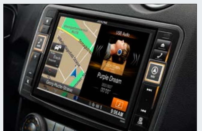
Navigation maps and audio playback information can be displayed by innovative split-screen technology