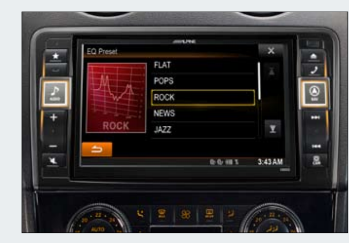
Professional sound tuning included: Alpine audio engineers created the perfect setup for your ML

Alpine is known worldwide for excellent sound quality. Our audio specialists engineered the X800D-ML with greatest attention to detail - from selection of high-grade components to extensive audio tuning - to deliver a high-end sound experience for the ML. The system also offers many sound adjustment functions such as digital time correction and professional equalisation to allow users to adjust the system to their own preferences.