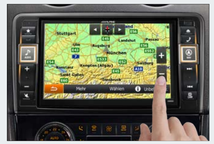
The 20cm high resolution WVGA touch screen: a cinematic experience in your dashboard (X800D-ML)

The 8-inch (20.3 cm) high resolution display is 60% larger than the original ML display and features the latest video technology for outstanding picture clarity, contrast and resolution. This allows navigation maps to be displayed in stunning detail, while movies or video clips become a real cinematic experience. It also contributes to driving safety: navigation map details are easier to see and destination input keys appear larger and are easier to operate.