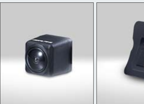
Optional Multi-View Camera (HCE-C252RD)