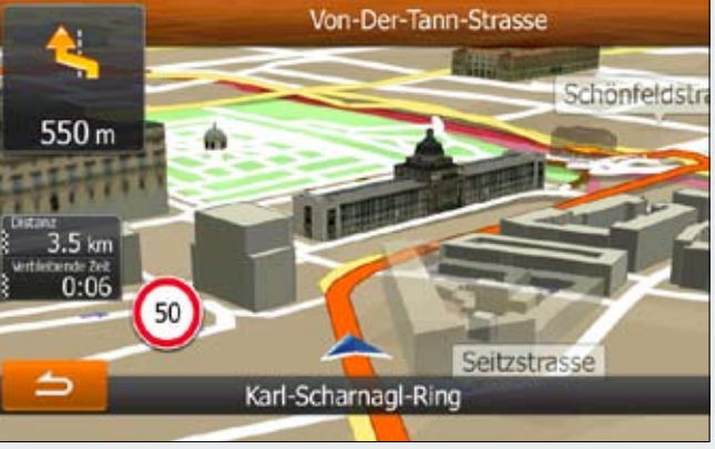
3D maps (landscapes) with 3D buildings and landmarks - combined with speed restriction display and speed camera warnings (not available in France)