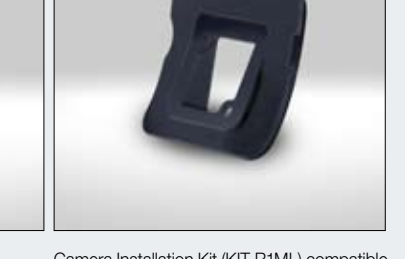
Camera Installation Kit (KIT-R1ML) compatible with ML model year 2008 and newer.