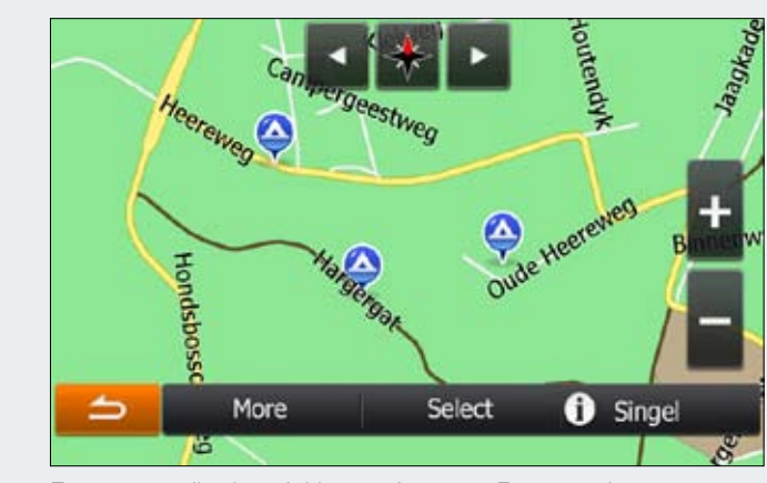
Easy personalization of driver preferences. For example, see information on camping grounds and trailer restrictions.