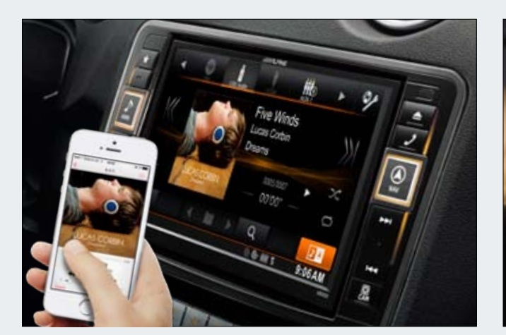
Made for iPod: see the album artwork and song information at one glance

If you connect an iPod, USB device or smartphone you have easy access to your full music library. You can easily search content by artist, album, song, genre or playlist. Alphabetic search will help you to browse quickly through your library to find what you are looking for. Audiobooks and podcasts are also a great way to keep you entertained.