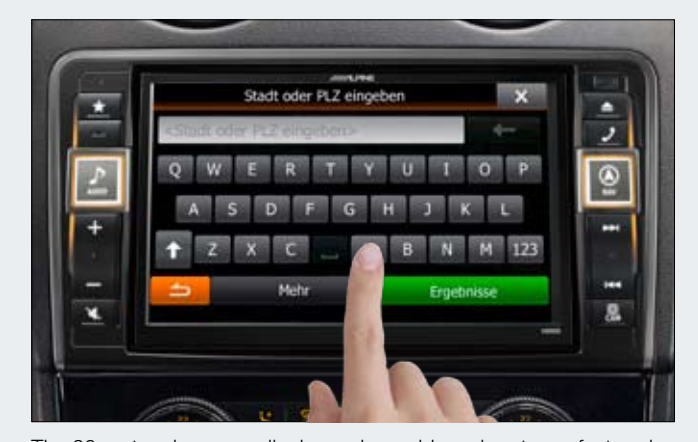
The 20cm touch screen display makes address input very fast and safe due to the large input keys

The integrated premium navigation system is the perfect co-pilot, whether for a long vacation journey, a business trip to another city or simply a family weekend to the countryside. With many convenient functions to make driving easier, you'll arrive at your destination feeling fresh and relaxed.