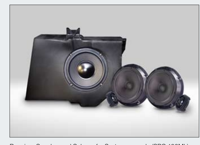
Premium Speaker and Subwoofer System upgrade (SPC-100ML).

This top-class speaker package includes a front system with soft dome tweeters and large midrange speakers, plus a 20cm high performance subwoofer. All speakers are perfectly matched to the digital amplifier for superb audio quality with optimum sound staging. They are also specifically designed to fit in the ML's original speaker and subwoofer locations. * For upgrading the ML W164 original entry sound system. Requires PDP-E310ML.