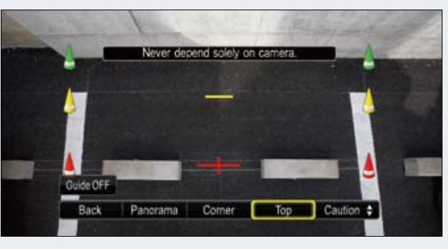
Top view: convenient for precise reversing, for example to hook up a trailer.