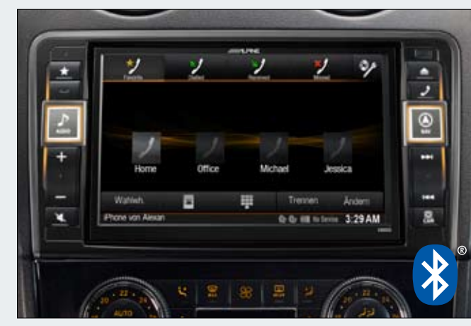
Latest Bluetooth® technology: Hands-free phone calls and audio streaming

The built-in Bluetooth® module allows wireless connection of a mobile phone for hands-free communication, while frequent software updates ensure full compatibility with the latest phones. A very intuitive user interface makes it very easy to operate and also includes a speed dial function for the most frequently called numbers. Bluetooth® also enables audio streaming from the phone: audio content or even internet radio can be wirelessly transferred to the X800D-ML.