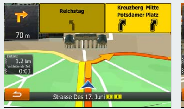
Lane Guidance lets the driver know which is the best lane to be in, while Dynamic TMC Route Guidance provides live traffic information to avoid traffic jams.