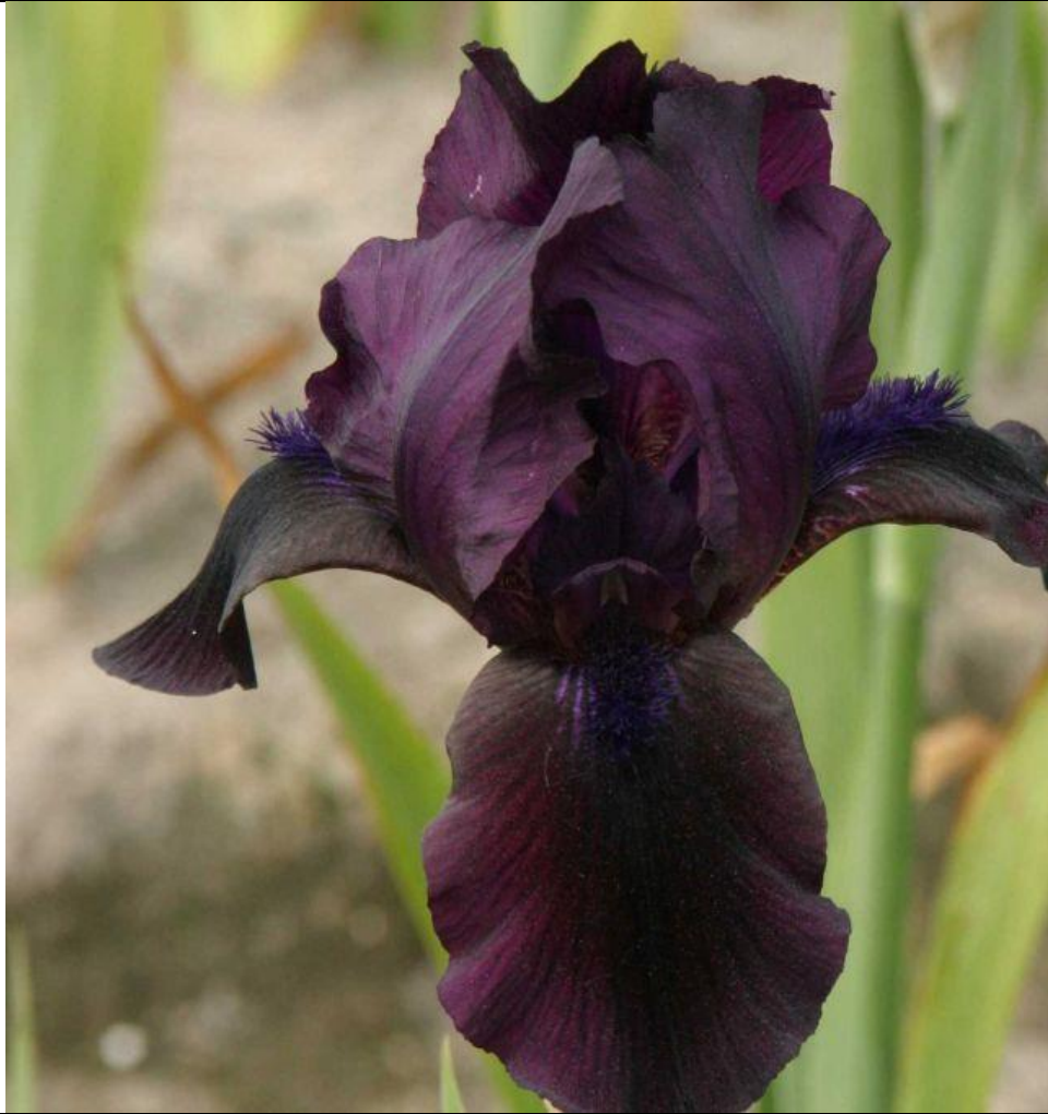
Black Watch (Intermediate) [arriving bare root next autumn]