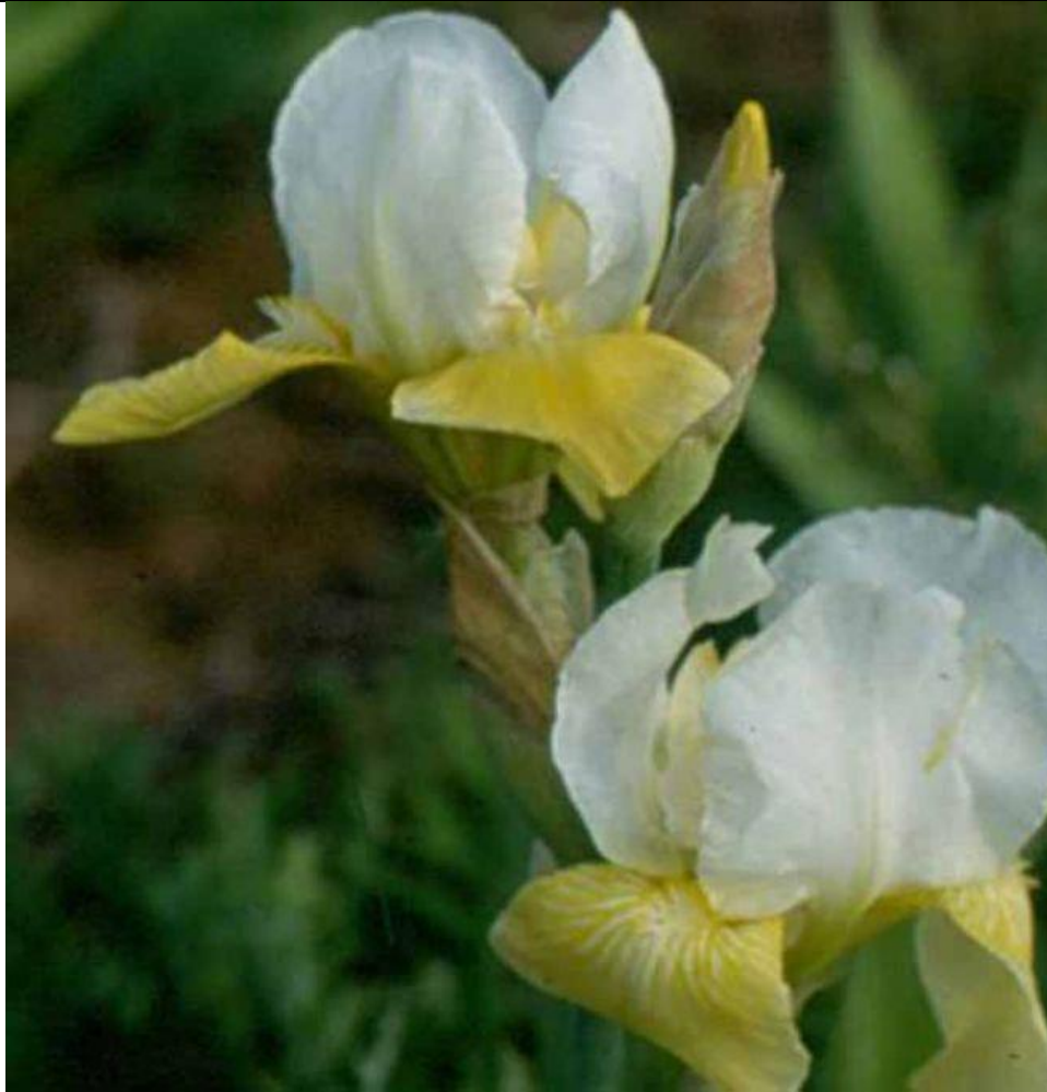
Langport Pinnacle (Intermediate)

Pure white standards and bright lemon falls. A cool colour combination. Large flowers held high above the foliage like many butterflies. Height up to 50cm, and forms a small clump.