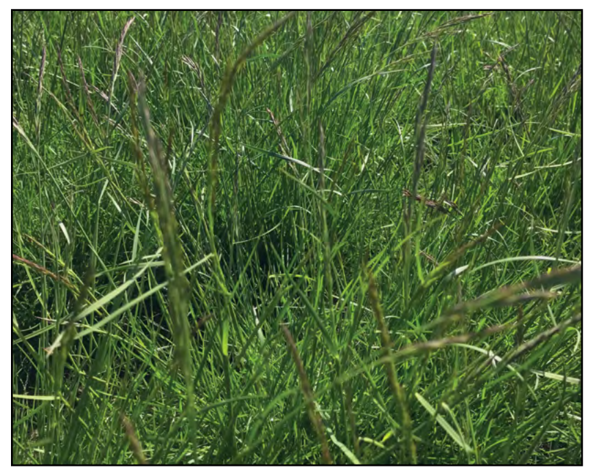
Eugene Creeping Red Fescue has great shade and heat tolerance.

Eugene Creeping Red Fescue is also a very eco-friendly grass that is easy to grow from seed. Creeping Red Fescue is easy on the environment due to low water, mowing and fertilization requirements.