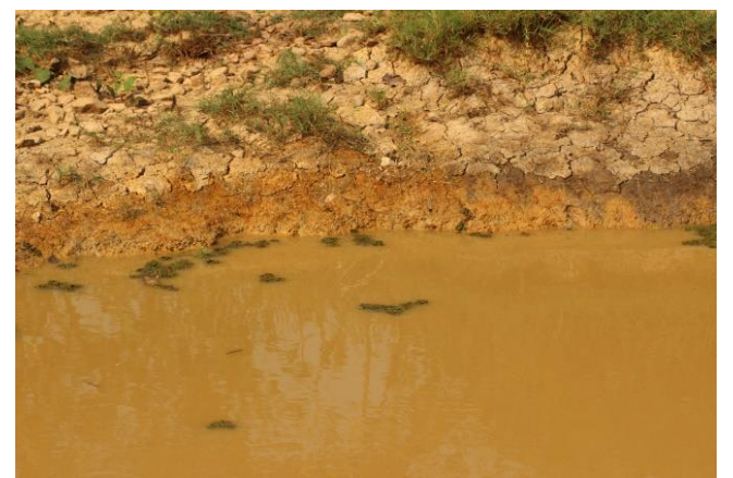
No current, warm water, low oxygen content is another potential habitat for P. ambrosettii

Mentioned waters are not deep or very large in surficial area. Up to one meter of depth and often not more than 30-50 square meters of surface. Population denseness can be incredibly high