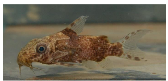
S. contractus