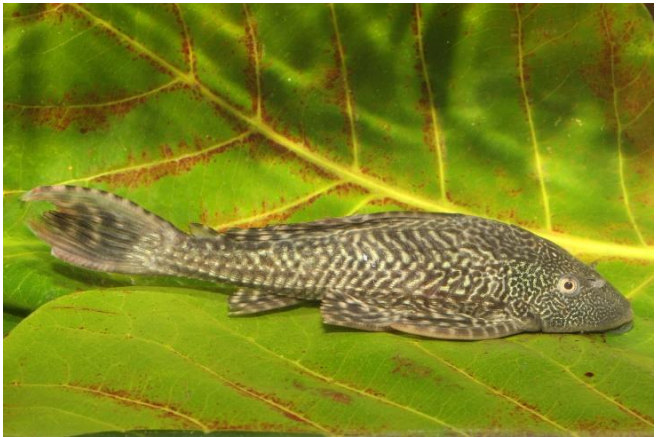
P. ambrosettii juvenile approx. 12cm

though, including numerous juveniles and also plenty adult specimen (e.g.: 40 cm of depth, 35 sqm of surface = 15 individuals between 30 and 40 cm, plus 63 individuals between 8 and 20 cm). While juveniles prefer to hide near the banks, where some emerse vegetation always extends into the water body, adults prefer the open water and tend to not hide at all.