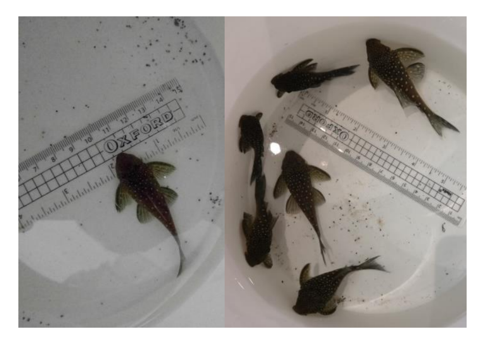
Fry at 1 year ~3 inches TL (Left)- Fry at 2 years ~4 inches (Right)

I can already see some differences between sexes, I'm hopeful they will spawn in the near future, and I have more luck with their eggs and fry!