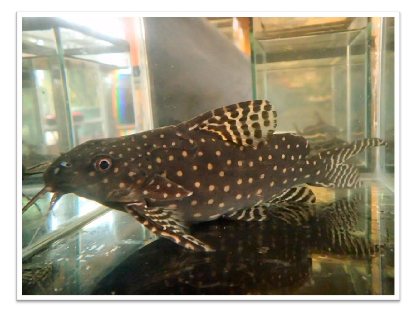
Best fish in show Synodontis angelicus