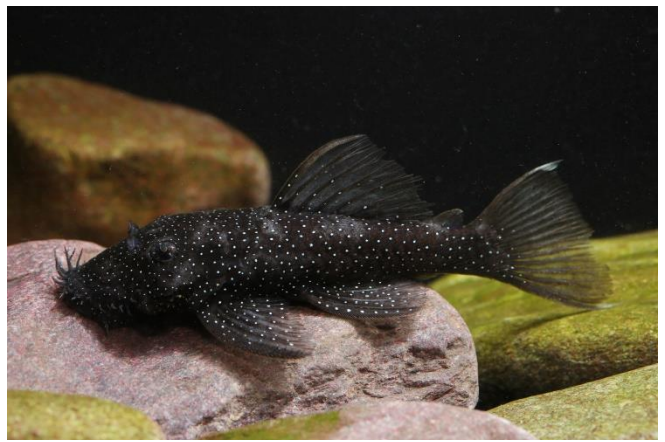
New Ancistrus sp.

distinguishable, since L 255 is even flatter than this fish and the spots are bigger, the head is wider, and the eyes are smaller in comparison.