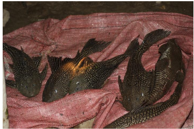
One throw of a cast net!

It's an active species, often seen grazing on the ground or swimming through the open water column and therefore a nice addition to big tanks and outside ponds (TL max. 60 cm). Unfortunately, it might do too well in nature in some countries and should therefore not be kept if it cannot be guaranteed that no individual gets into native waters.