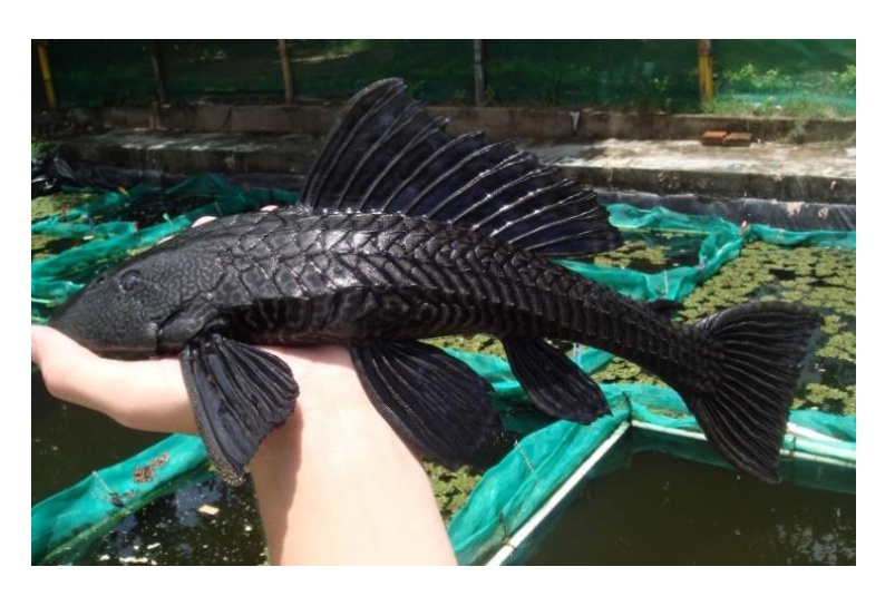
P. ambrosettii male from a clear water pond

- Günther, A. (1864): Catalogue of the fishes in the British Museum. Catalogue of the Physostomi, containing the families Siluridae, Characinidae, Haplochitonidae, Sternoptychidae, Scopelidae, Stomiatidae in the collection of the British Museum. Cat. Fishes, 5: i-xxii + 1-455