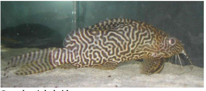
Synodontis hybrid eupterus

The author has reproduced here the holotype and two of the paratypes of S. aterrimus from the 2003 article. One of the paratypes is similar in appearance to the unidentified fish but the holotype (largest specimen) looks quite different. In addition, S. aterrimus reaches 11.5cm TL, whereas the unidentified species seems to have stayed around 6.5cm TL. It is not clear if the specimen in Sands (1983: loose-leaf 56i) is definitely S. aterrimus .