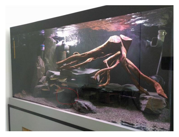
Tank setup (cave where spawning occurred circled in red)

Given my previous experiences I knew if they were to breed it would be a long project, and as the aquarium was in my study I wanted something which would be nice to look at while I was working.