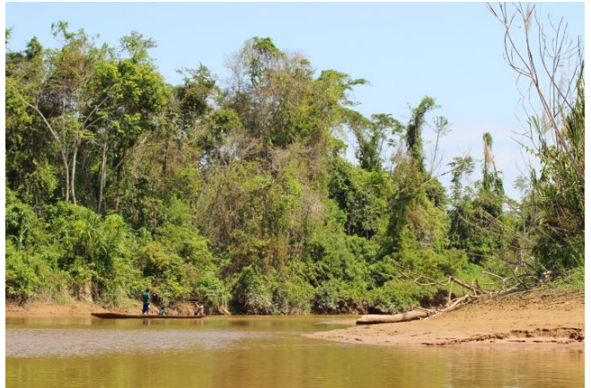
Rio Chipiri home to P. ambrosettii and several large catfish species

My first encounter took place in 2007, when we aimed to check some smaller ponds during the dry season. Those ponds are leftovers of the rainy period of the year and are often inhabited by riverine species, which left the main channel during the flooding and then missed the point of return. Most ponds dry up entirely and the fish die, but before it's rather easy to sample the ponds for their aquatic fauna.