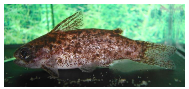
Duringlanis romani male

The genus name means 'Durin Catfish' after Durin The Deathless from the Lord of the Rings Legendarium. Durin was the first created dwarf and the name is used in allusion to the dwarf species in the genus.