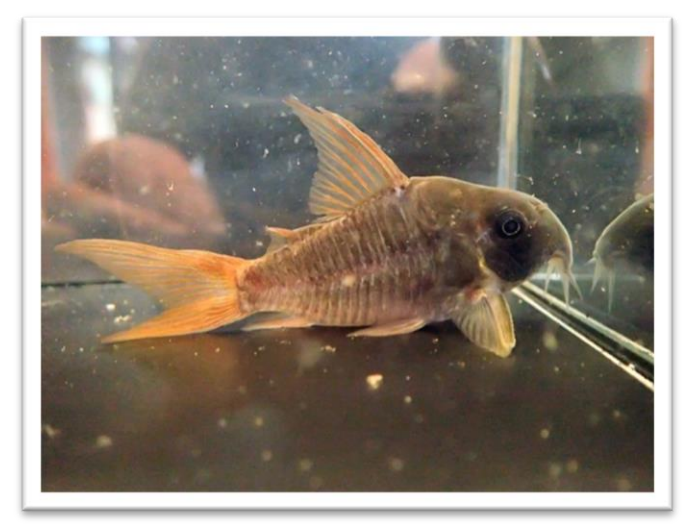
Corydoras concolor, 3rd best in show