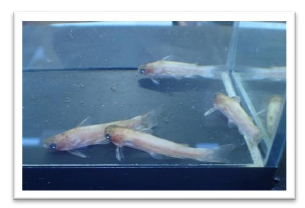
Tatia dunni, white form