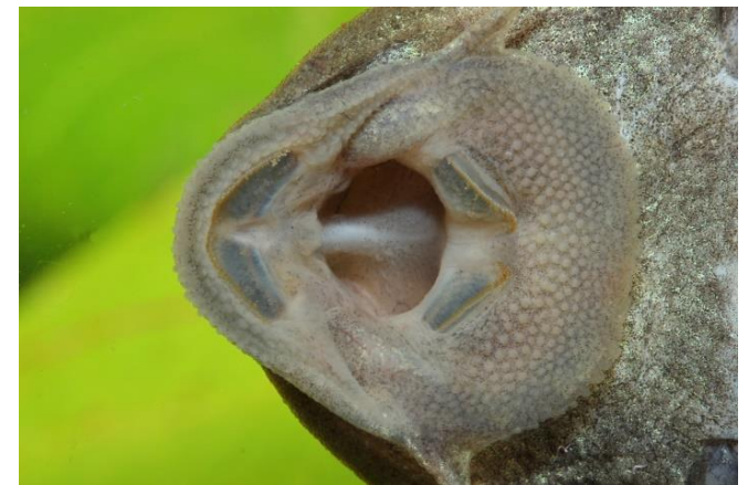
P. ambrosettii dentition

P. ambrosettii is not being imported on purpose, but from time to time a blind passenger in shipments from Paraguay. It serves great as a low maintenance pleco for unheated tanks and ponds, it is something special and difficult to get. If you get the chance, go for it.