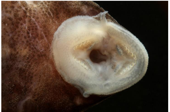
Panaqolus L351 dentition

The only negative aspect is that L 351 is a woodeater, just as all Panaqolus and this shows whenever the filter needs to be cleaned. Some of the specimen I know and keep are now 19 years old and have been imported in semiadult stadium already. It still must show if L 351 represents the same species as L 329 and if one or tow of these possibly are the same species as P. nocturnus , or if they only share a similar morphology.