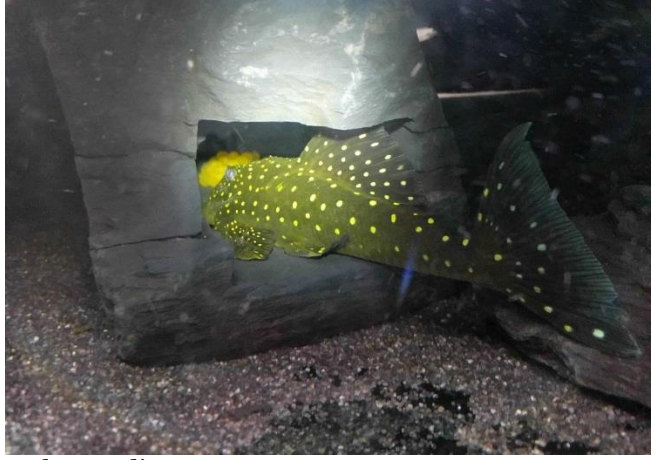
Male guarding eggs

Unfortunately, although the eggs developed well for the first few days, and many hatched 6 days after I found the eggs, none of the wrigglers made it to the point of fully absorbing their yolks.