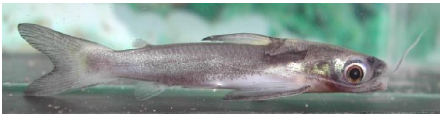
Centromochlus heckelii male

Calegari et al. (2019) recently published a monumental phylogenetic study of the family Auchenipteridae, also known as driftwood catfishes. The study combines morphological characters and DNA and resulted in a new classification of the family, particularly in the subfamily Centromochlinae.