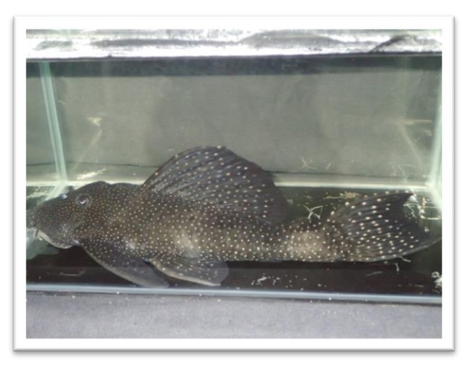
Leporacanthicus sp. L240a, 2<sup>nd</sup> best in show