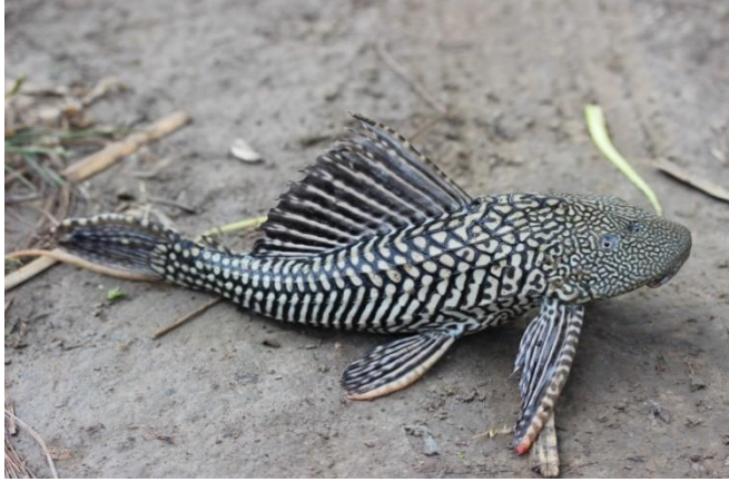
P. ambrosettii from a white water river

It's striking feature is the pattern. A black base colour is not uncommon in Loricariids, but few species have large white stripes on top and no other species has a reddish colouration on the tips of all fins. That's the best case to be honest.