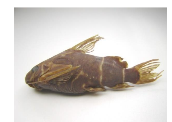
S. aterrimus paratype 98694 - Emmanuel Vreven

The author has reproduced here the holotype and two of the paratypes of S. aterrimus from the 2003 article. One of the paratypes is similar in appearance to the unidentified fish but the holotype (largest specimen) looks quite different. In addition, S. aterrimus reaches 11.5cm TL, whereas the unidentified species seems to have stayed around 6.5cm TL. It is not clear if the specimen in Sands (1983: loose-leaf 56i) is definitely S. aterrimus .