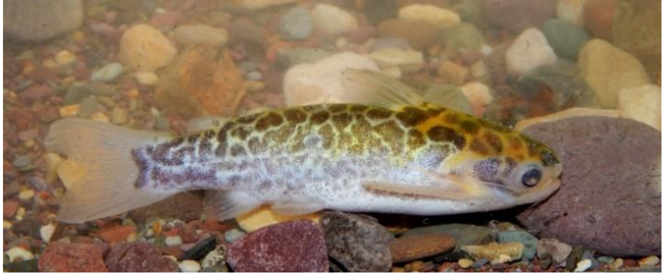
Duringlanis sp. Madre de Dios region