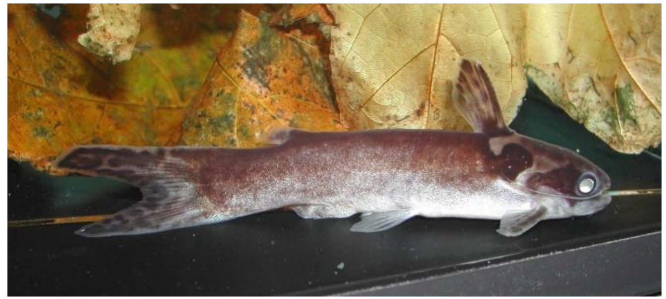
Tatia brunnea male