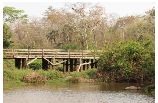
P. ambrosettii biotope

My first encounter took place in 2007, when we aimed to check some smaller ponds during the dry season. Those ponds are leftovers of the rainy period of the year and are often inhabited by riverine species, which left the main channel during the flooding and then missed the point of return. Most ponds dry up entirely and the fish die, but before it's rather easy to sample the ponds for their aquatic fauna.