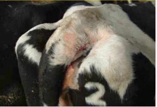
Figure 3: Chorioptic mange on the tail head

Transmission from host-to-host is primarily by physical contact, but may also occur through contact with a contaminated environment, such as bedding, housing or trailers etc.