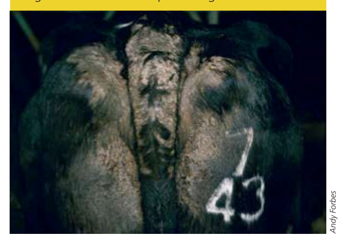
Figure 8: Chronic sarcoptic mange

Problems caused by infestation with Demodex bovis mites in cattle are primarily a result of damage to the hides and are usually only seen after slaughter. However, in some cases, infection may become generalised and fatal.