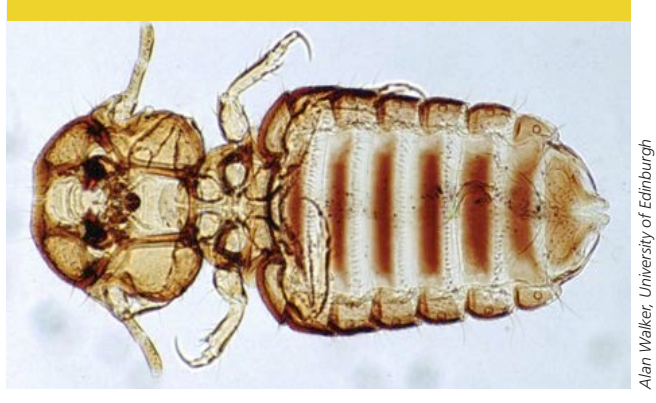
Figure 1: A chewing louse of cattle

Figure 2: A sucking louse of cattle ( Linognathus vituli )