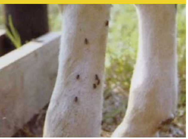
Figure 10: Flies clustering on the leg of a cow

blood-feeding flies may also provoke hypersensitivity reactions.